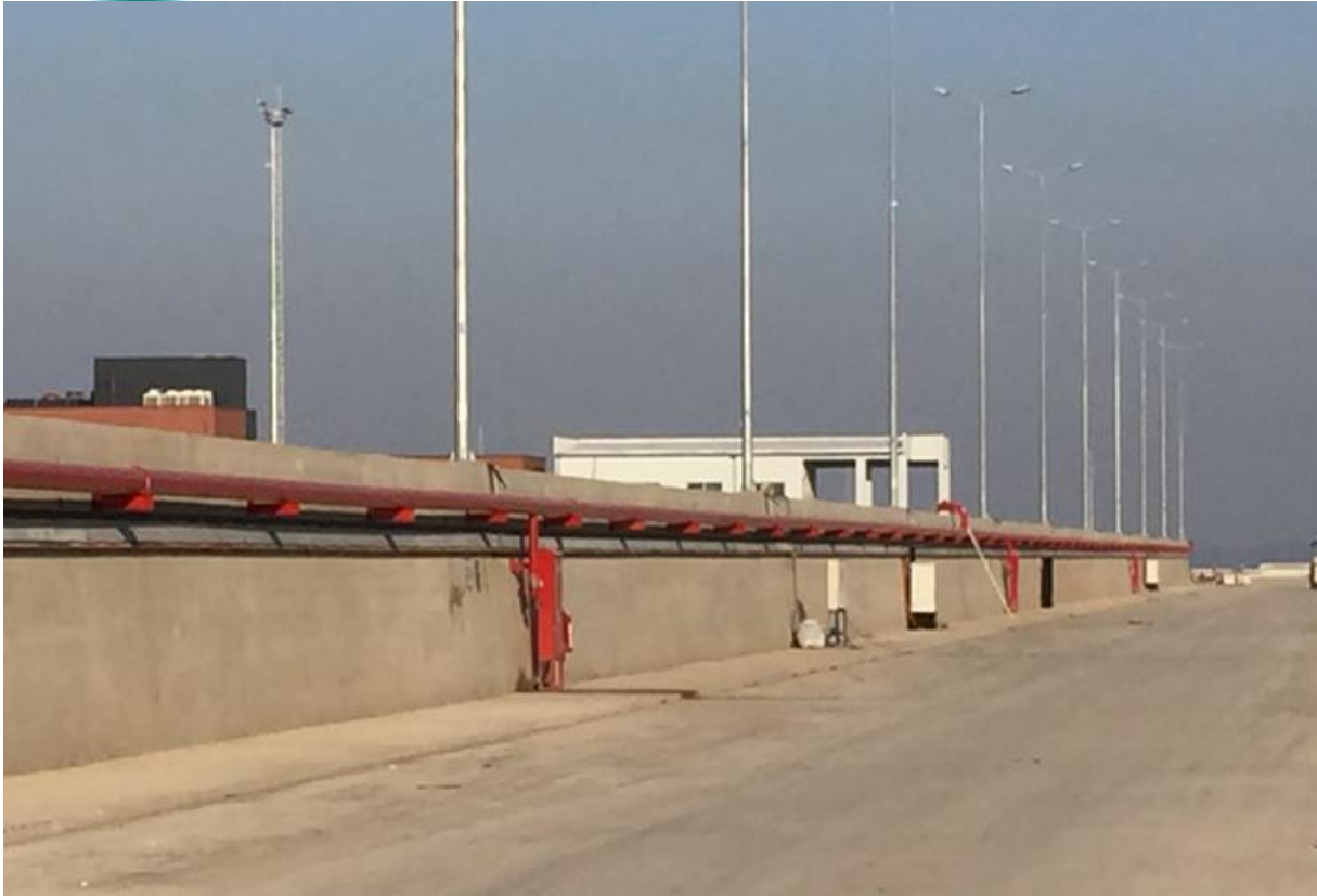
ST37 Carbon Steel, SS316 Stainless Steel Pipeline Intallation, Fire Cabinet and Hydrant Installation