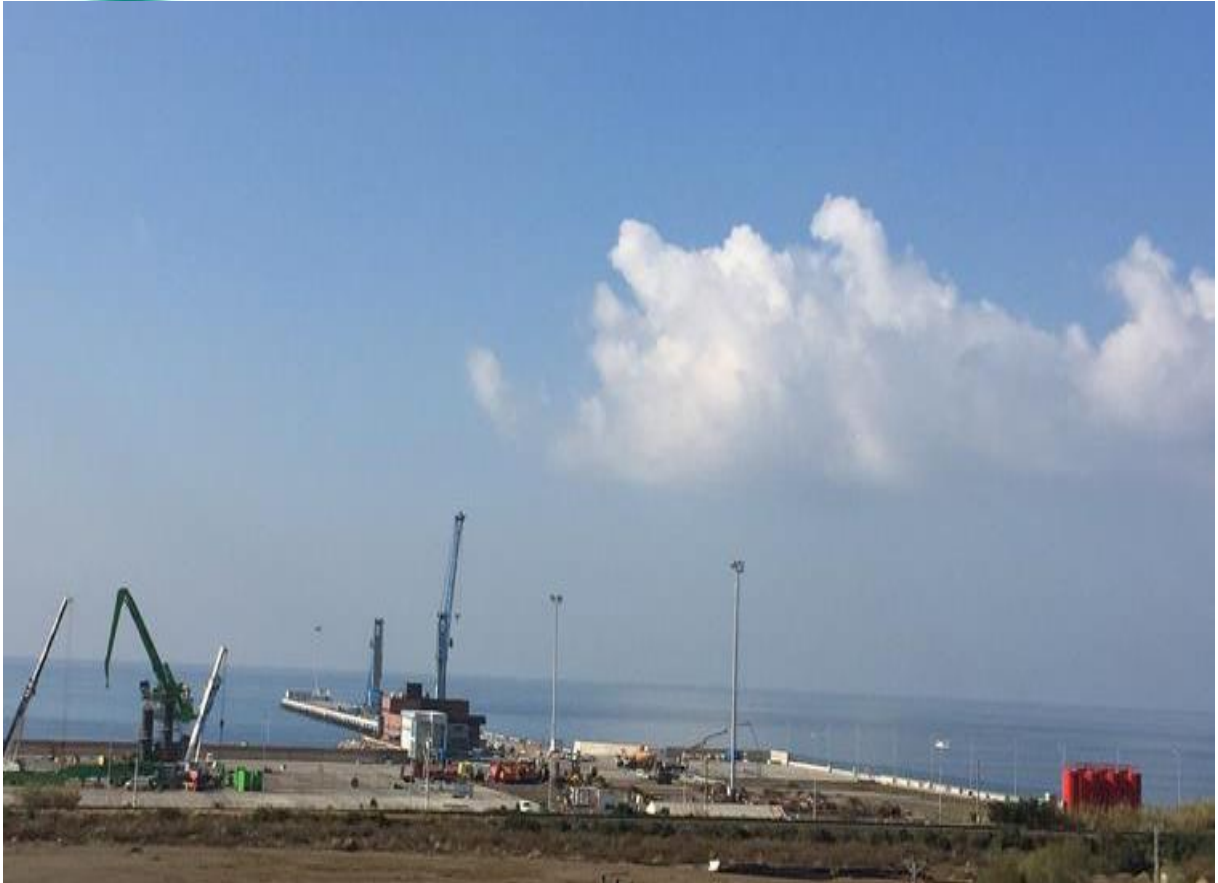
Atakaş Port Side General Appearance