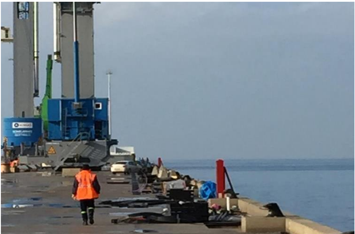
Port Side PE100 and SS316 Stainless Steel Pipeline , Firefight Hydrant and Fire Cabinet Installation