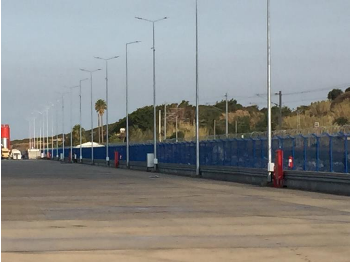
Firefight Hydrant and Fire Cabinet Installation