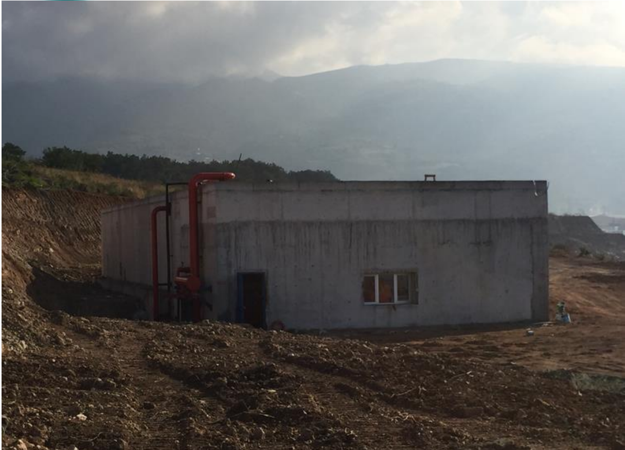
Firefighting Raw Water Basin