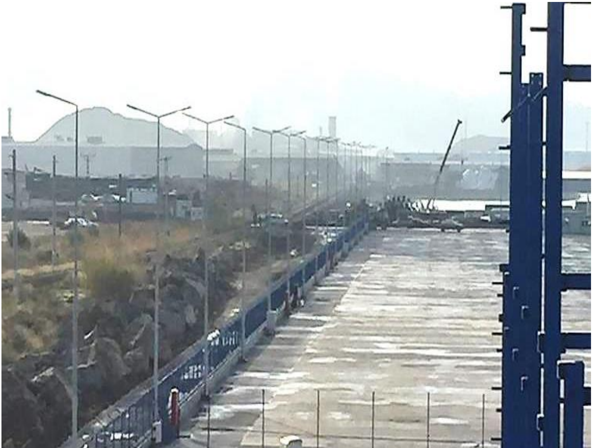
Firefight Hydrant and Fire Cabinet Installation