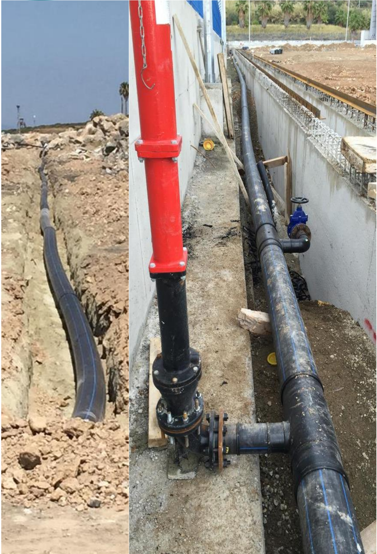
Excavation , PE 100 Pipeline Intallation,Hydrant Installation