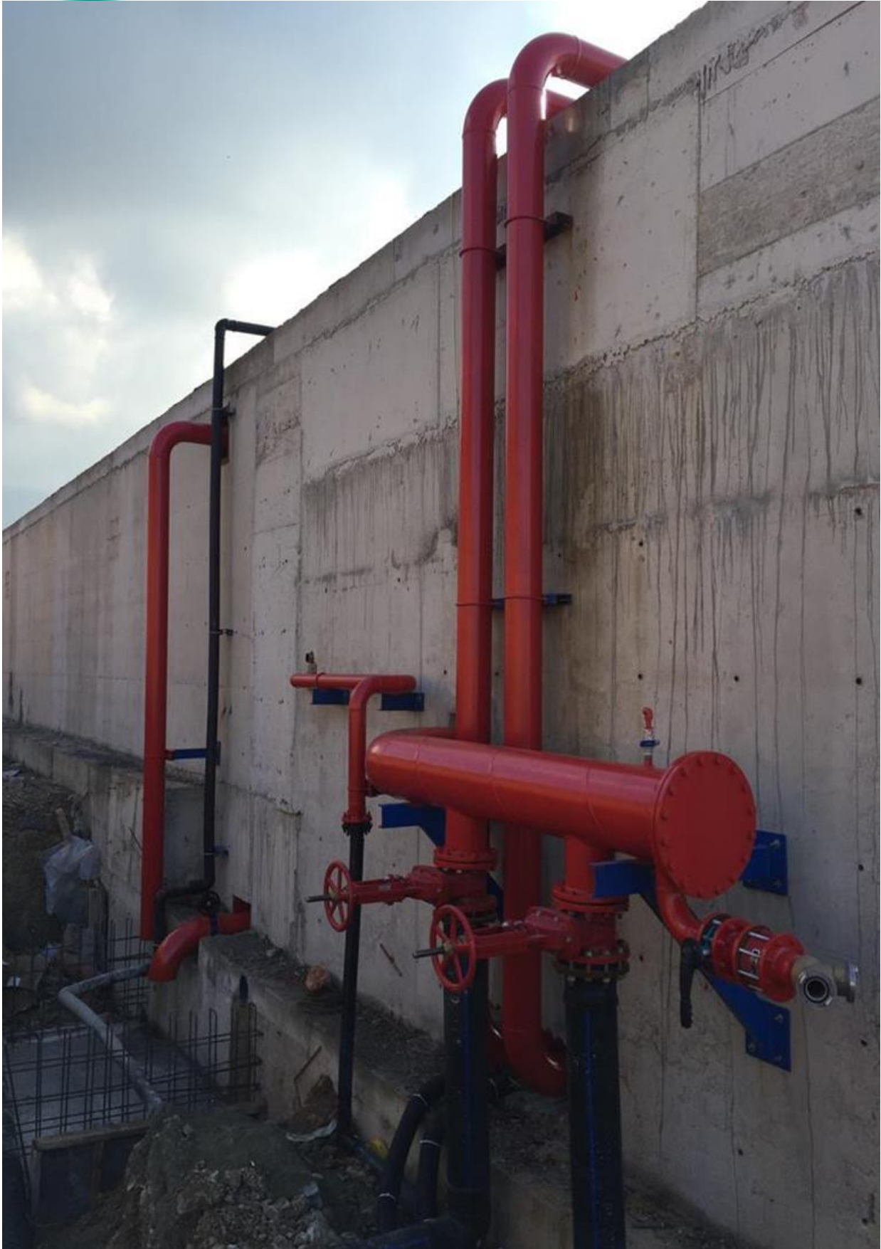
Firefighting Main Water Distribution Collector