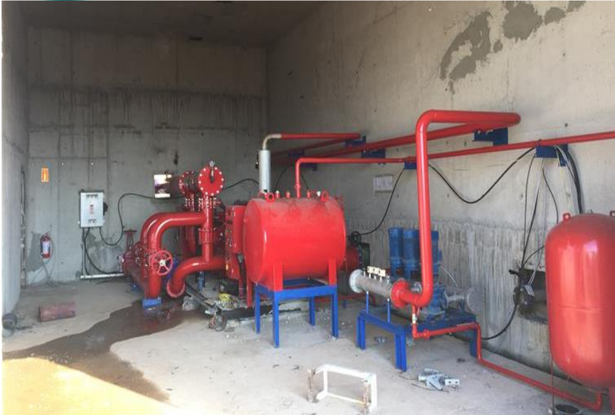
Firefighting Pump Station Installation