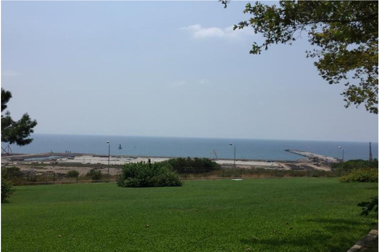
Atakaş Port Side General Appearance