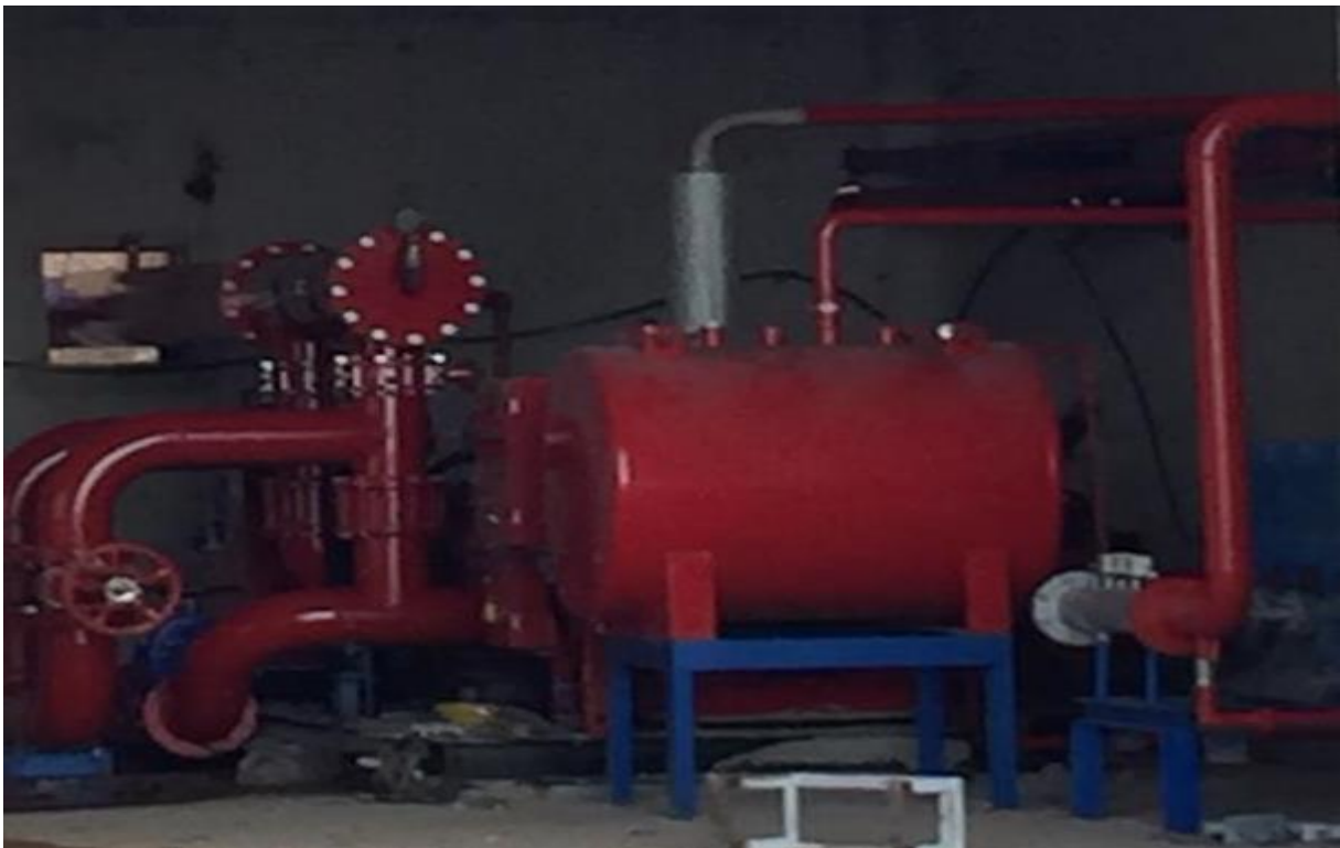
Firefighting Diesel Pump Installation