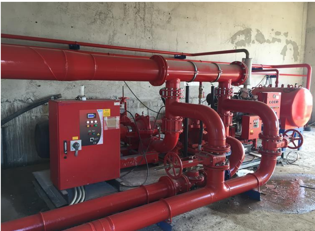
Firefighting Pump Station Installation