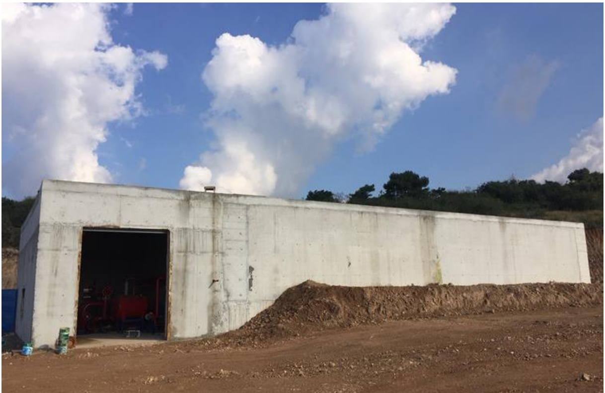
Firefighting Raw Water Basin