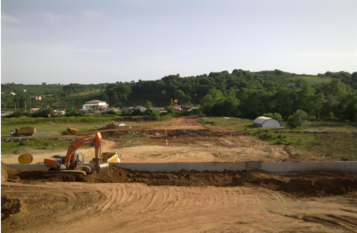
Landfill working to adjustment of level