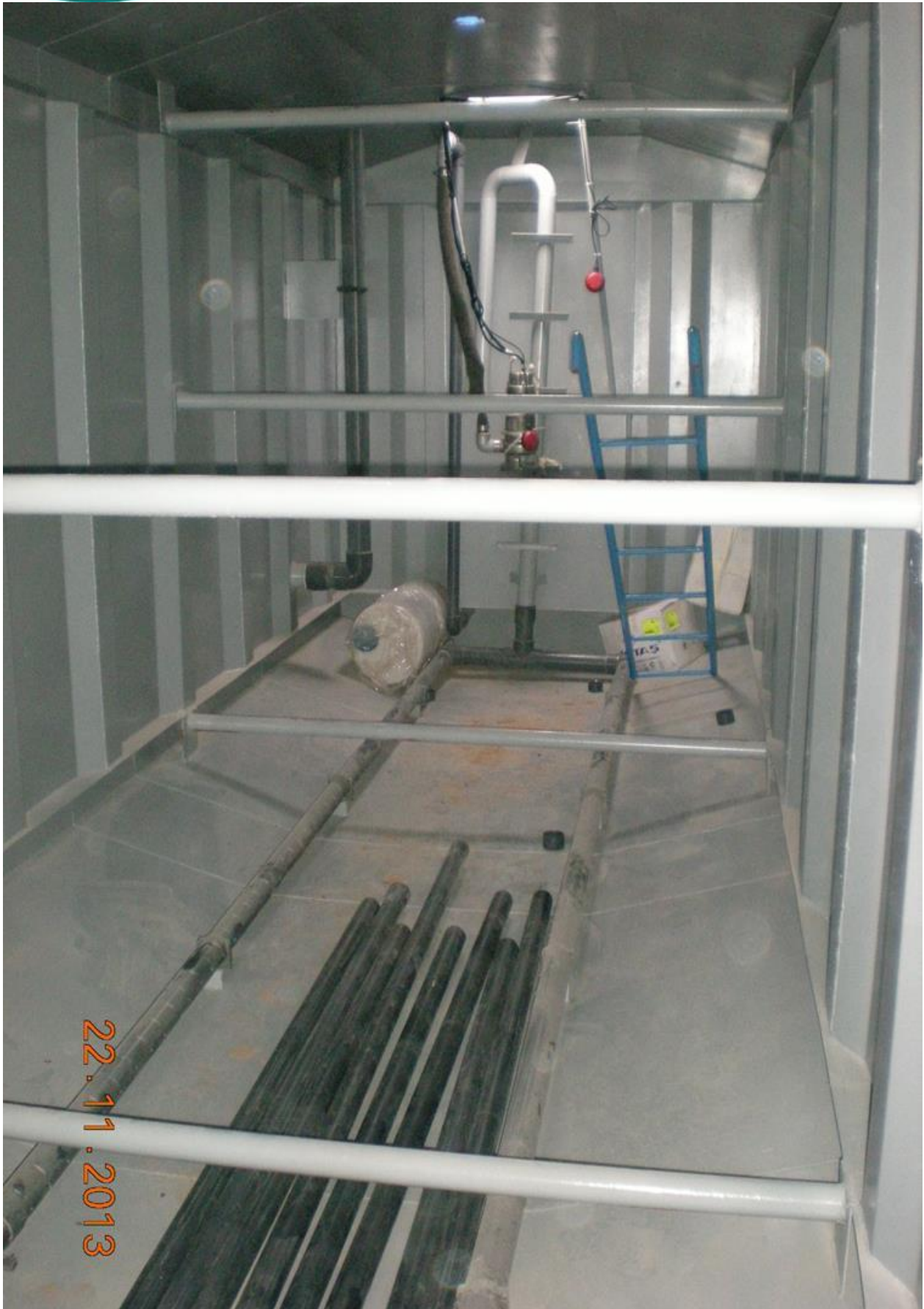
Reactor Pipeline and Chemical Dosing Line Installation and Electrical Connection