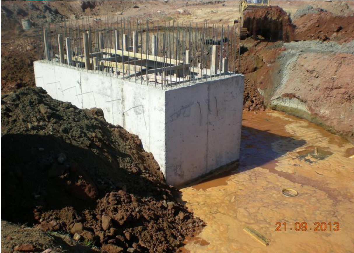
Booster Tank Concrete