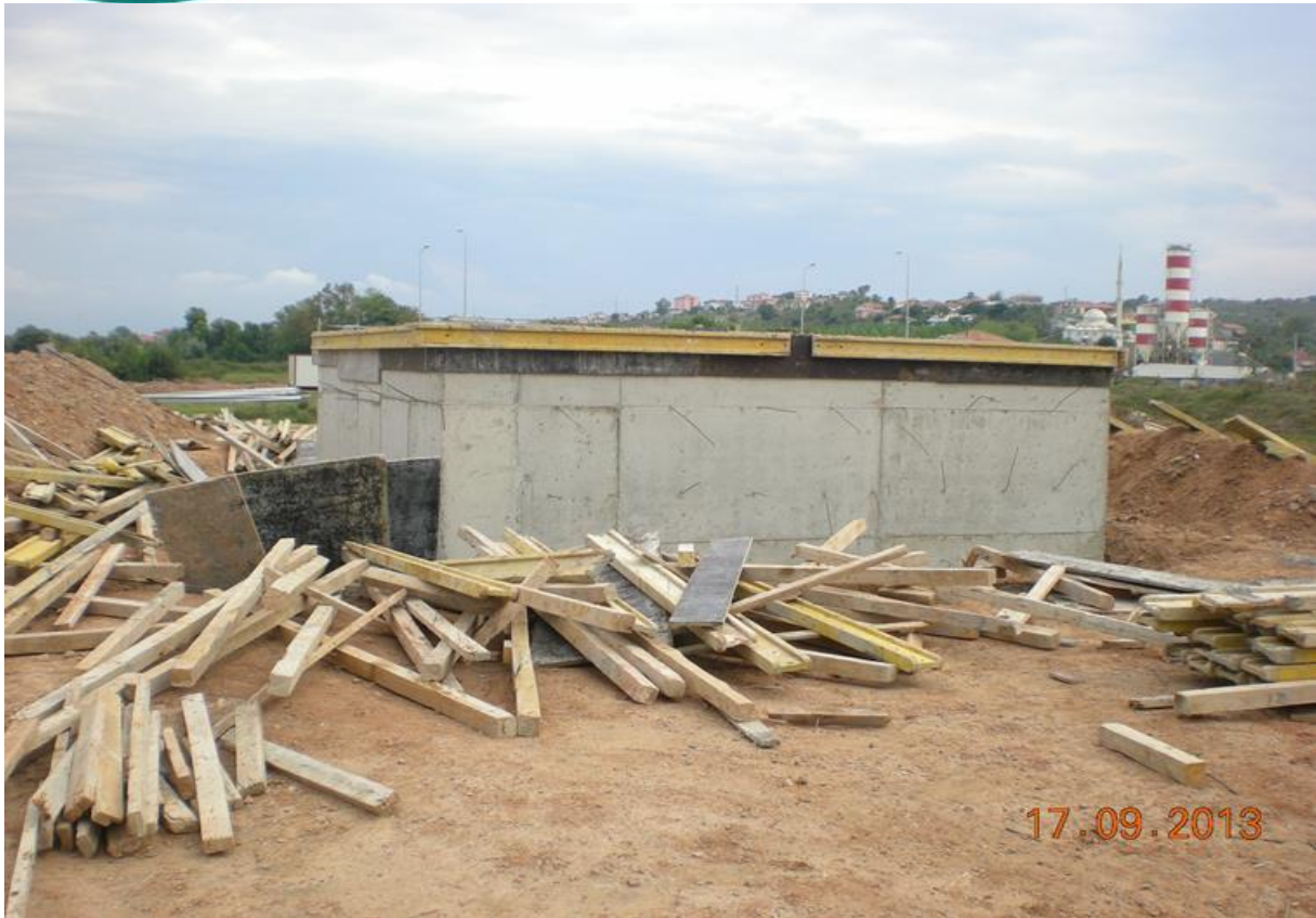
Balancing Tank Concrete