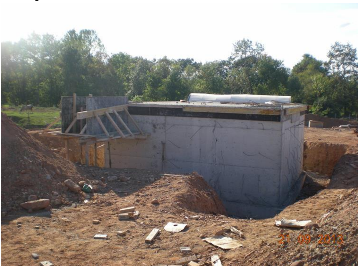
Balancing Tank Concrete