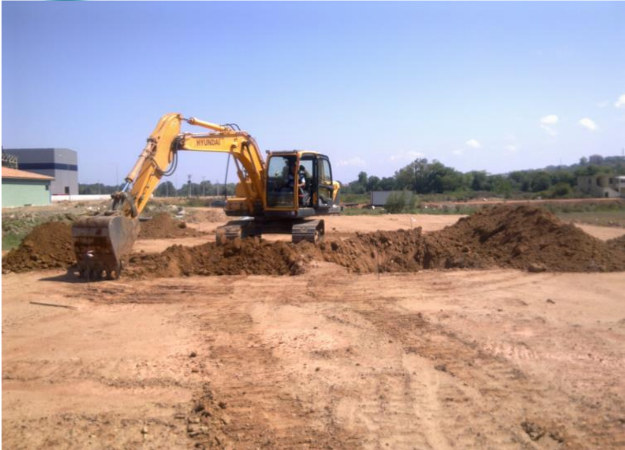
Side Excavation Works