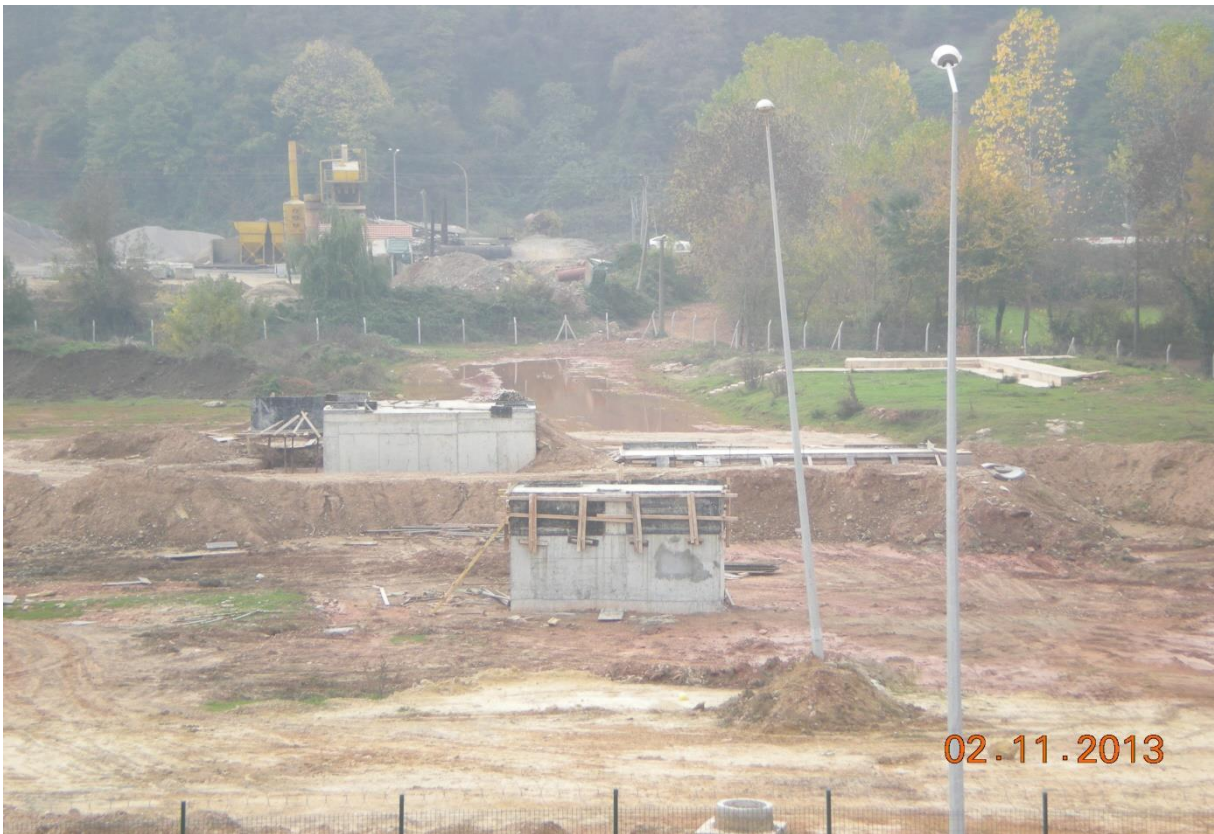
Wastewater Treatment Area General Appearance