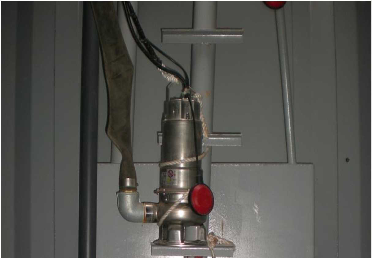
Reactor Submersible Pumps Installation Electrical Connection