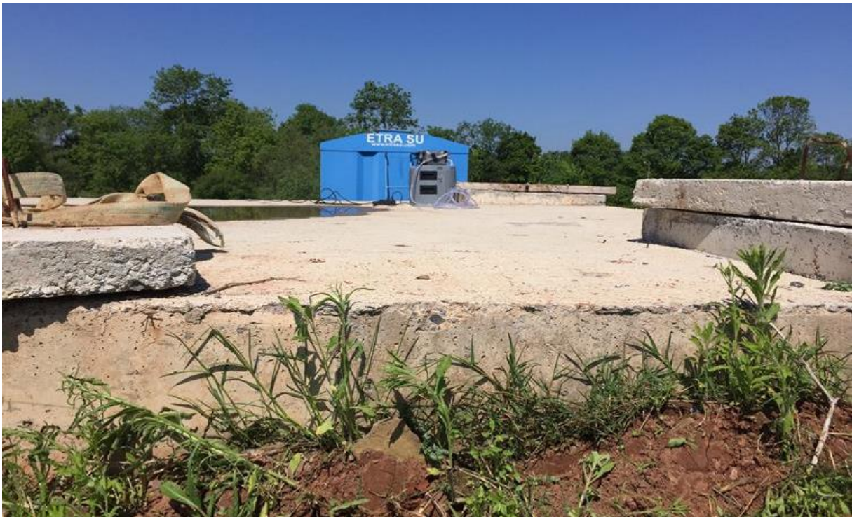
Wastewater Treatment Plant Sample and Discharge Point