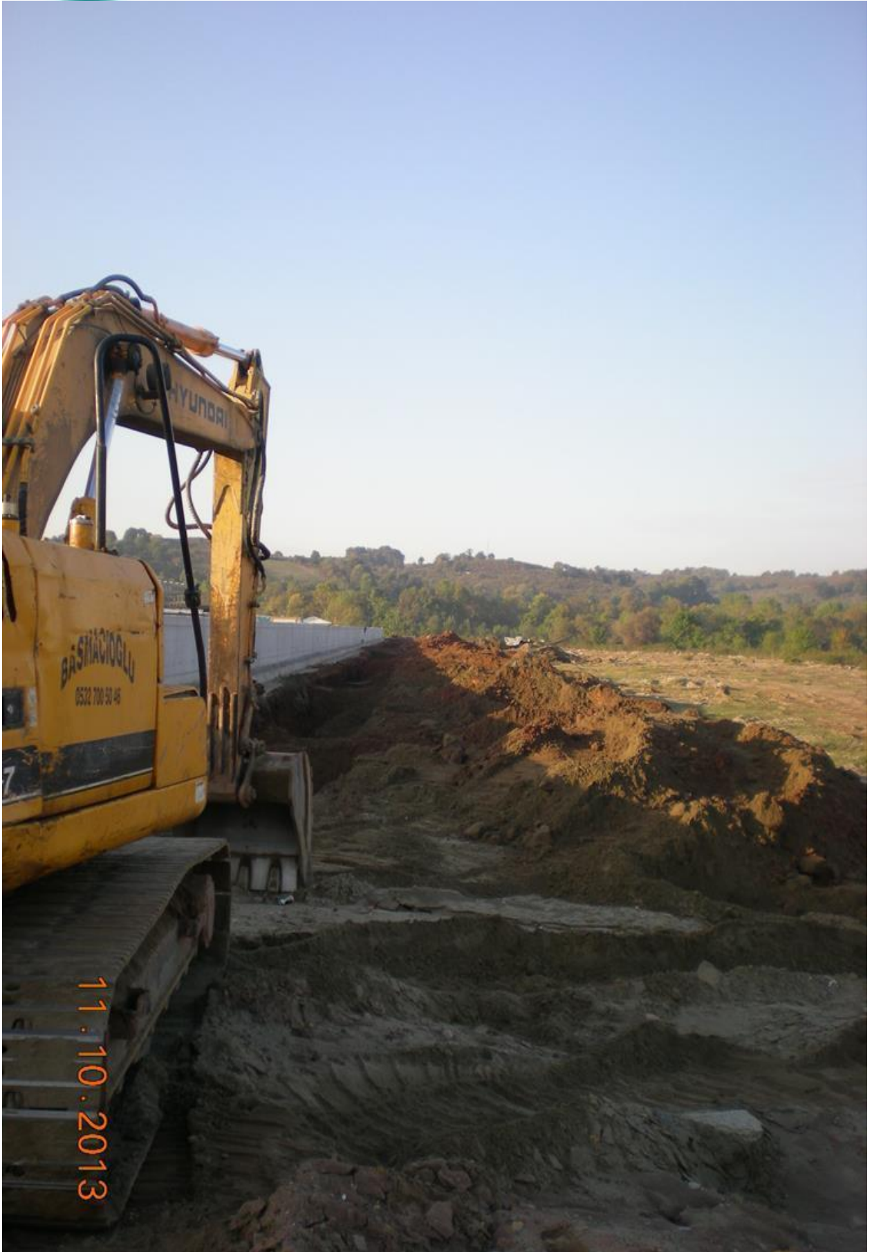
Wastewater Treatment Discharge Pipeline Excavation