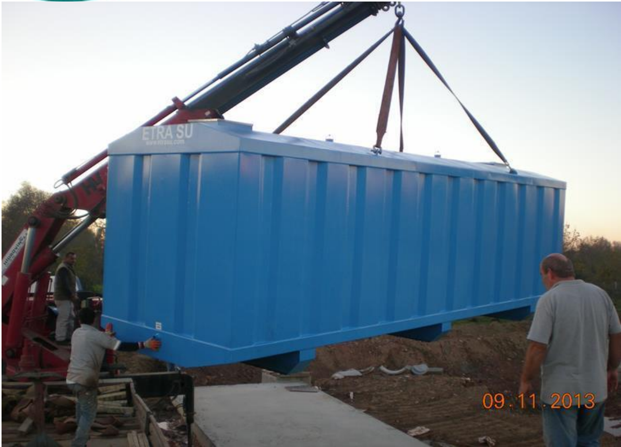
Biological Reactor Instalation