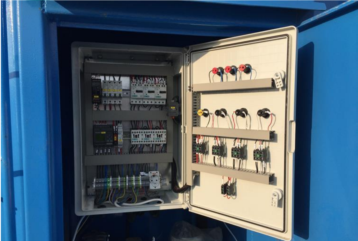
Electric MCC/PLC Panel Installation