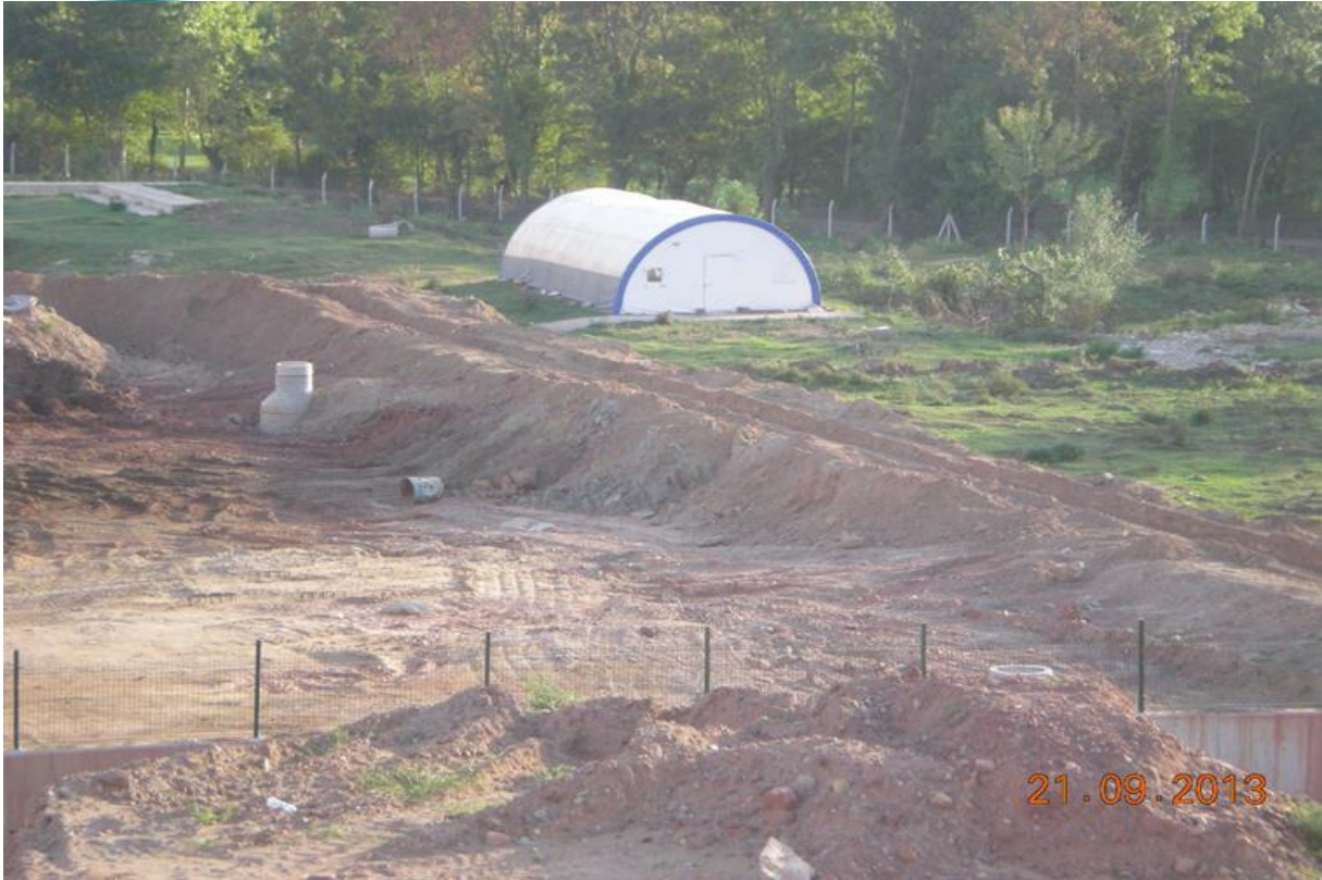
Wastewater Treatment Discharge Pipeline Excavation