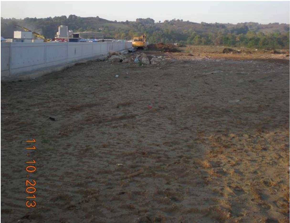
Wastewater Treatment Discharge Pipeline Excavation