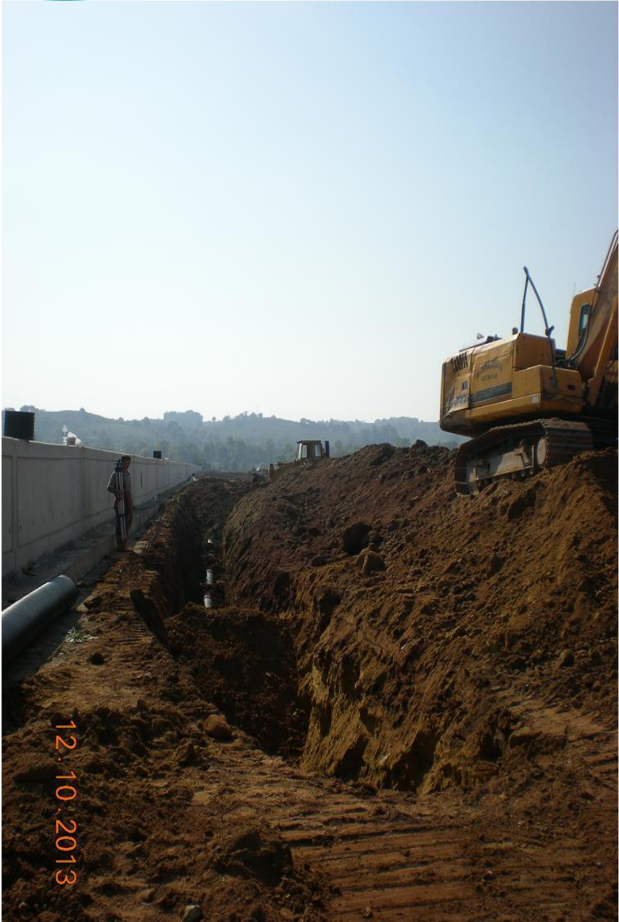
Covering of the Discharge Pipe