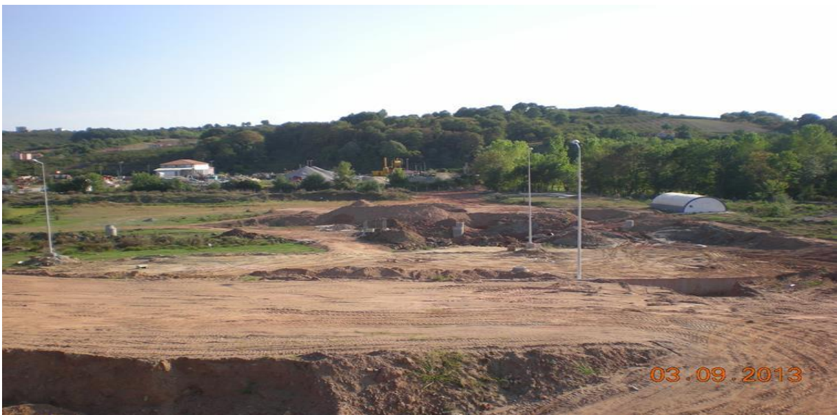
Landfill working to adjustment of level