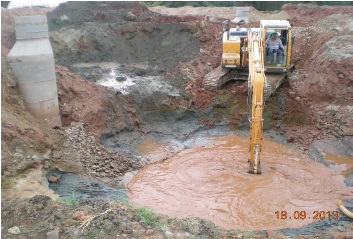
Basic Concrete Excavation Works