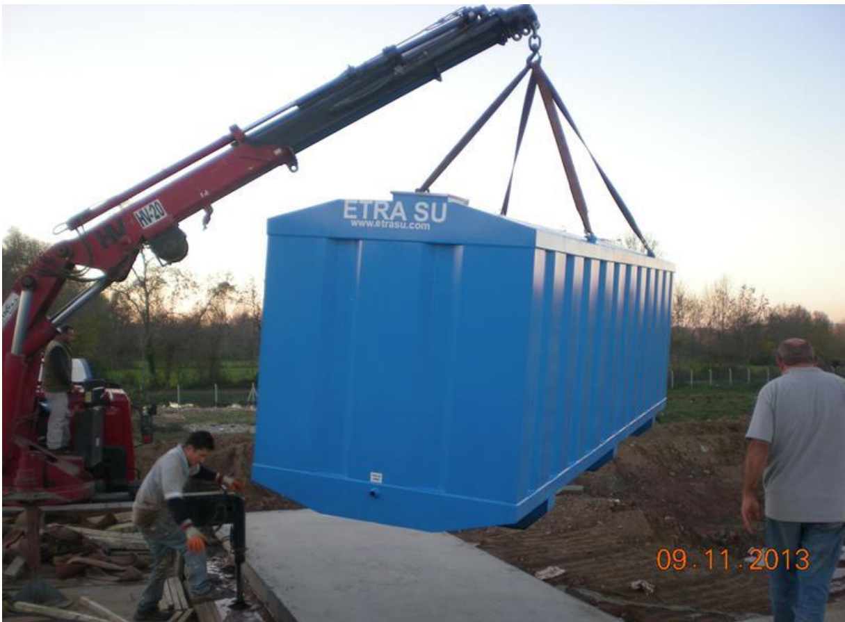
Biological Reactor Instalation