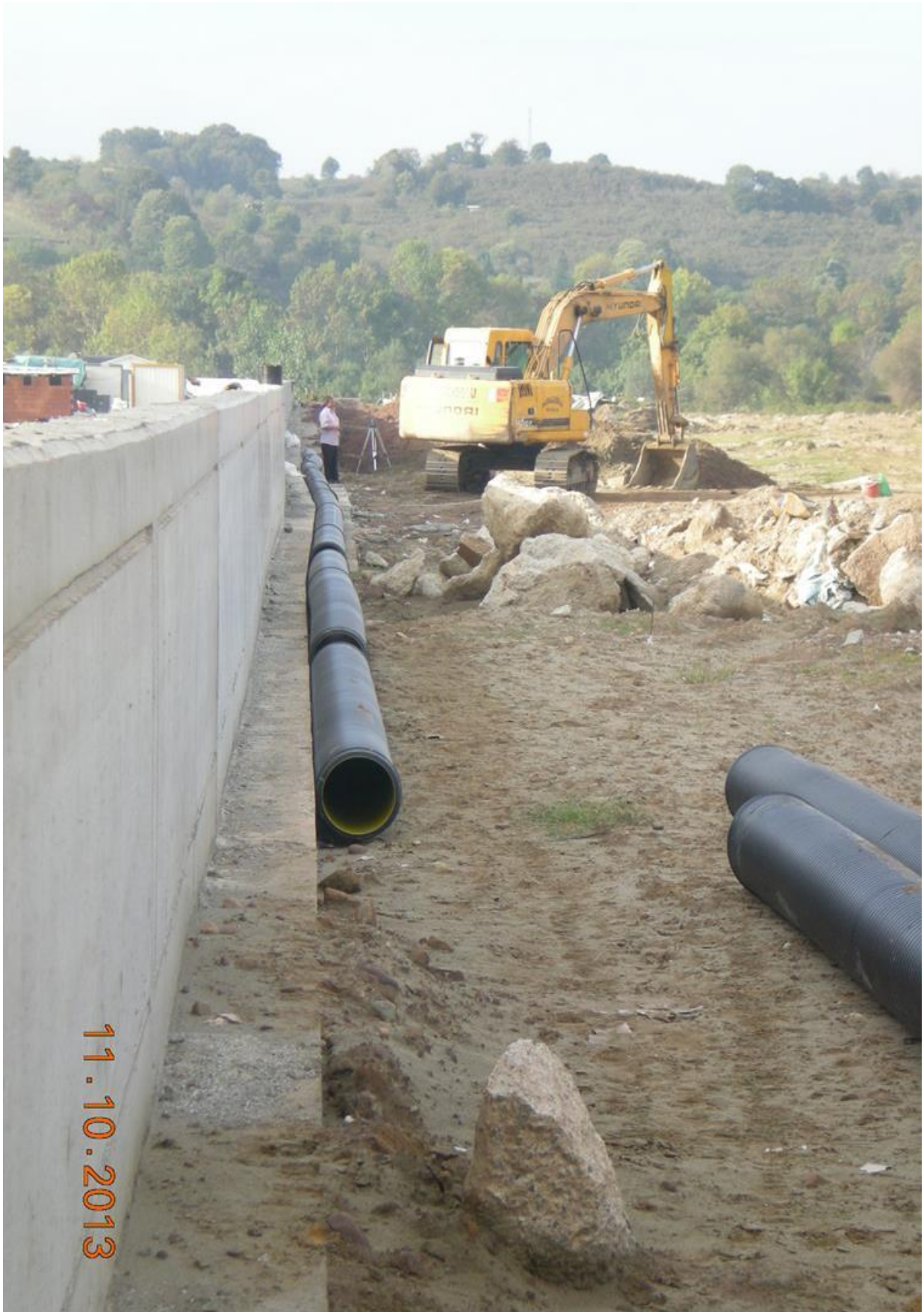
Wastewater Treatment Discharge Pipeline