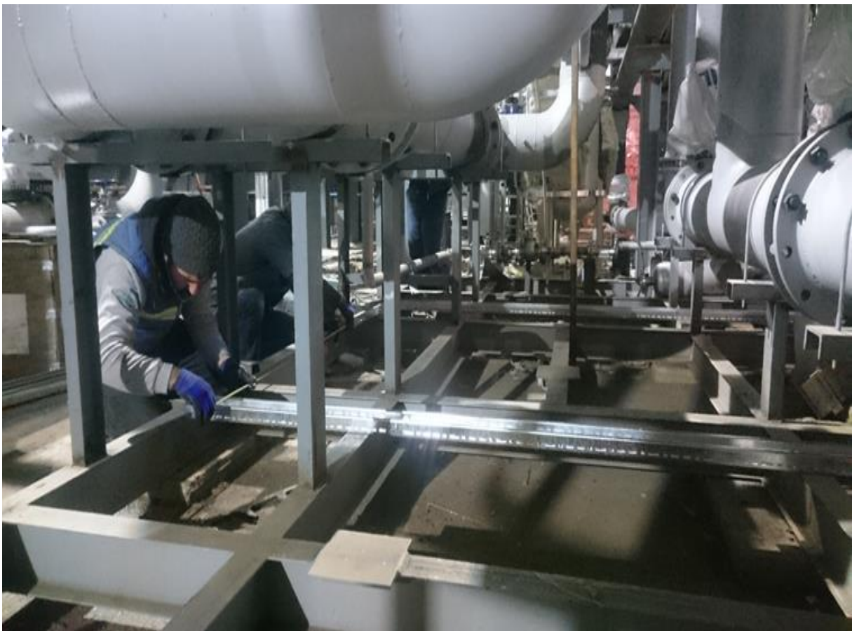
Cable Tray Installation to Instruments