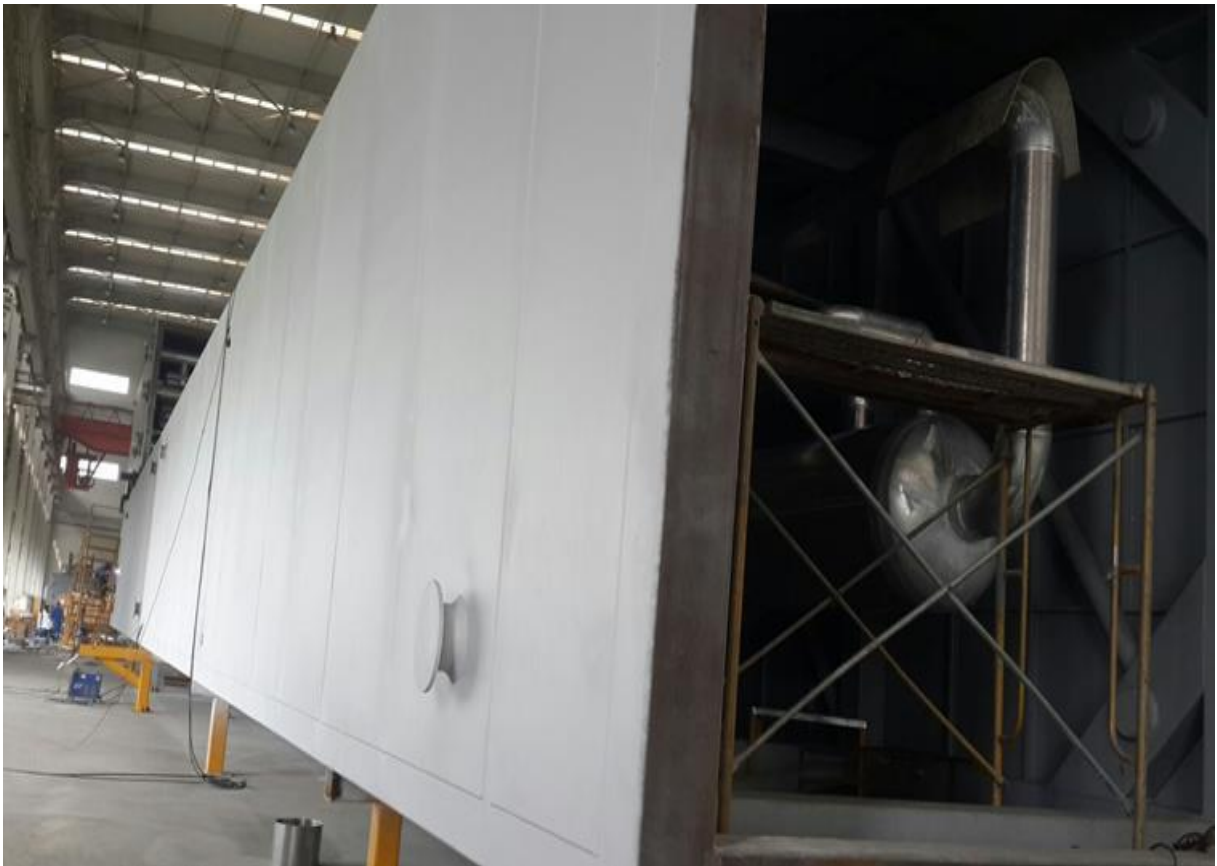
Cold Box Production (SASPG ASU Co.)