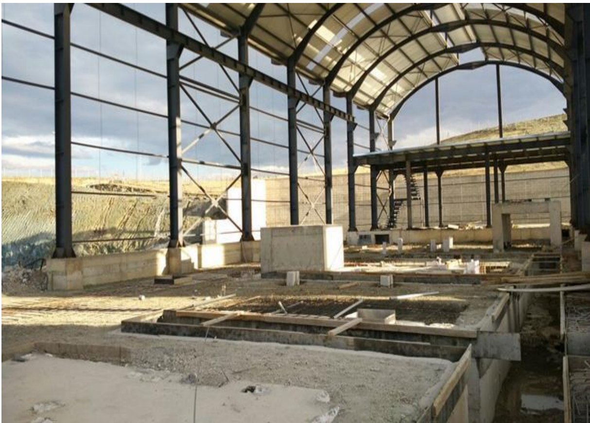
Turbine and Compressors Base Concrete , Pipeline And Electrical Cable Galery