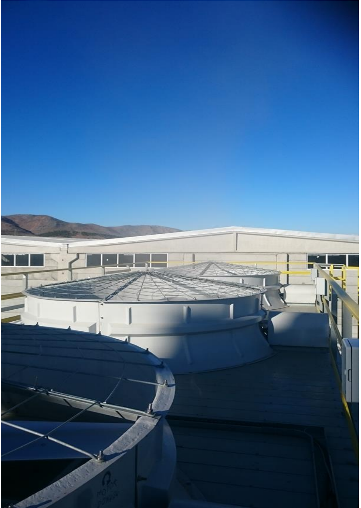
Cooling Tower Fans Installation