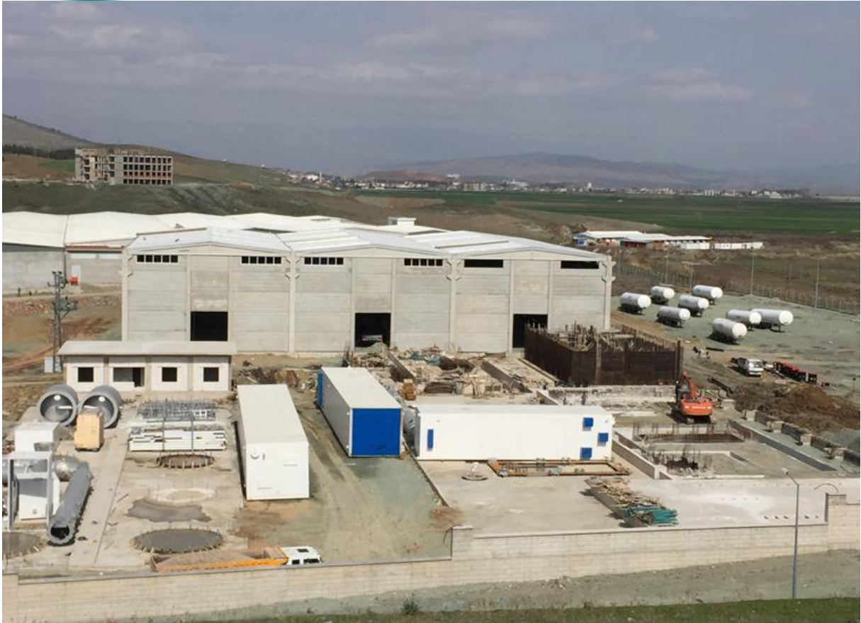
Water Cooling Tower Water Basin and Transformer Room Concrete