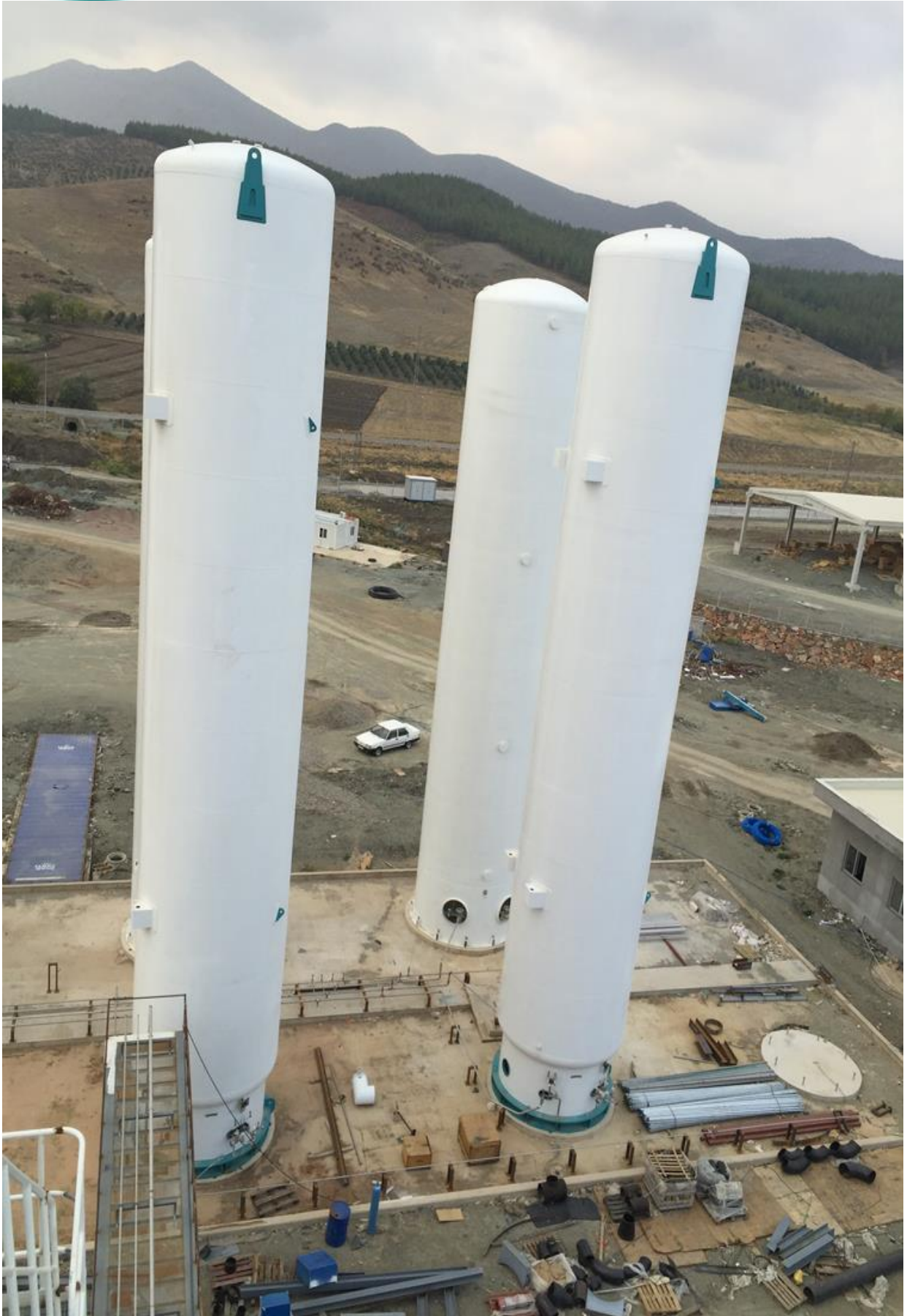
Storage Tank and Stainless Steel Product Pipeline Installation