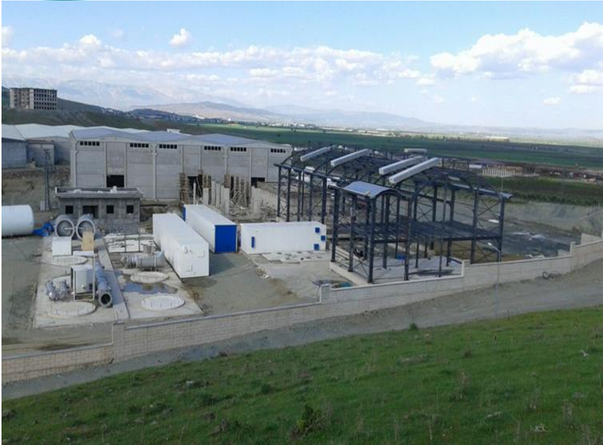
Air Separation Plant General Appearance