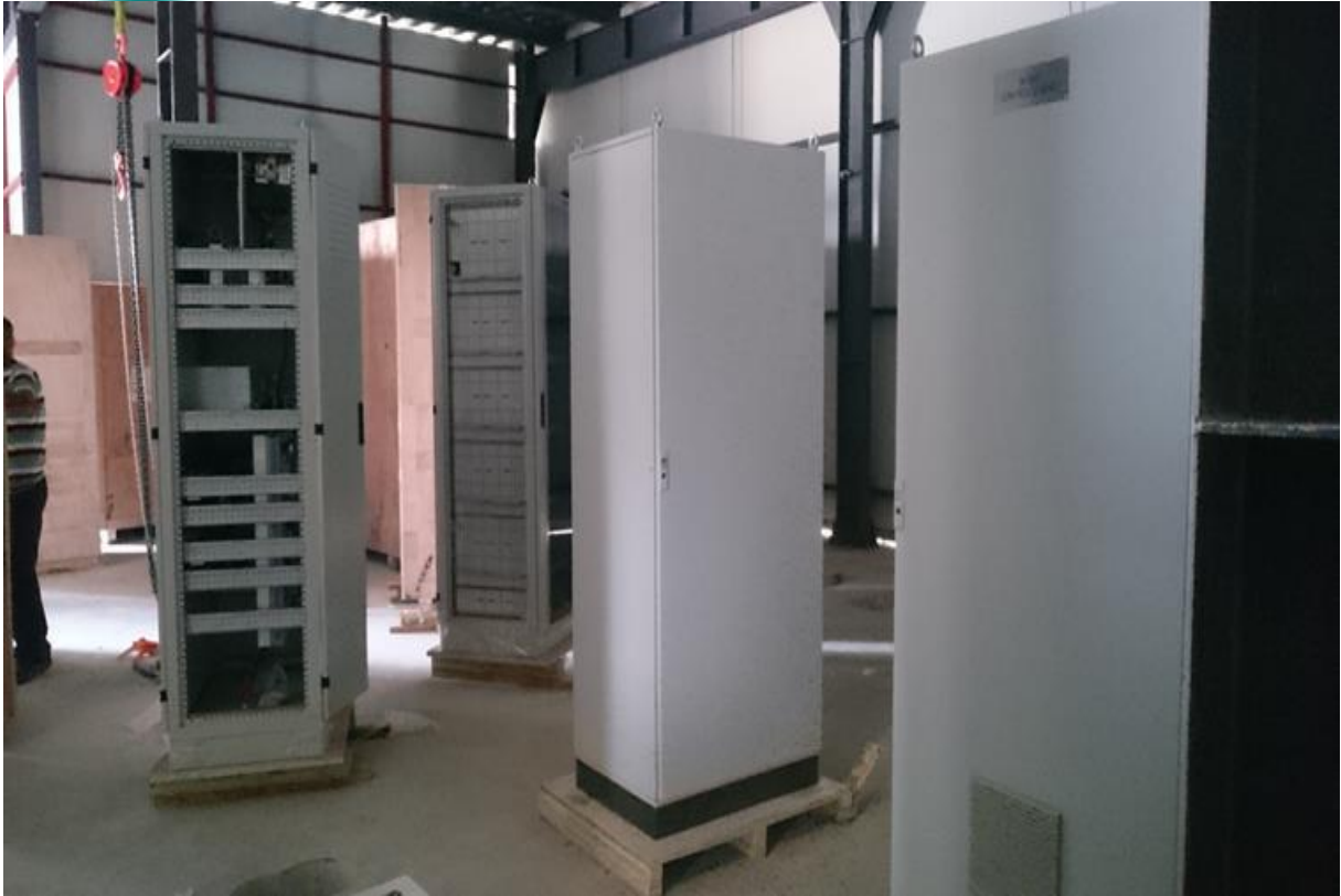
Electricity MCC/ DCS / PLC Panels