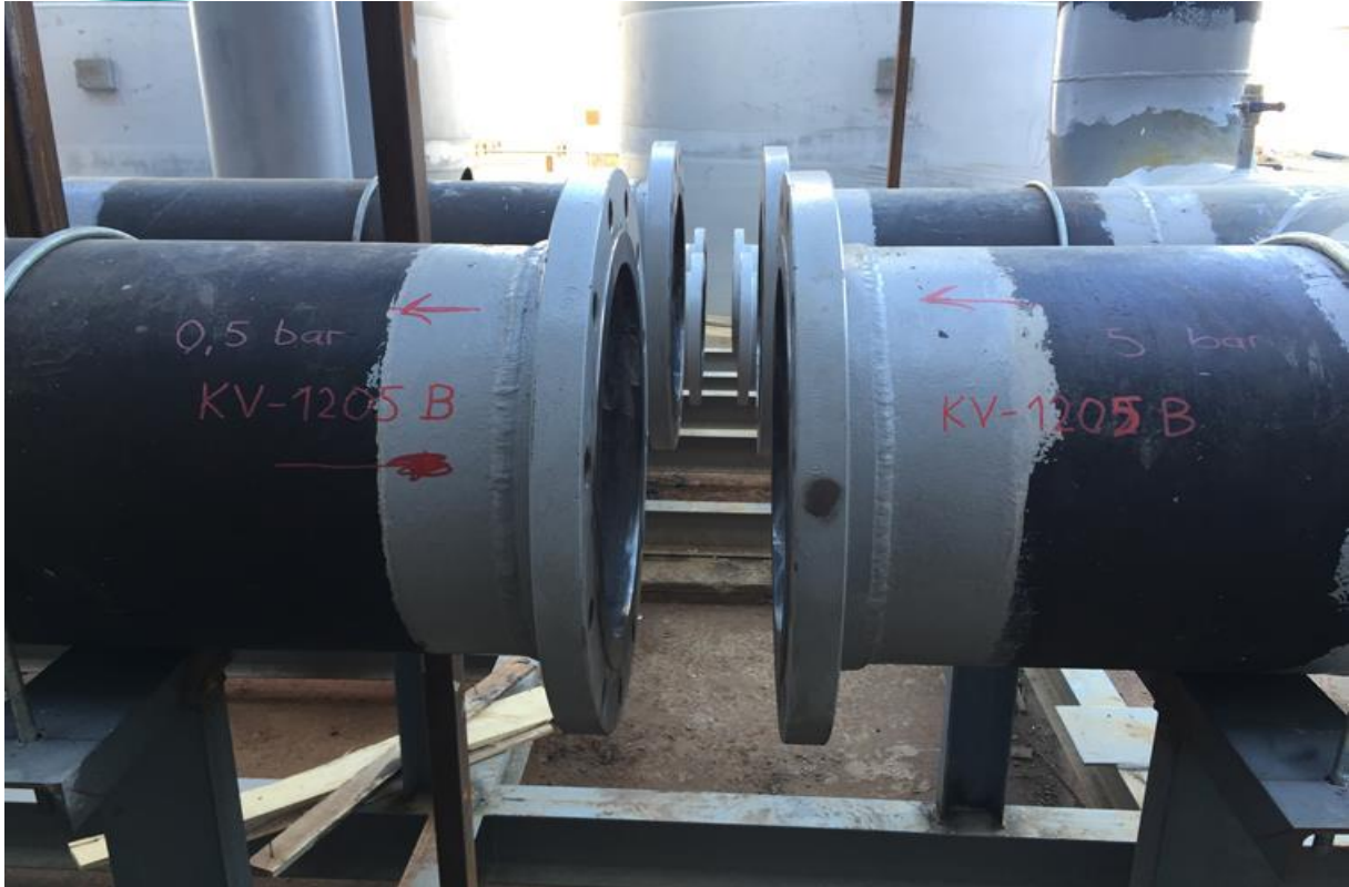
Valve Skid and Valve Installation