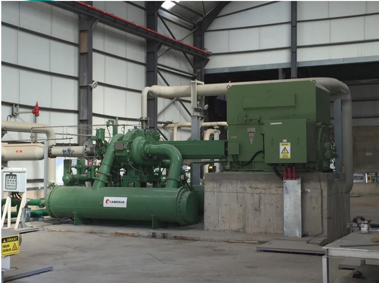
Main Compressor and Booster Compressor Commissioning with Supervisor