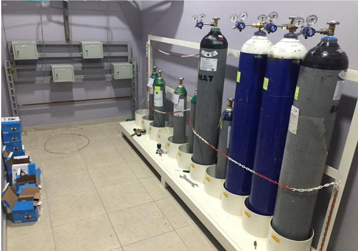
Product Calibration Gases Room Installation