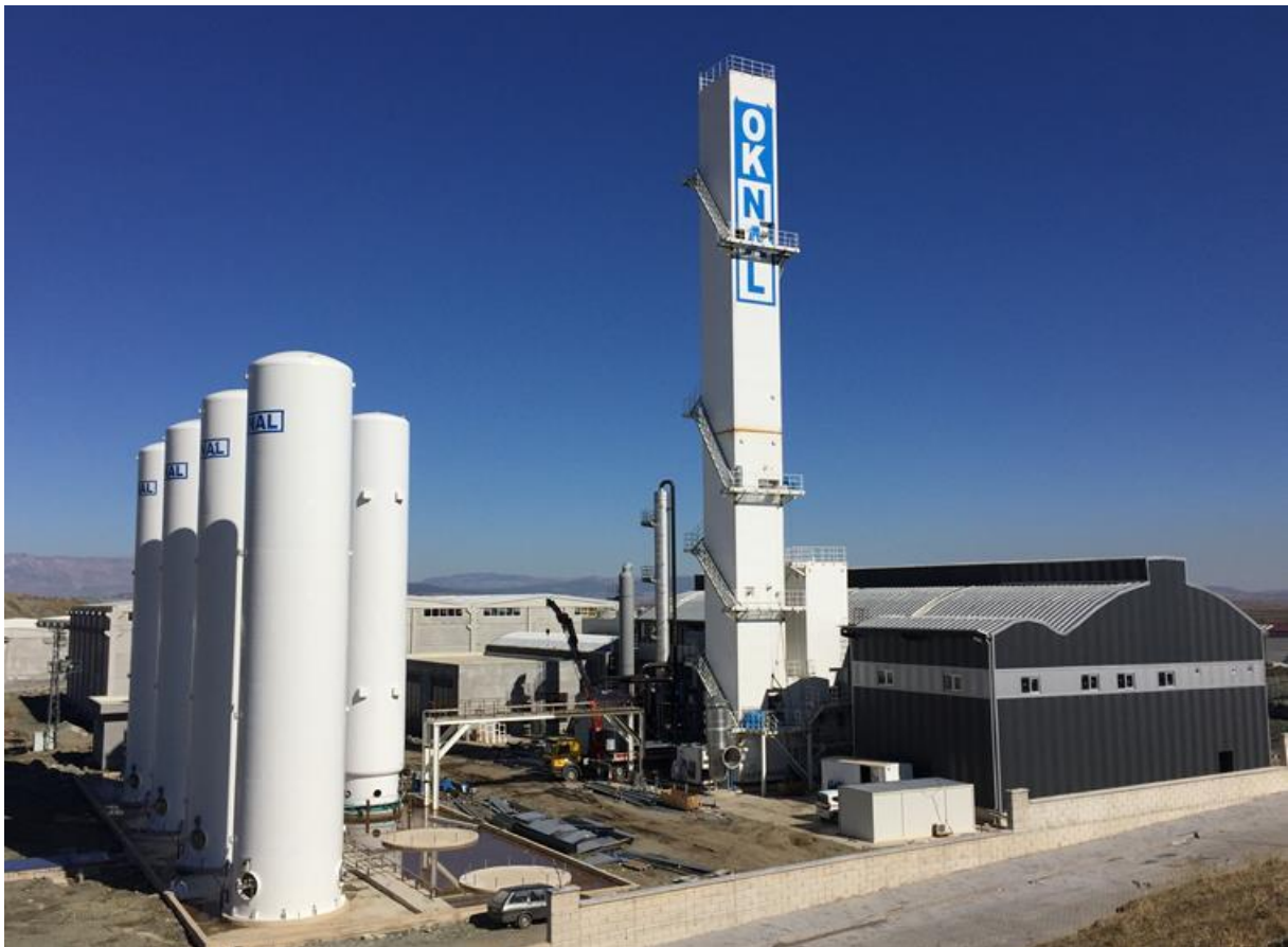
Air Separation Plant General Appearance