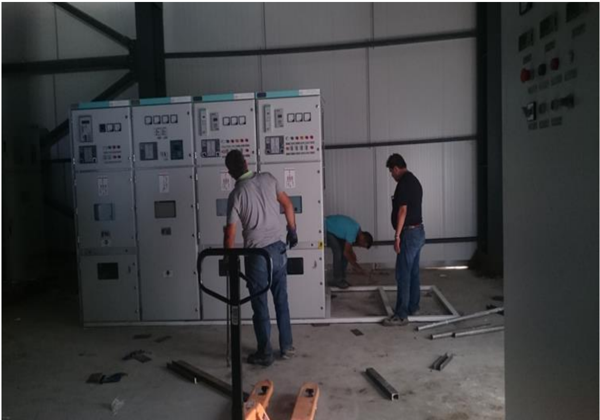
Electricity Main Low Voltage Panel Cells and Base Installation