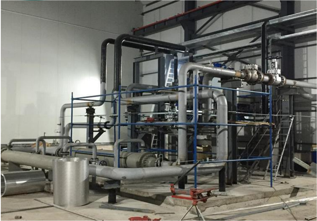
Main Turbine Heat Exchangers and Pipeline Installation