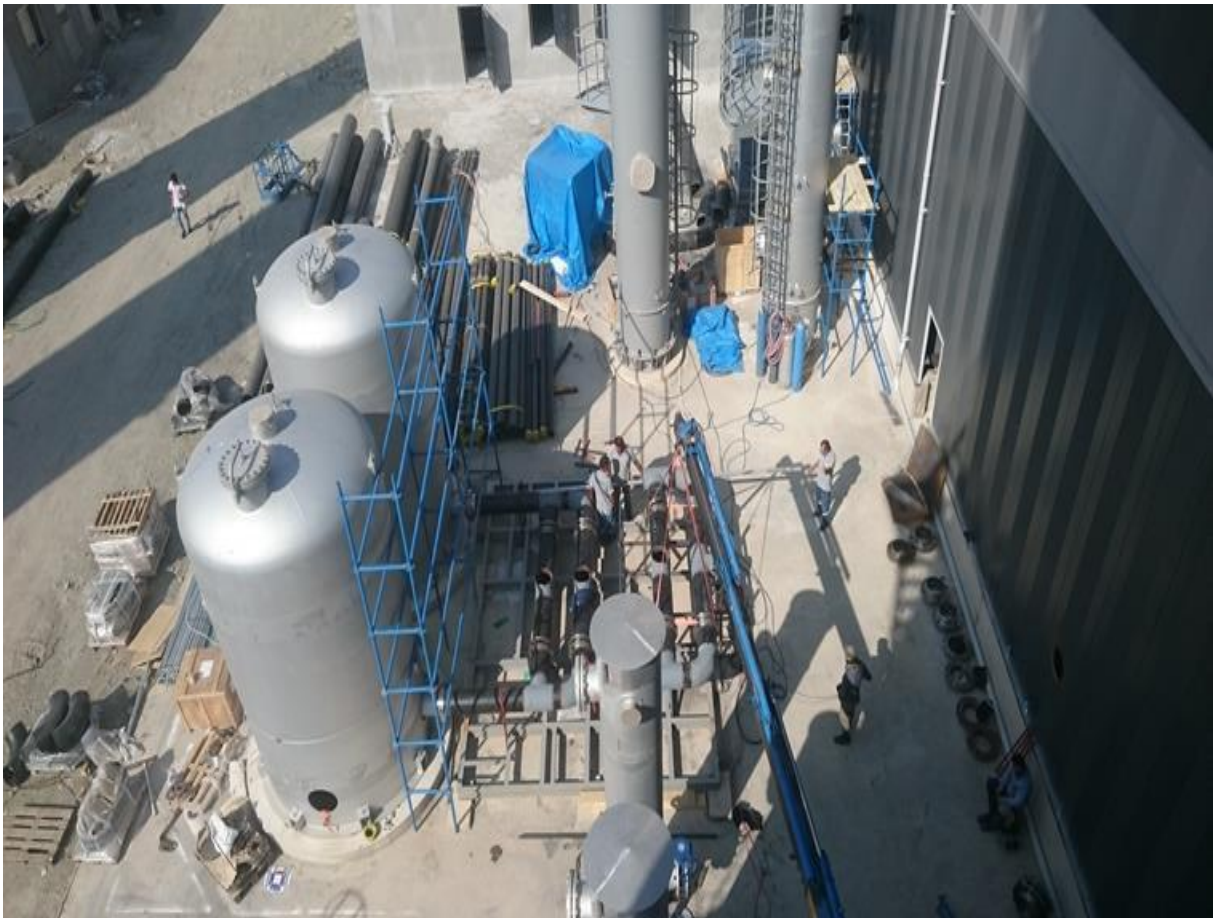
Molecular Sieve Piping Installation