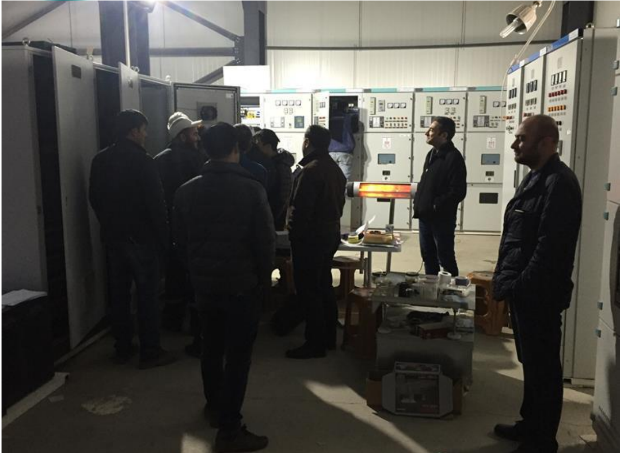
Electric Automation Commissioning