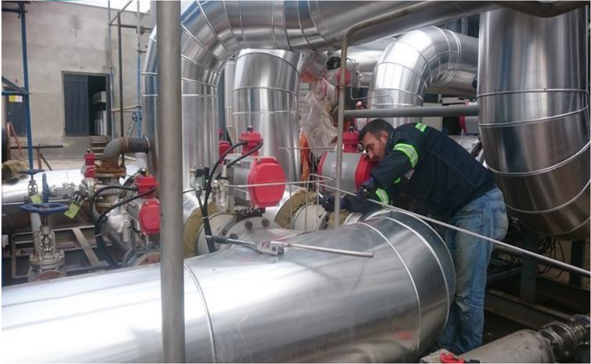
Instrument Air Pipelines Installation