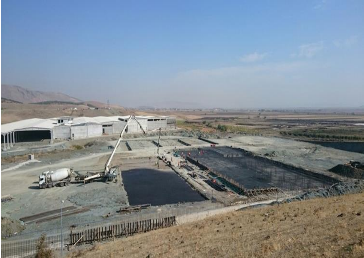
Air Separation Plant Basic Concrete