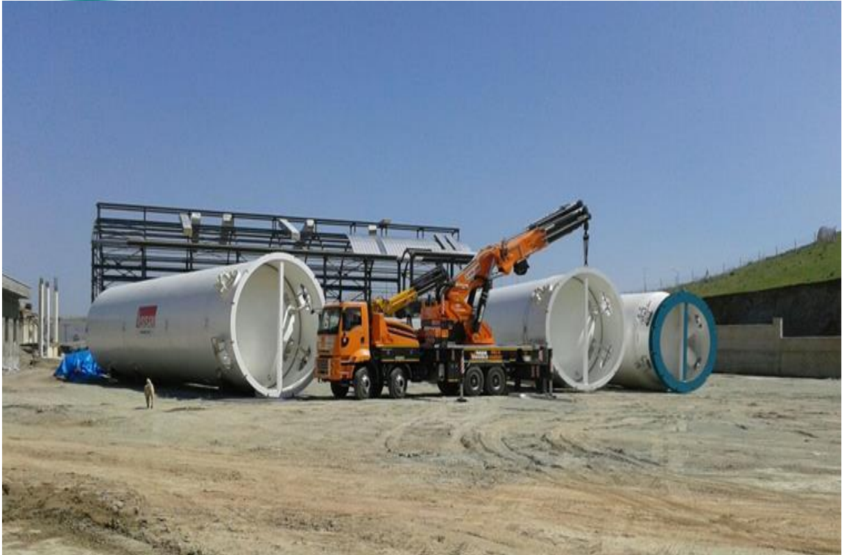
Product Storage Tank Shipment