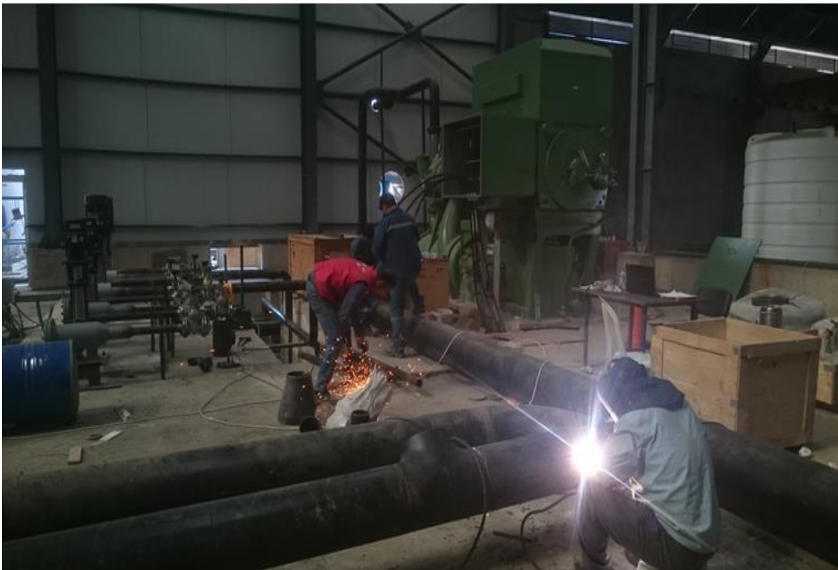
Main and Booster Compressor Air and Water Pipeline Installation