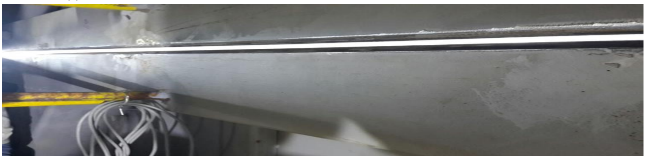
Cold Box Underside and Upperside Margin Appearance