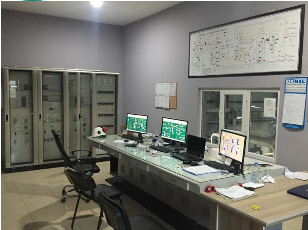
Air Separation Plant Control Room