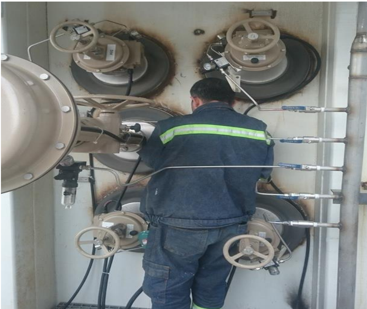
Coldbox Instrument Air Pipelines