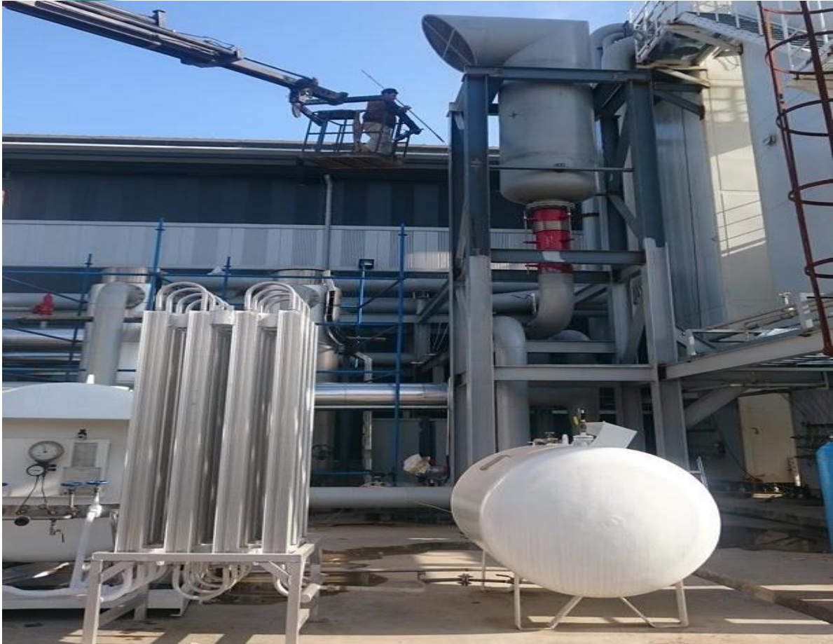
First Start Instrument Air Installation