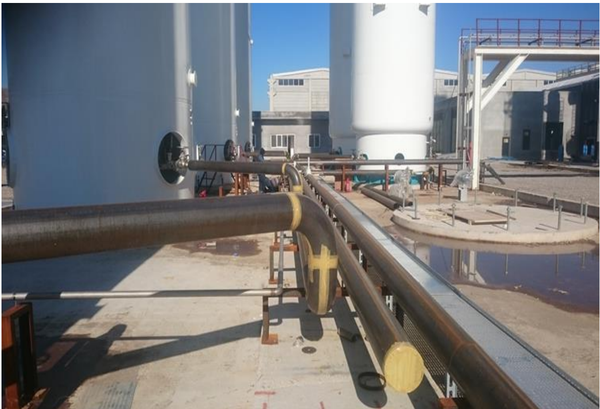
Pipeline Vacuum Insulation Installation