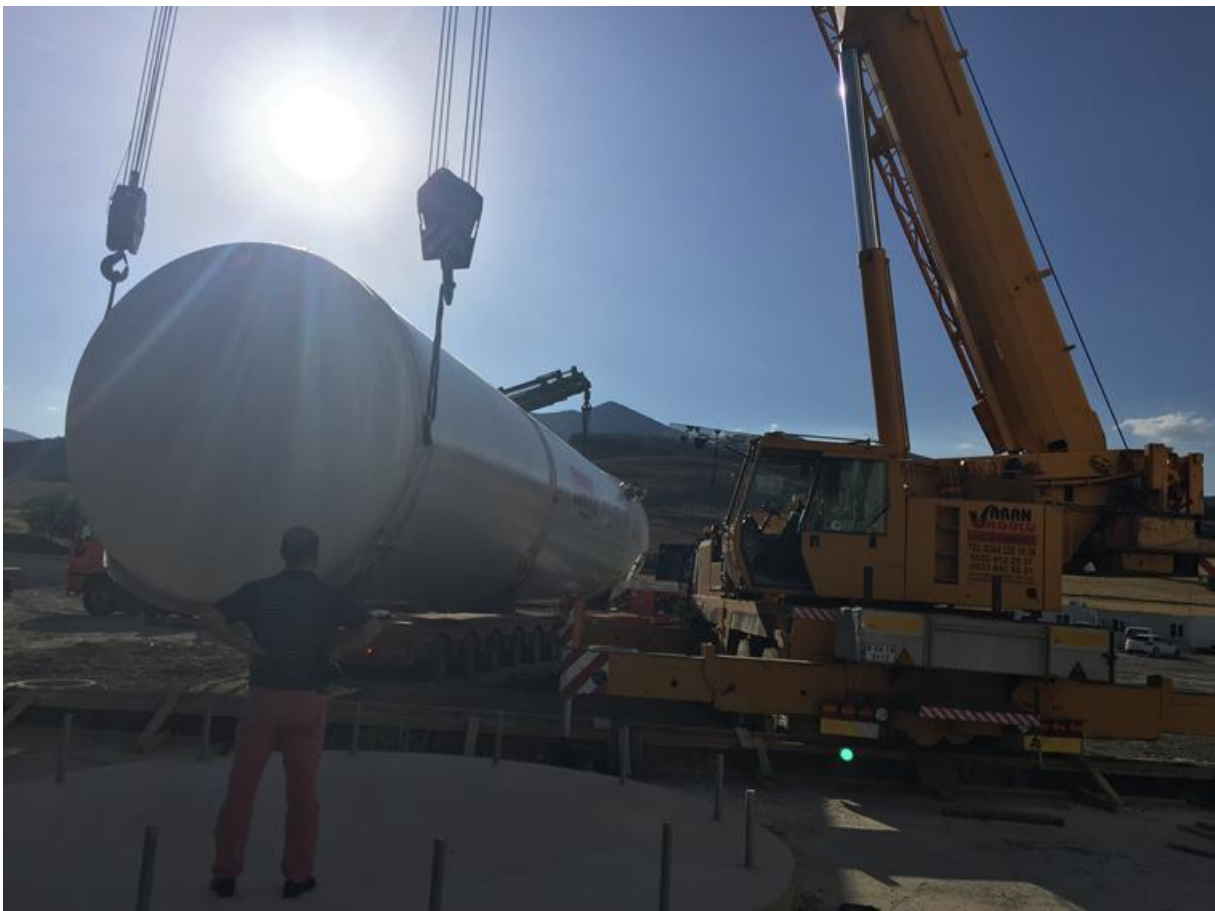
Storage Tank Installation