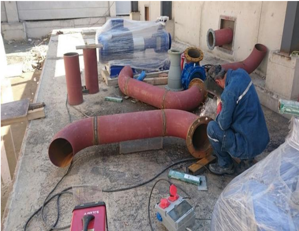
Circulation Pump Pipeline Installation