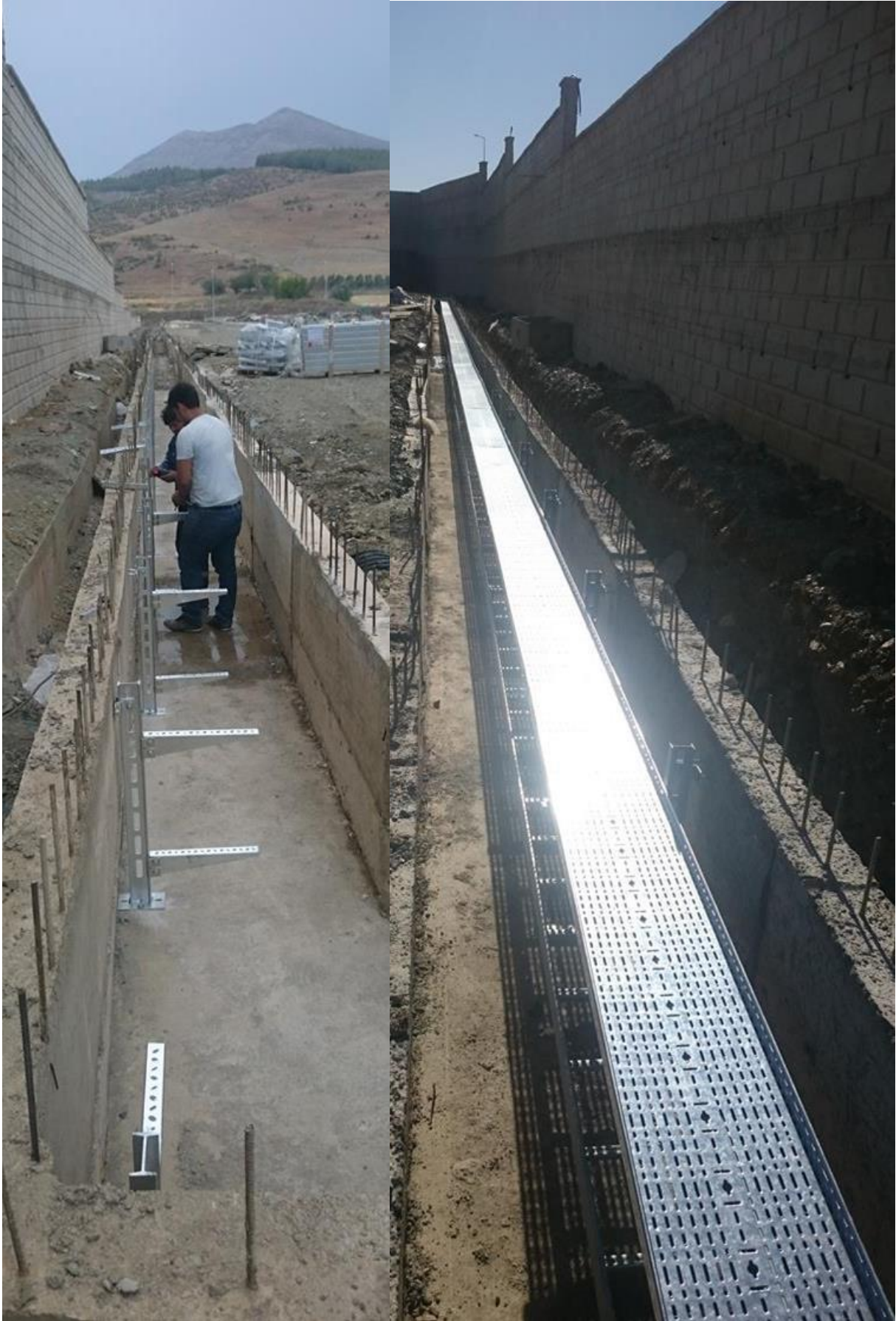
Cable Tray Installation to Cable Galery