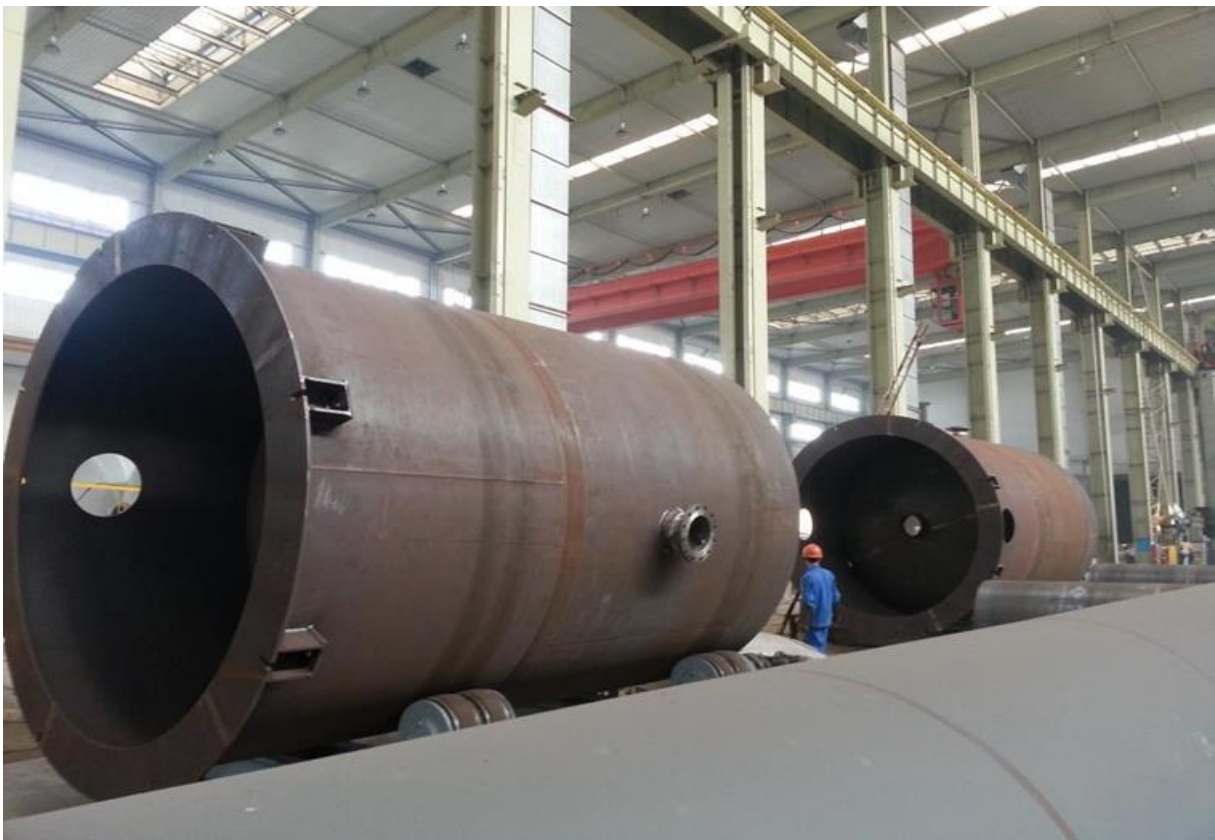
Molecular Sieve Tanks Production (SASPG ASU Co.)