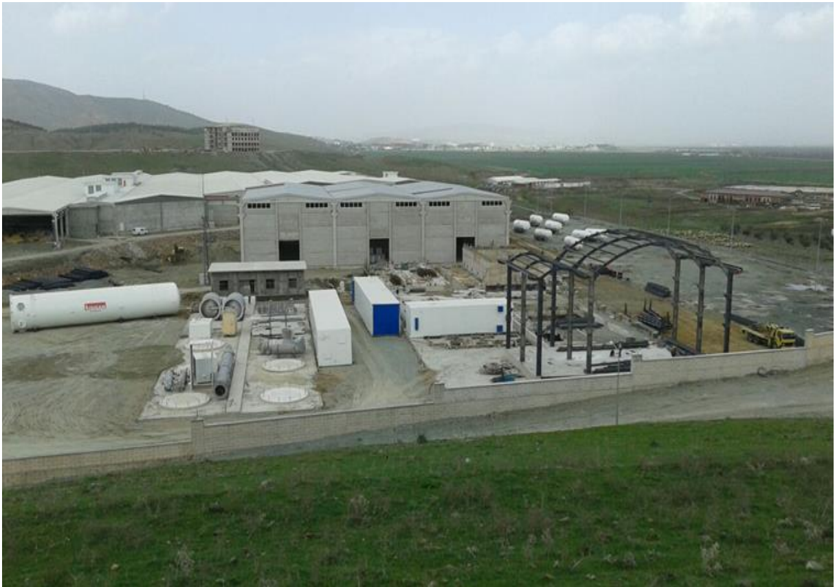
Air Separation Plant General Appearance