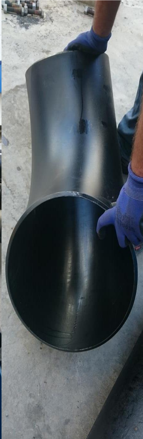
Pipe Cleaning with Special Chemicals