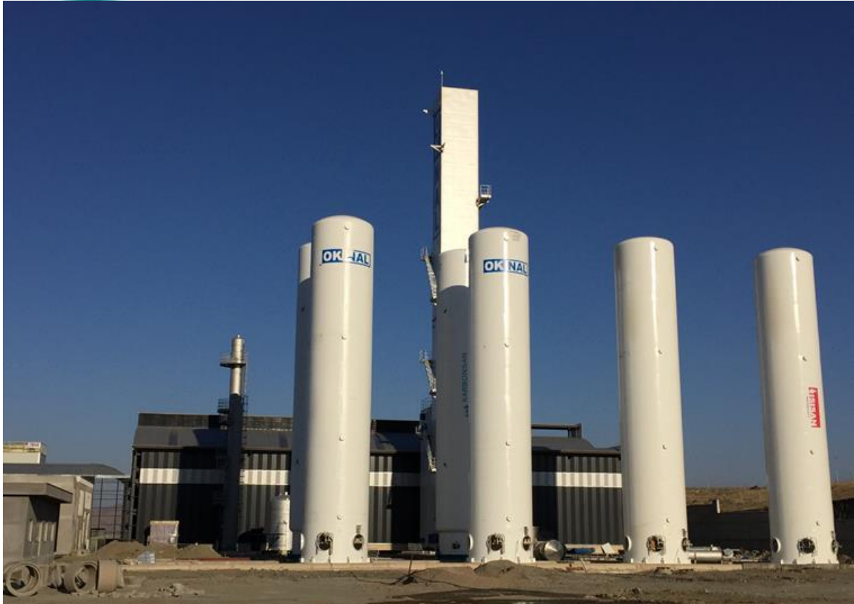
Air Separation Plant General Appearance