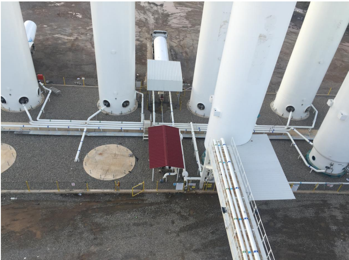
Product Pipeline , Vacum Insulation Installation