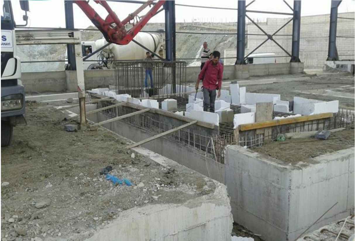
Compressor Base Concrete and Vibration Insulation