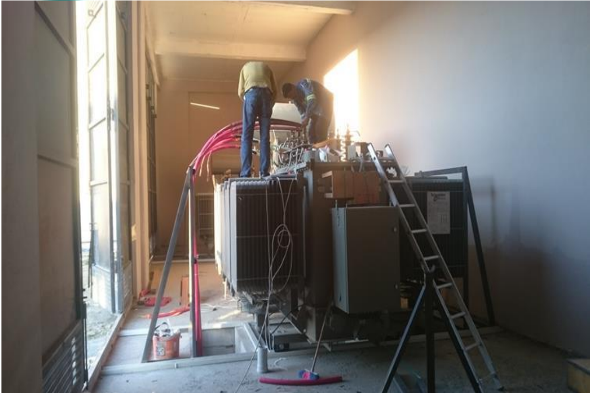
Main Transformer , Distribution Transformer Cable Connection