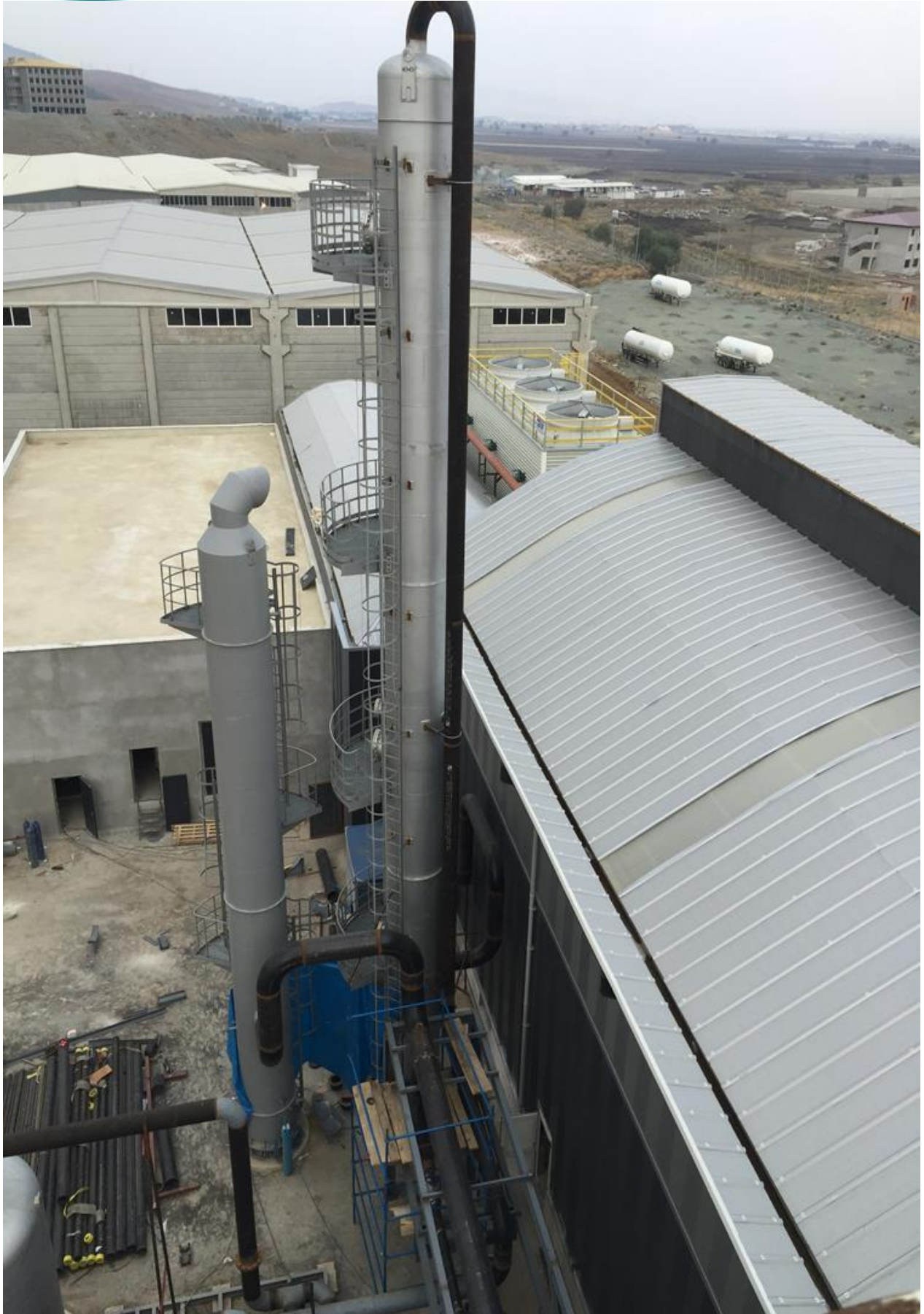
Water and Air Cooling Tower Pipeline Installation