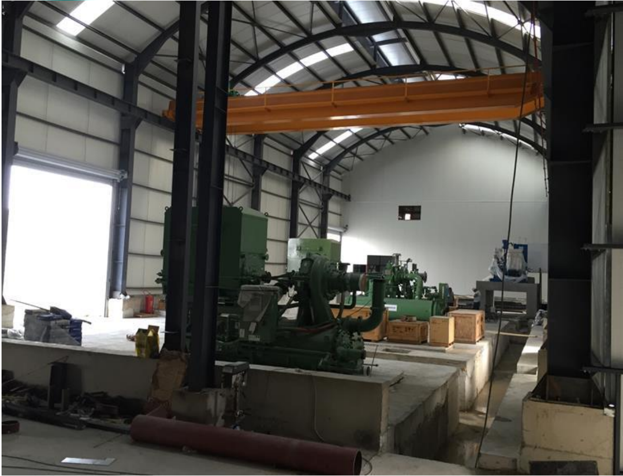
Turbine, Booster Compressor , Main Compressor Installation