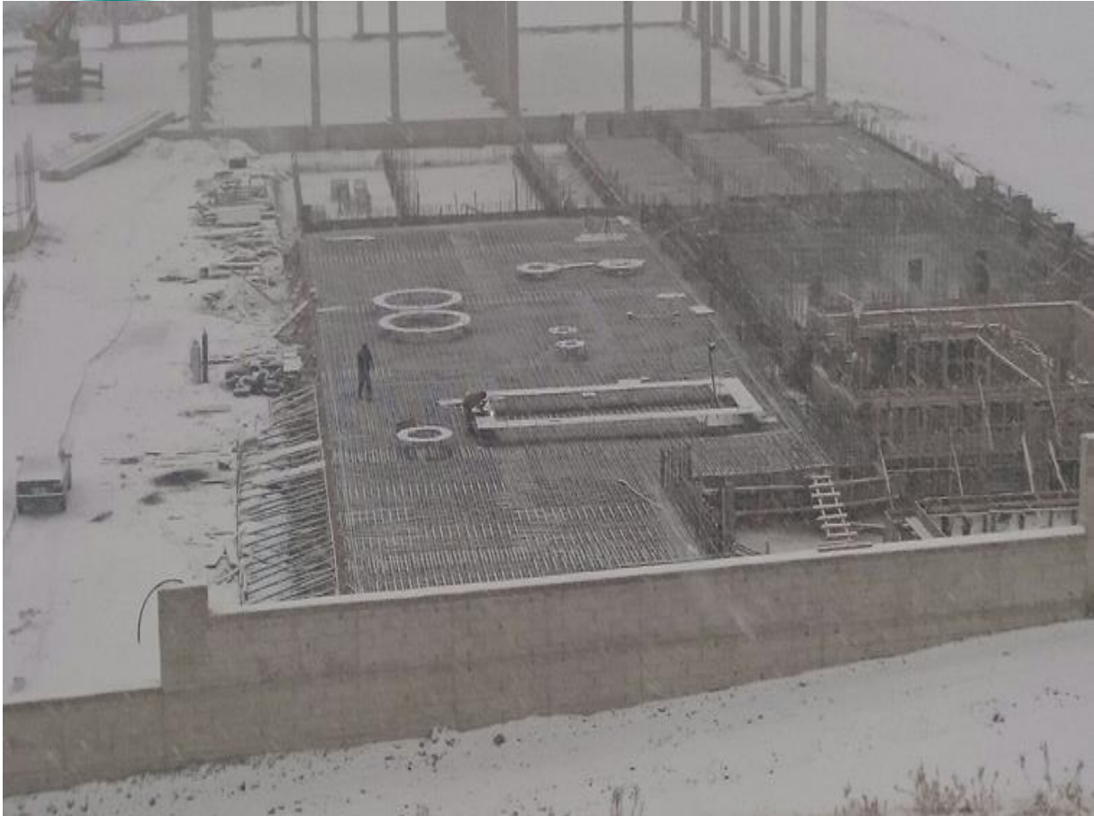
Product Storage Tank Embedded Plates and Anchors