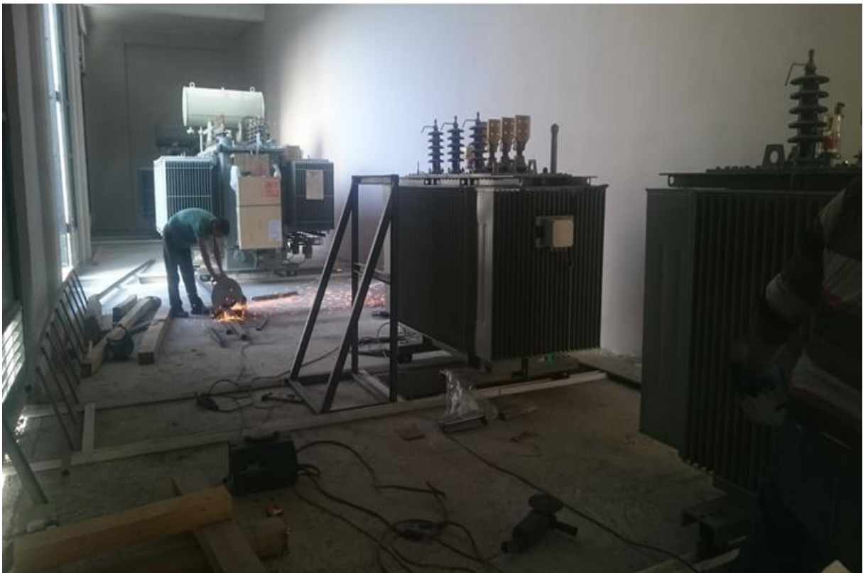
Main Transformer , Distribution Transformer Base Installation