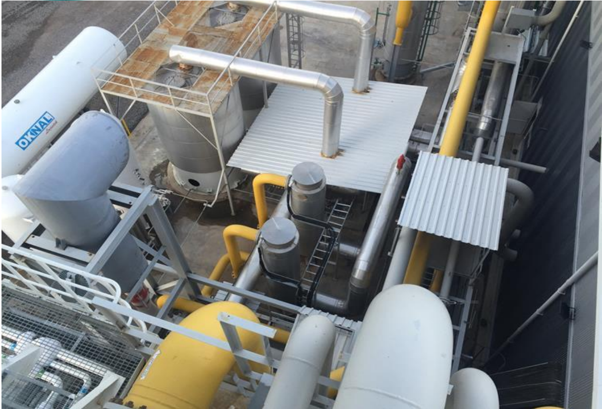
Main Heater Area General Appearance