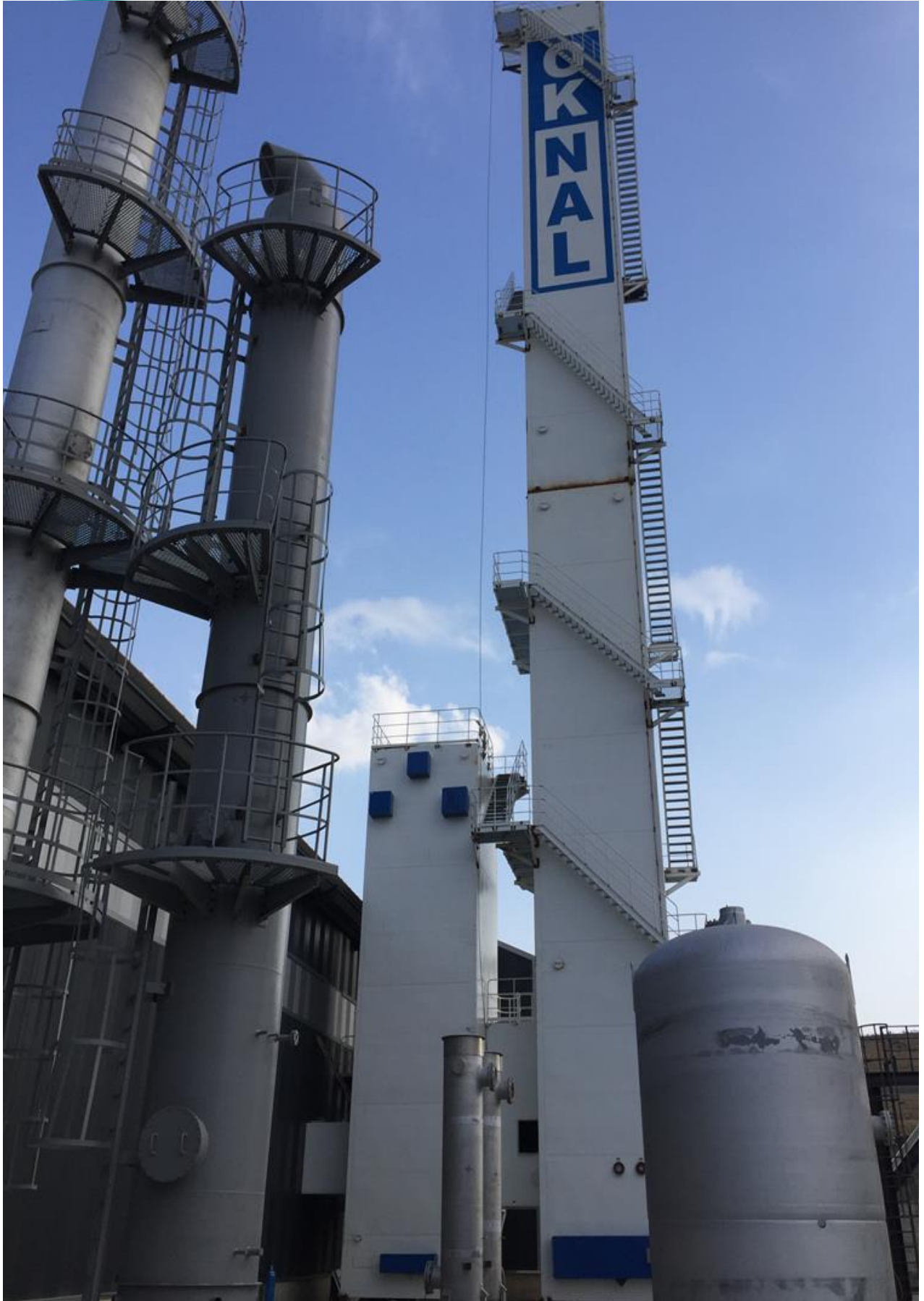
Air and Water Cooling Tower, Main Heater, Molecular Sieve Installation