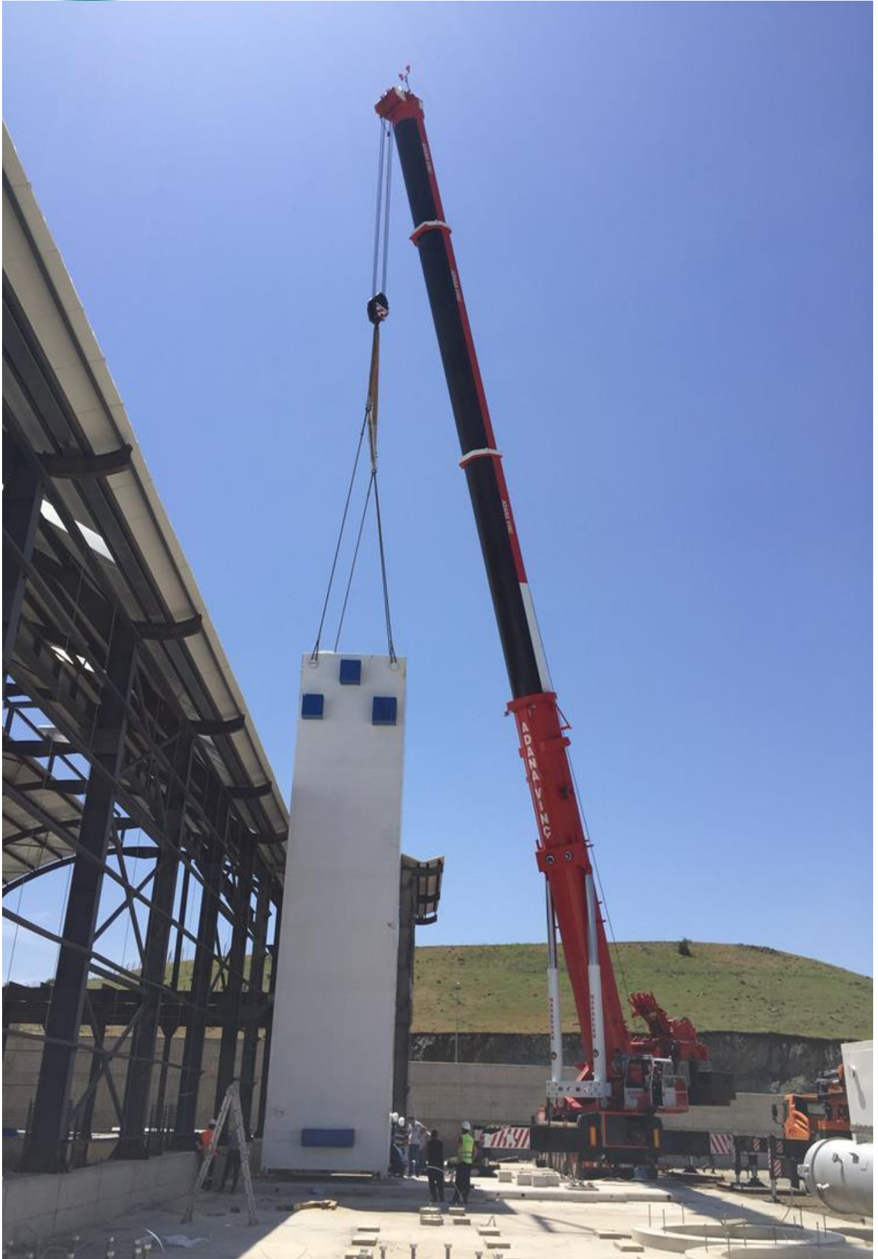
Main Heat Exchanger Intallation