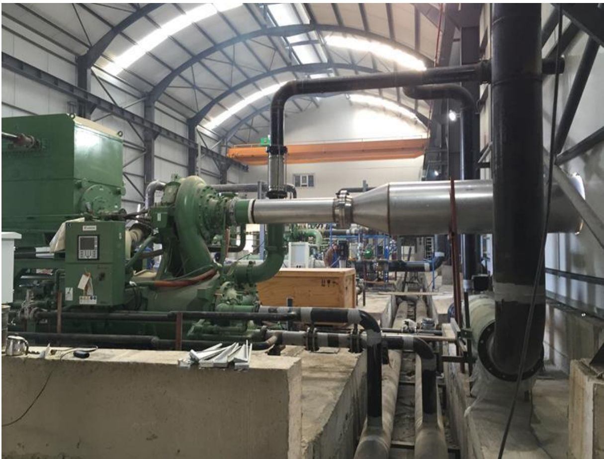
Main Compressor Water Pipeline, and Slicer Installation