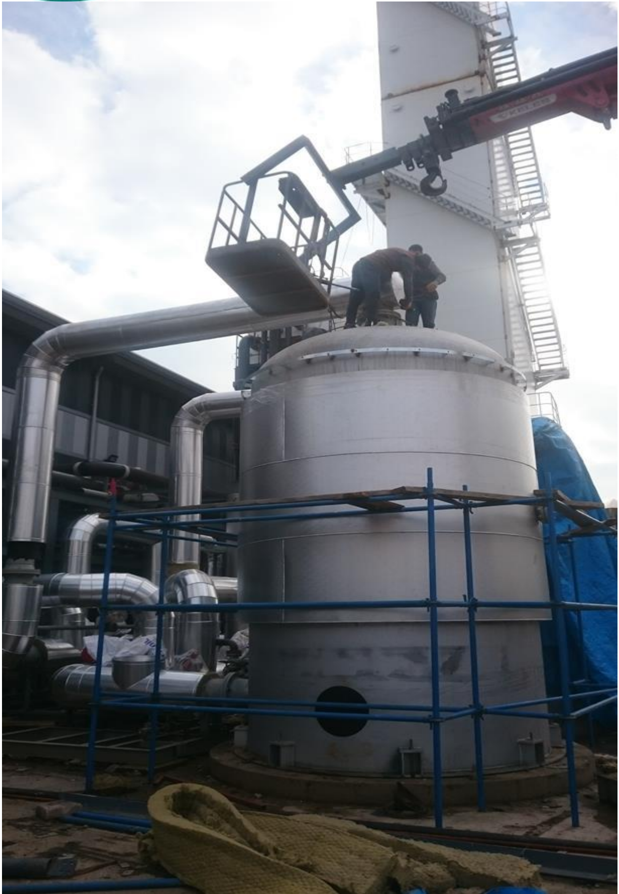
Molecular Sieve and Pipeline Insulation Installation