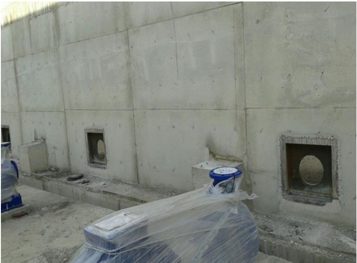
Cooling Tower Water Basin , Pump Suction Embedded Plates and Connection