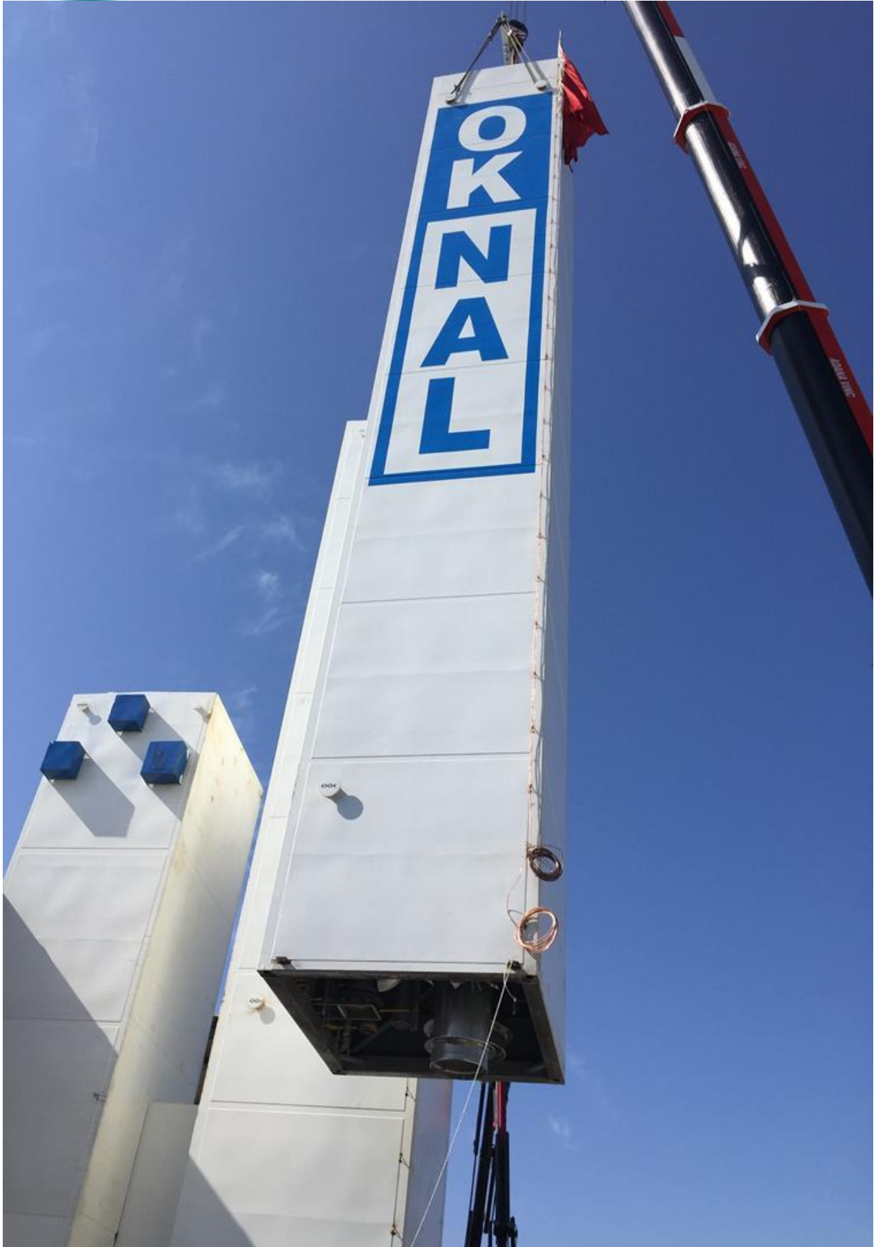
Cold Box Upperside Installation