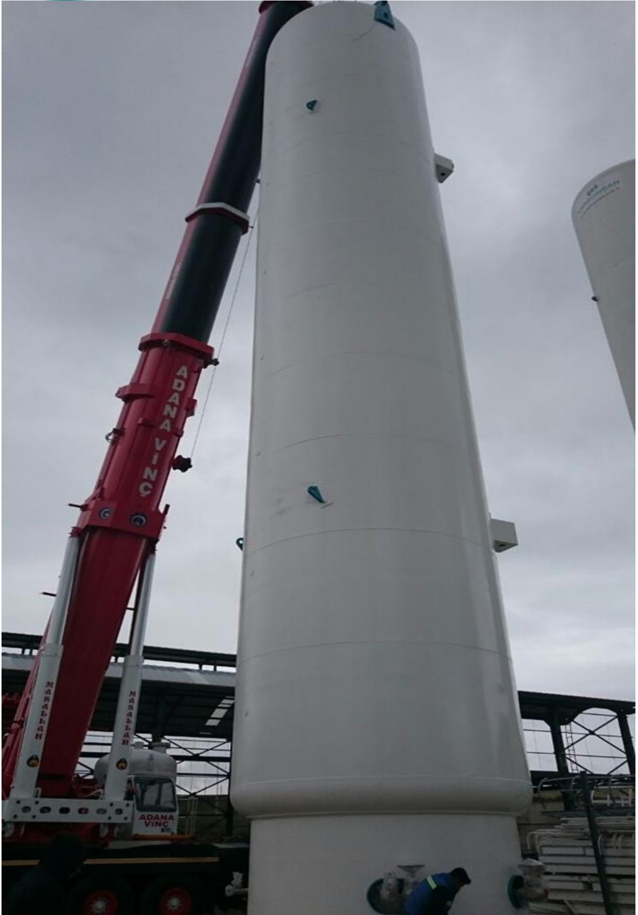
Storage Tank Installation