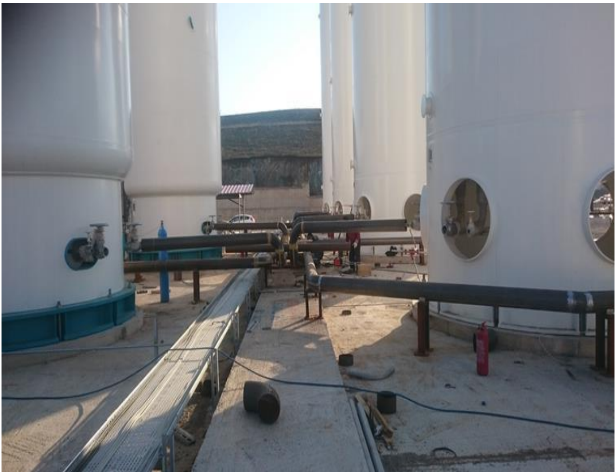
Pipeline Vacuum Insulation Installation