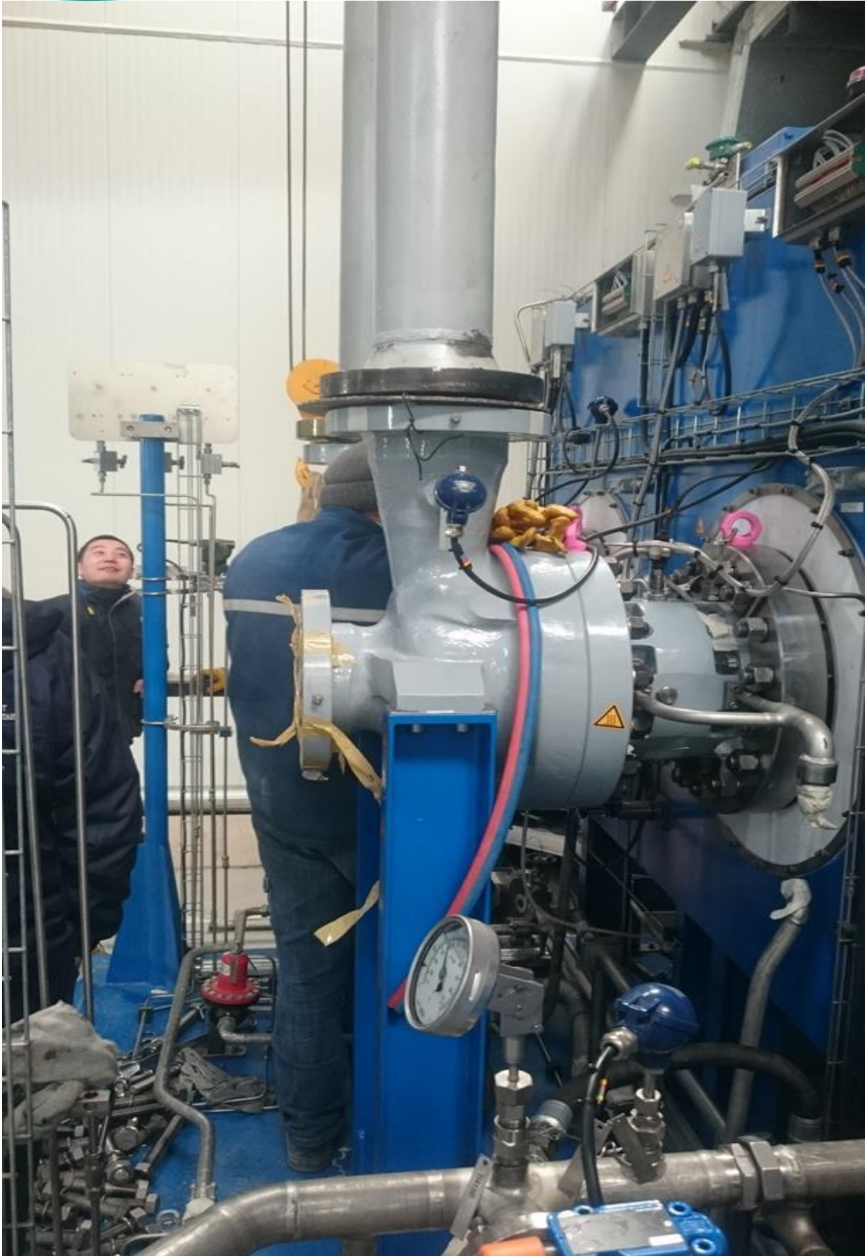
Türbine Commissioning with Supervisor