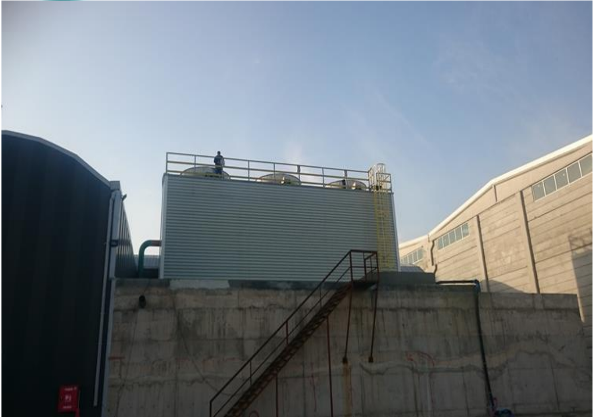
Cooling Tower Commissioning