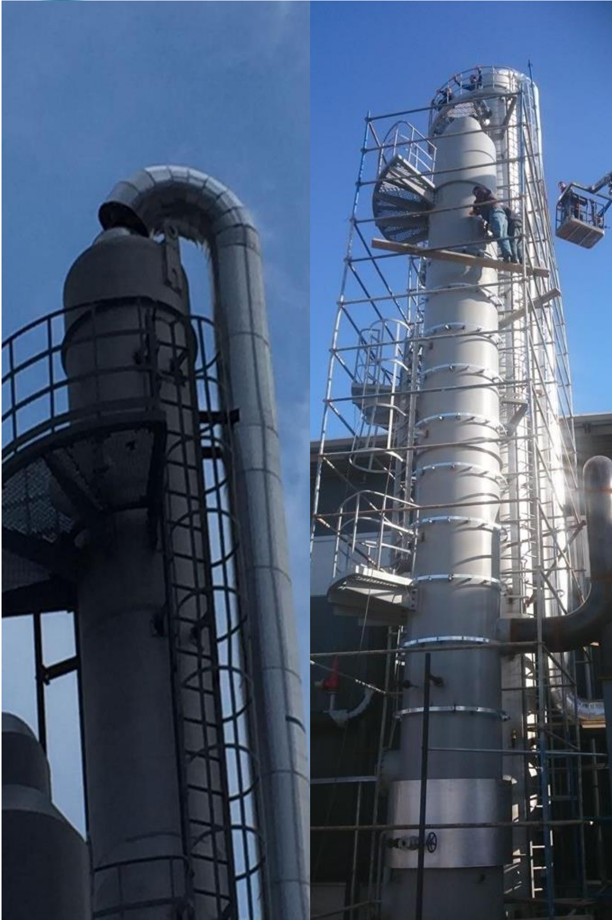
Air and Water Cooling Tower Insulation Installation