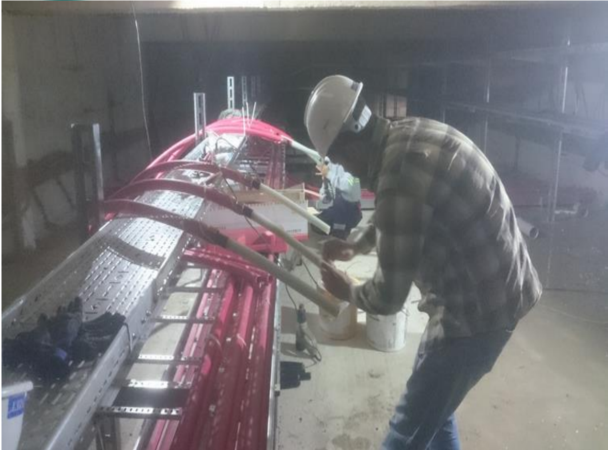
Main Input Stem Cell Cable Connection