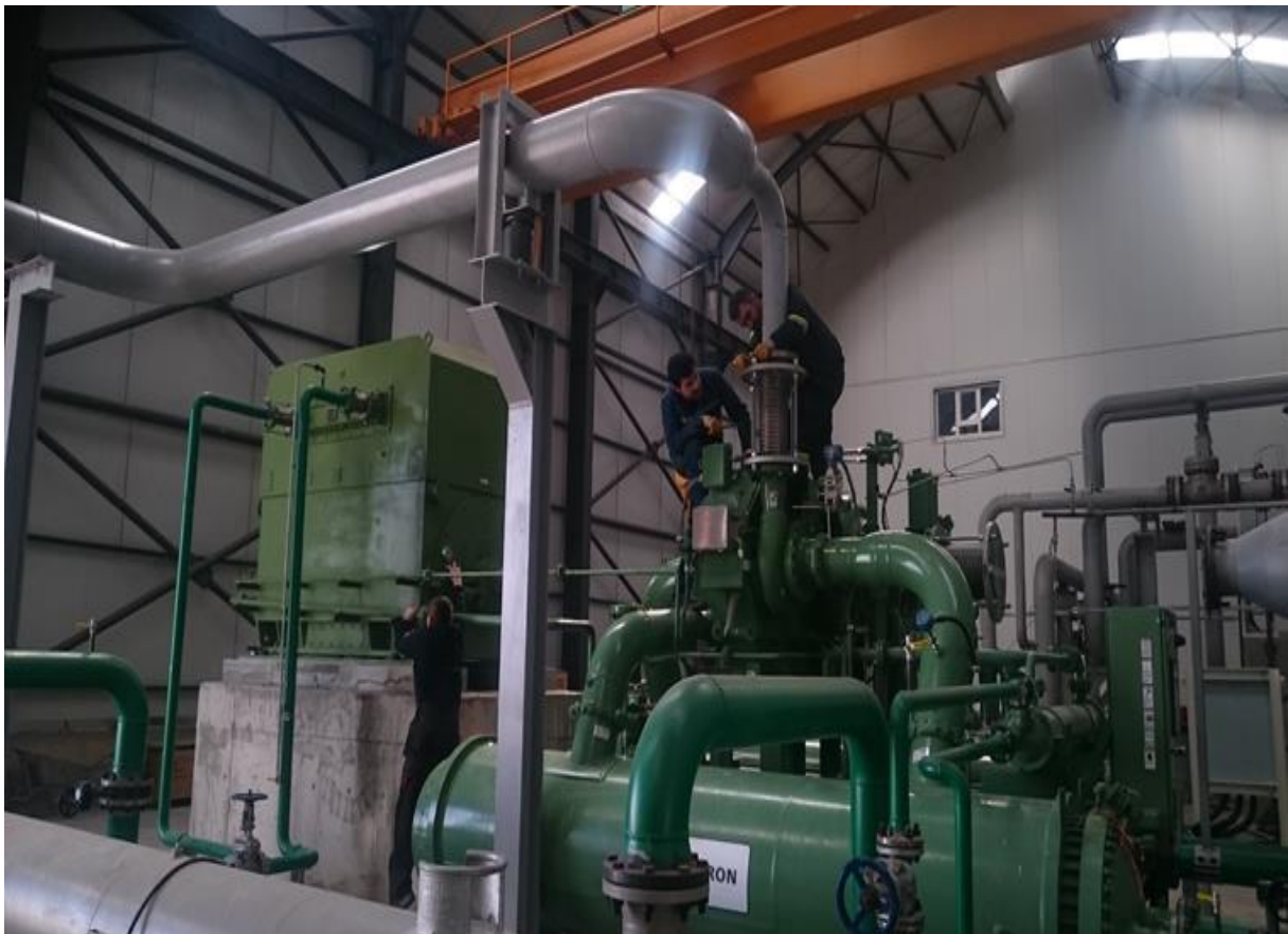
Booster Compressor Air and Water Pipeline Installation