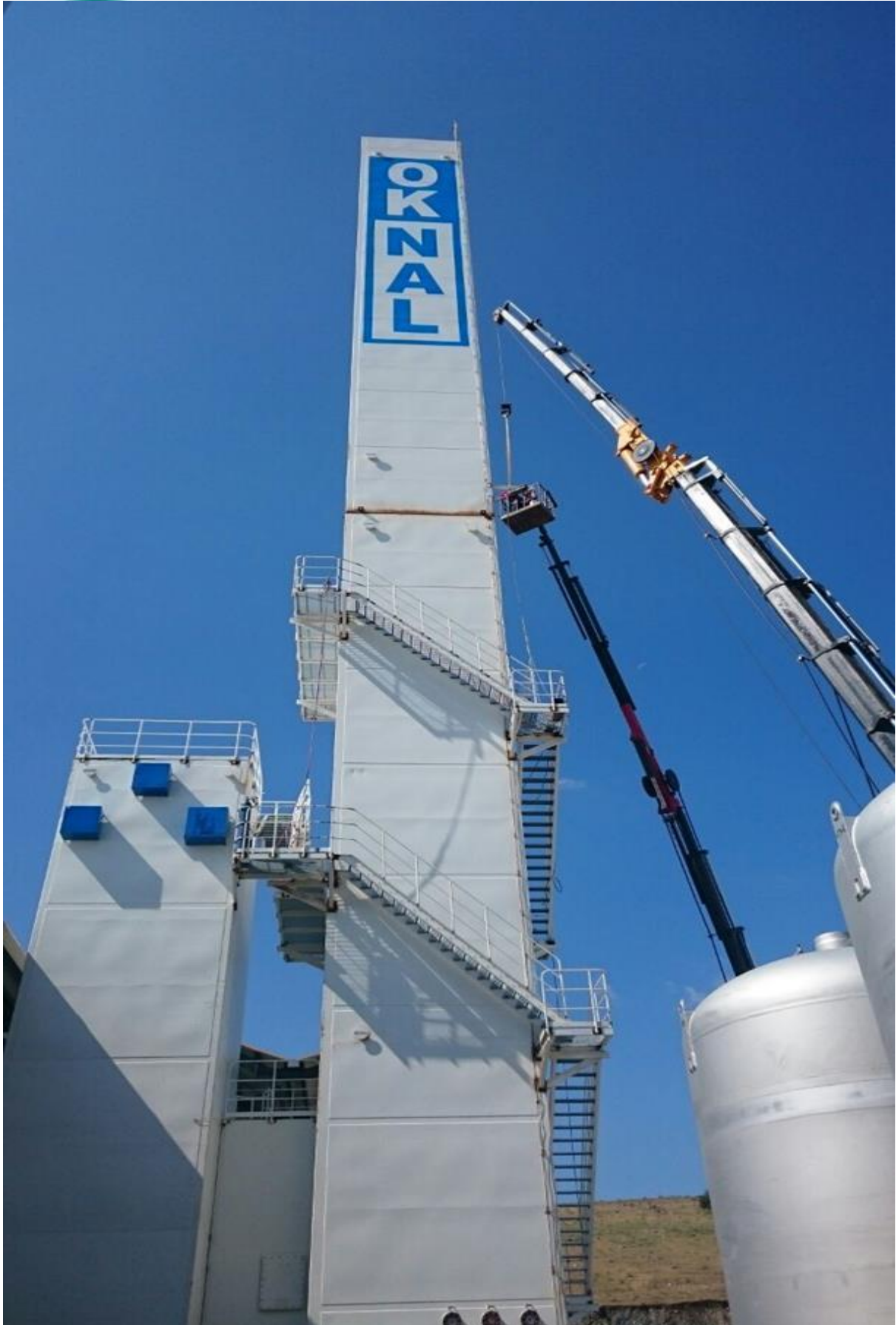
Cold Box Stairs Installation