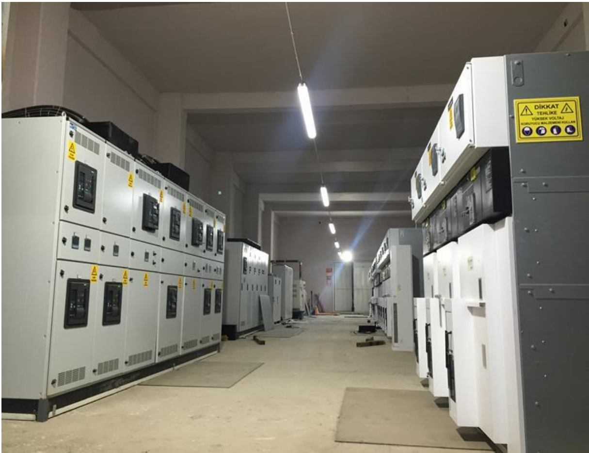
Electricity High Voltage Room