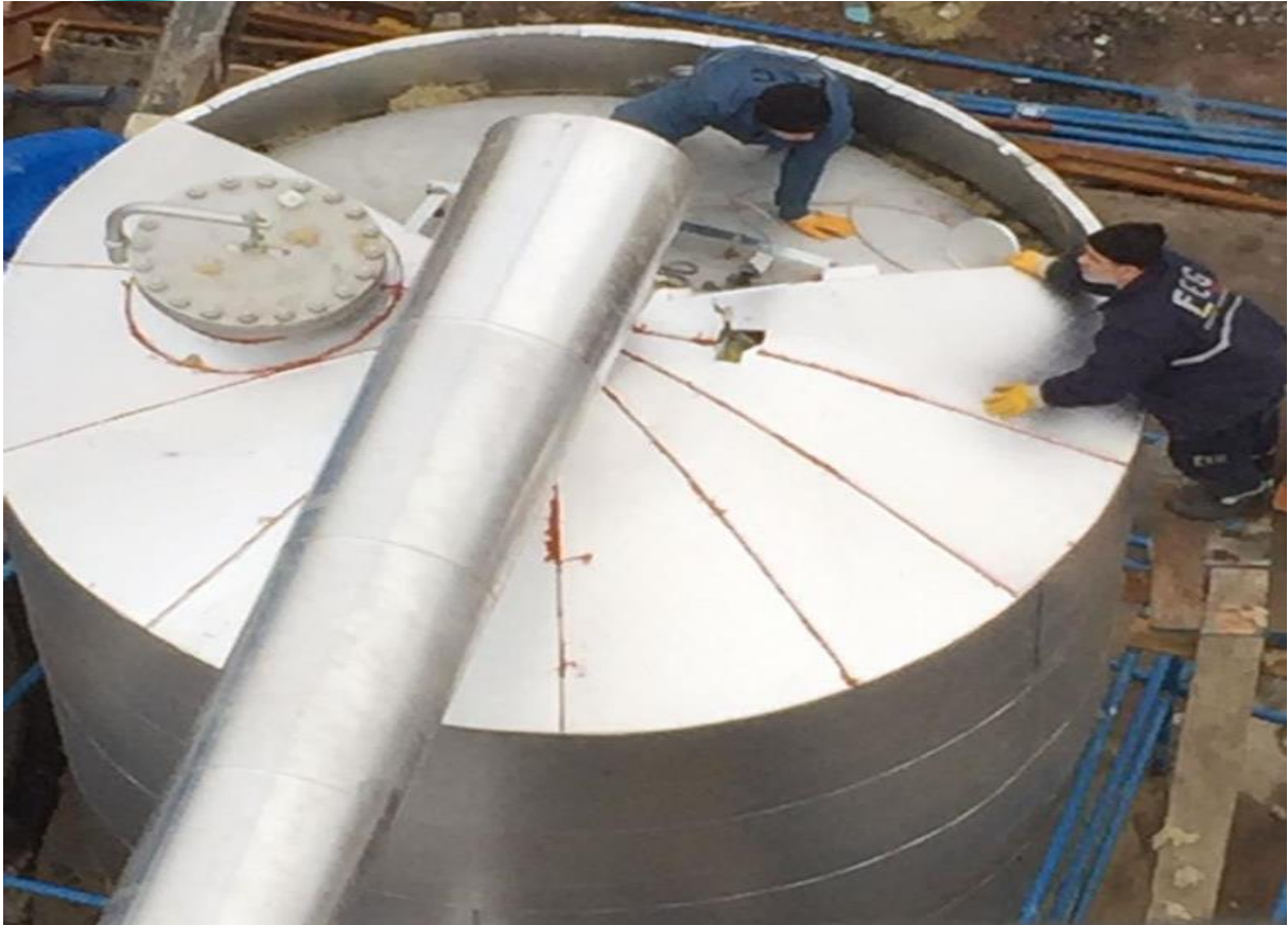
Molecular Sieve and Pipeline Insulation Installation