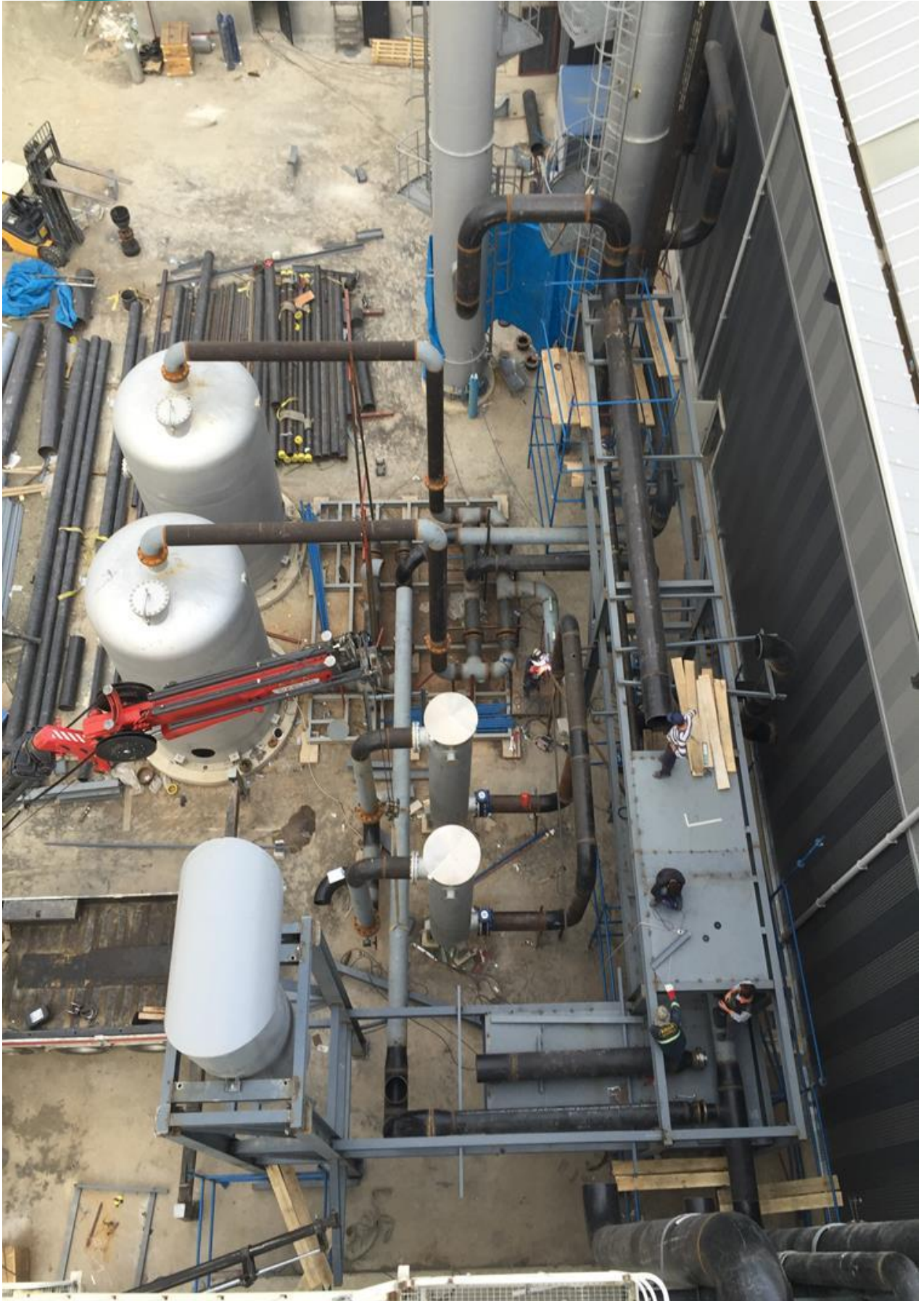
Piping ,Pipe Rack, Supporting Installation