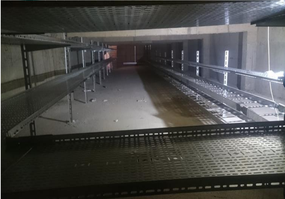
Cable Tray Installation to Cable Galery