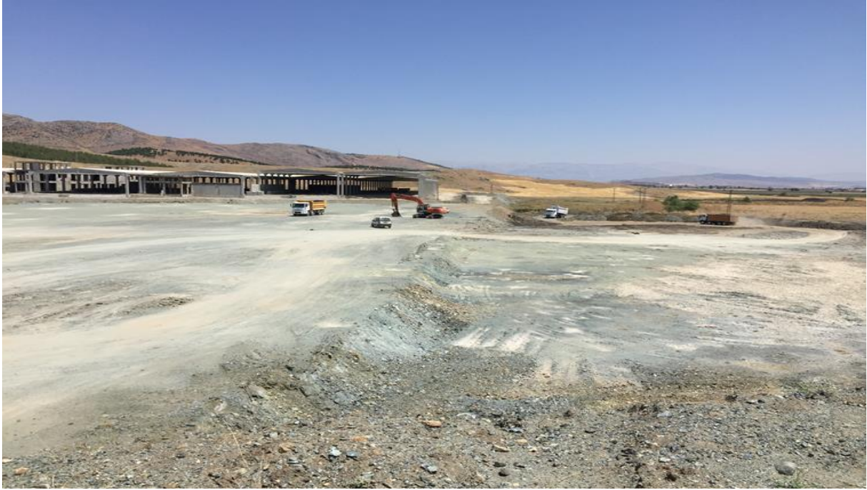
Air Separation Plant Area General Appearance