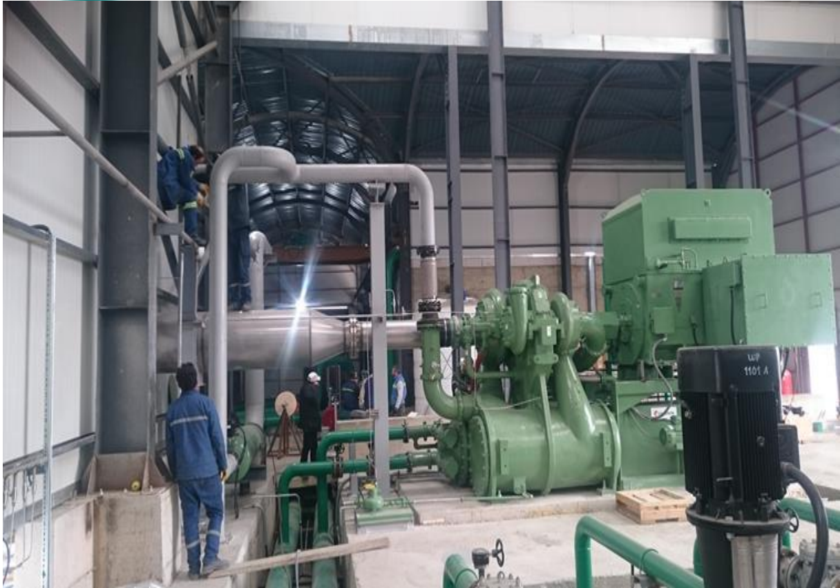
Main Compressor Air and Water Pipeline Installation