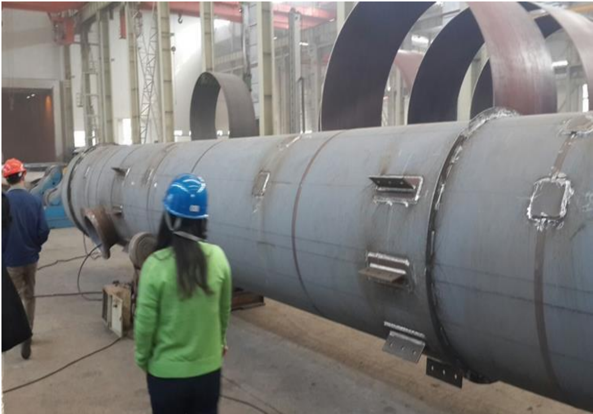
Air Cooling Tower Production (SASPG ASU Co.)