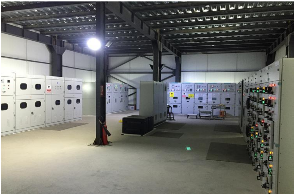
MCC/DCS/PLC Cabinet Room