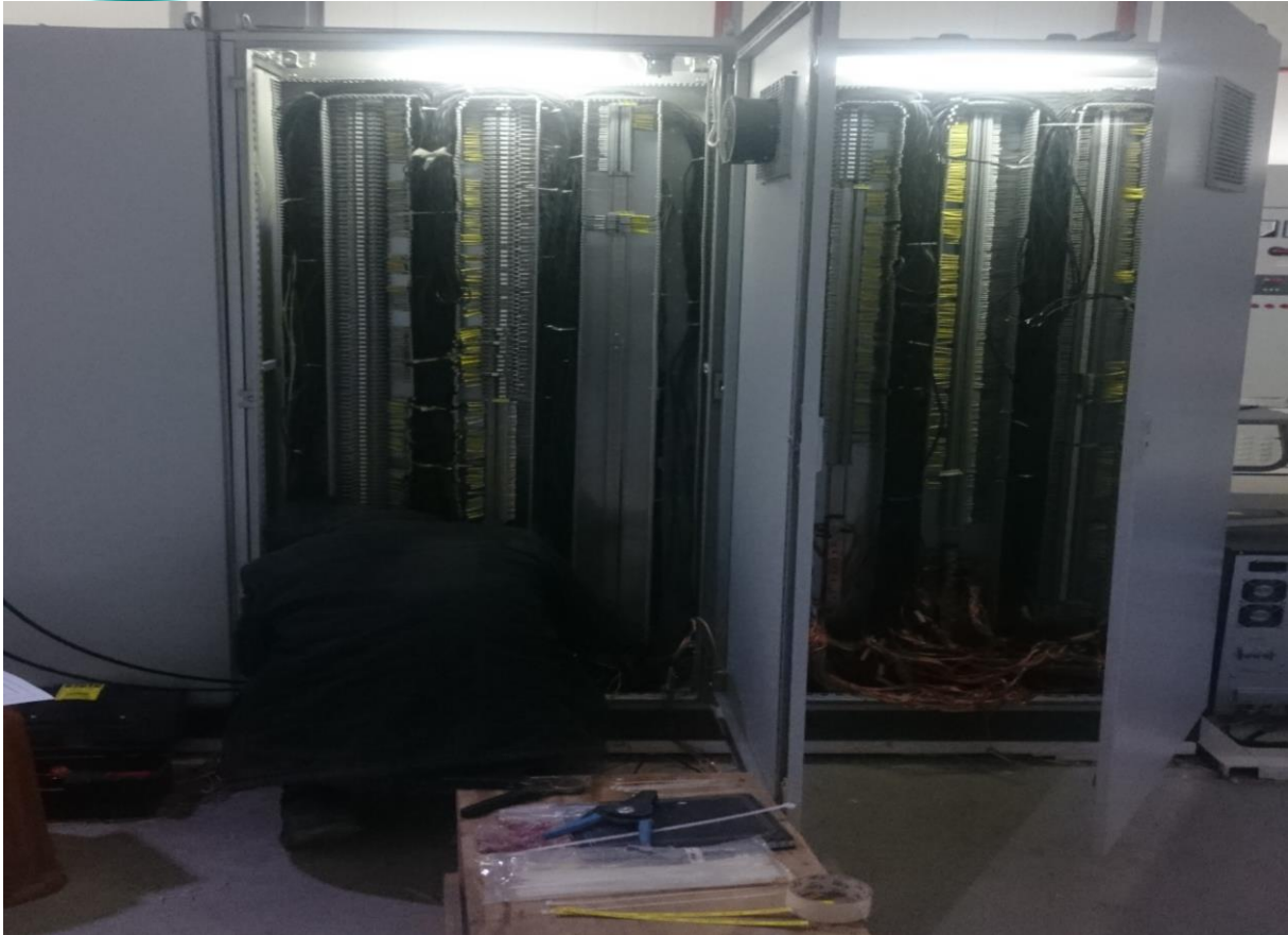
Instrument and Control Panels Cable Connection