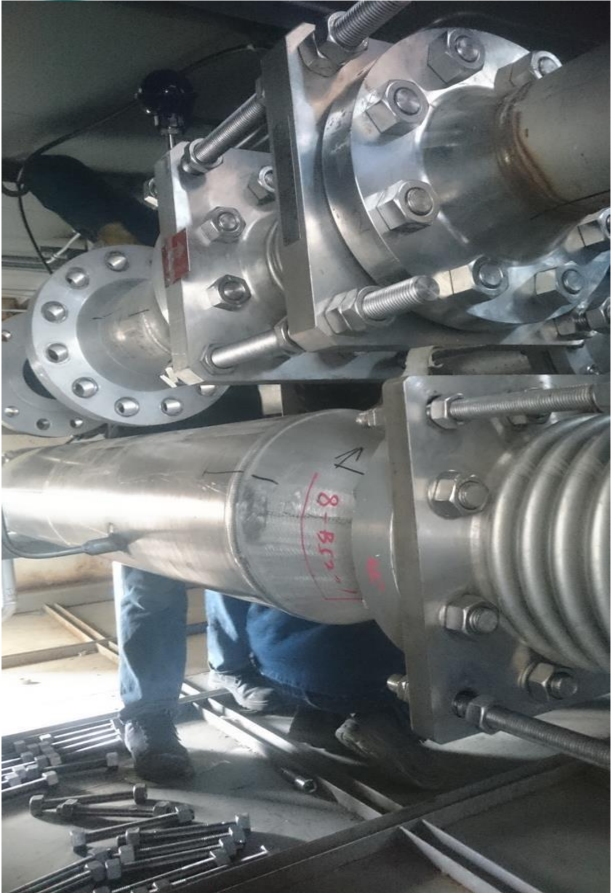
Main Turbine Installation