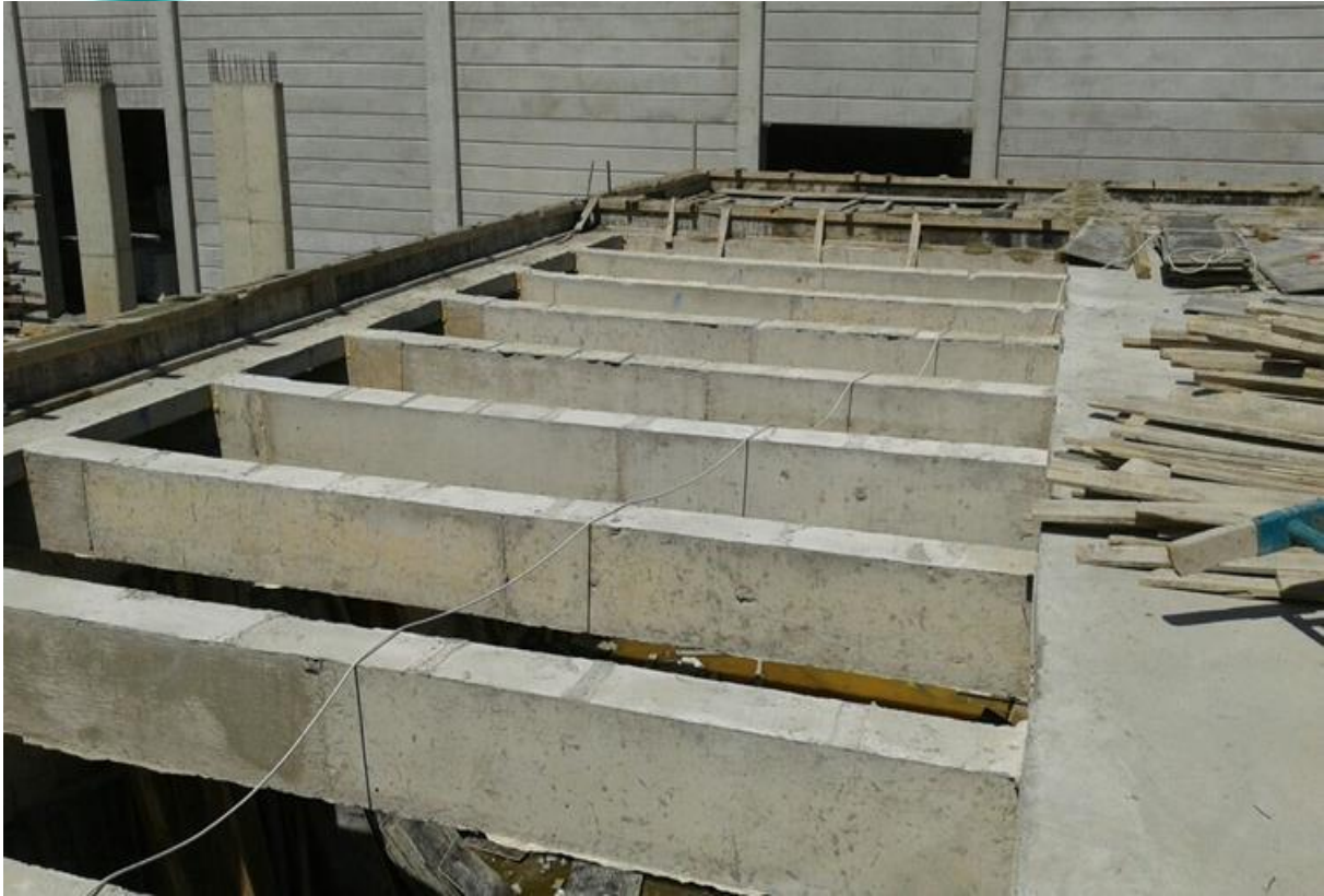
Cooling Towers Residential Area