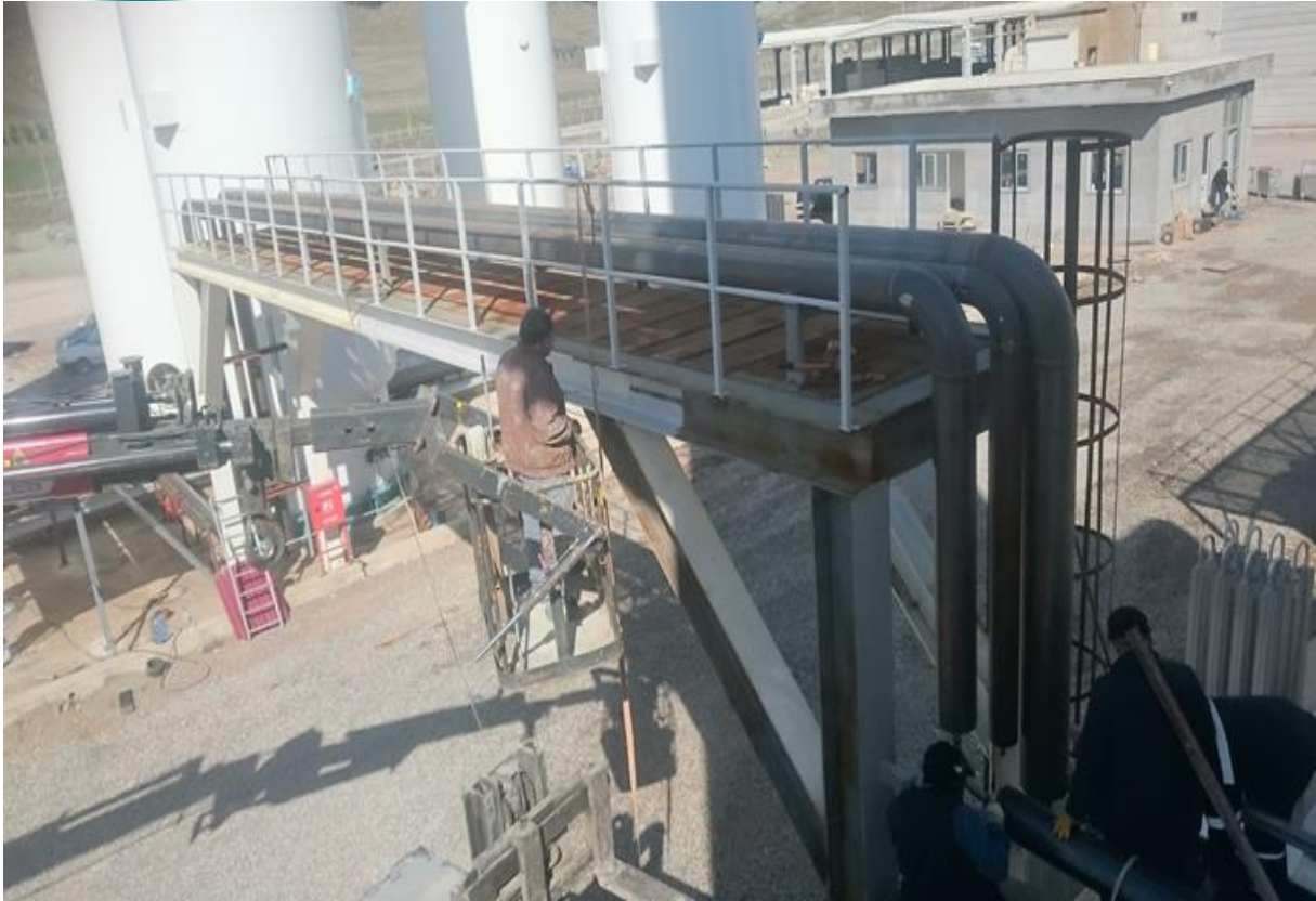
Product Pipeline ,Vacum Insulation Installation