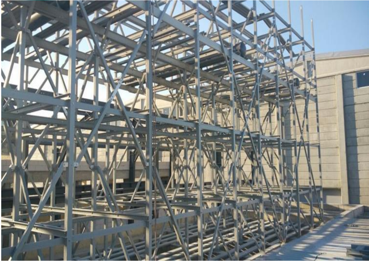
Cooling Tower FRP Construction Installation