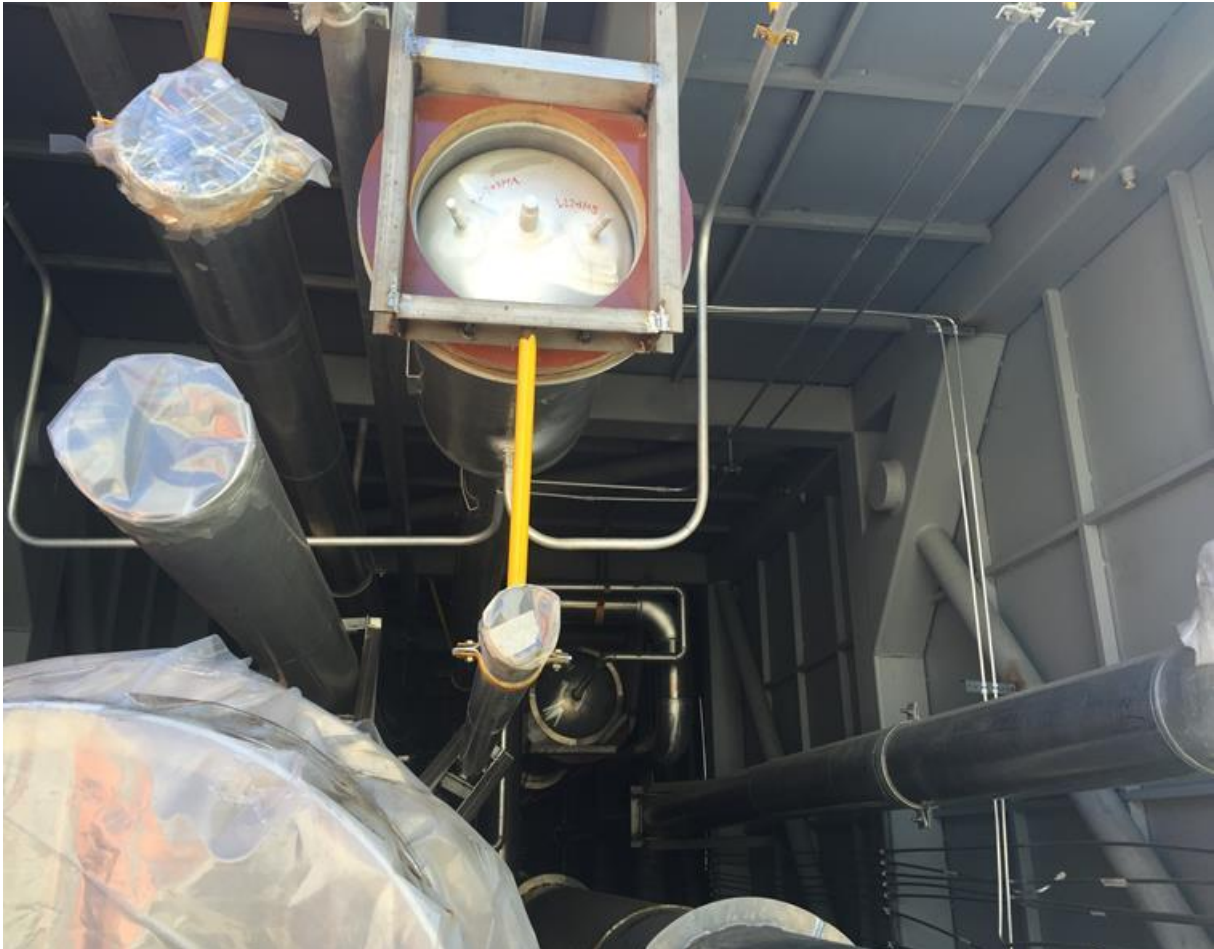
Cold Box Inside Appearance