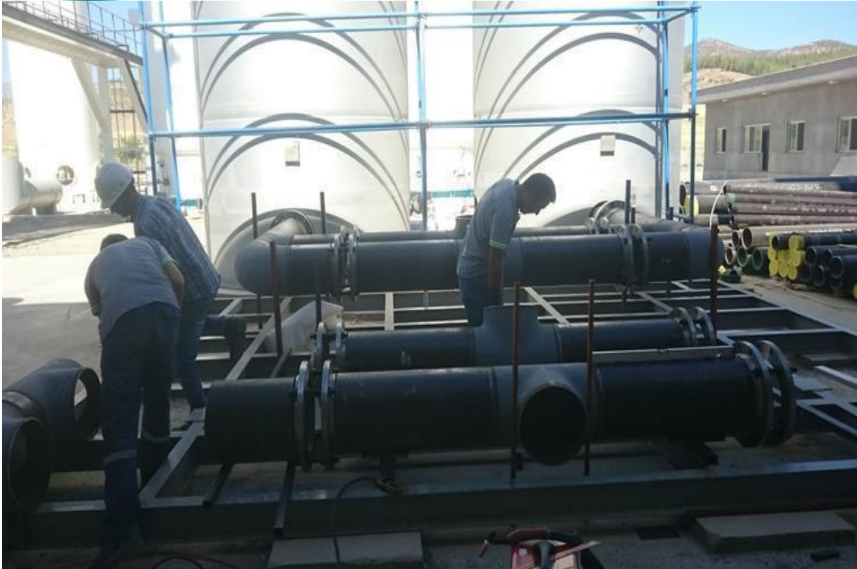
Molecular Sieve Valve Skid and Pipes Installation