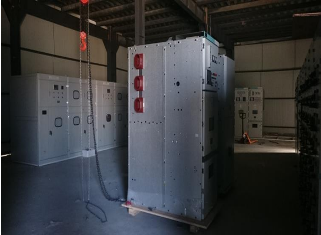
Electricity Main Low Voltage Panel Cells and Base Installation