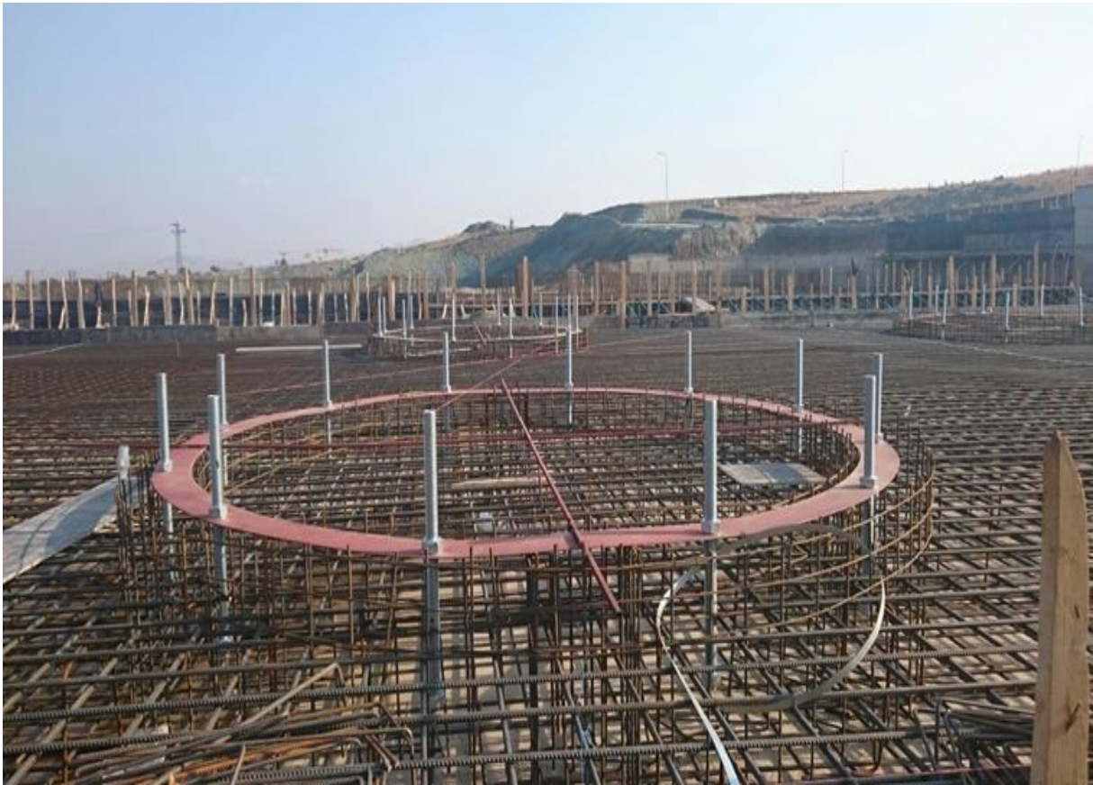
Product Storage Tank Anchors