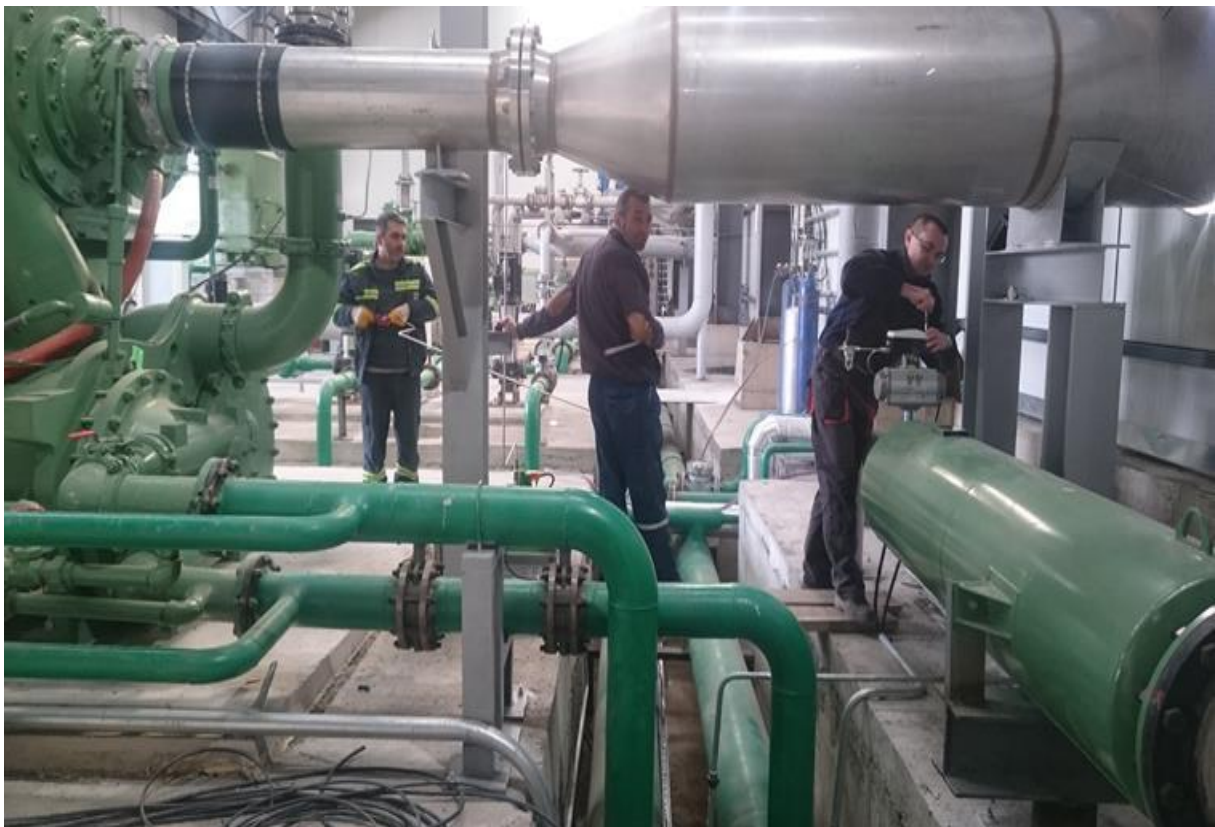
Main Compressor and Booster Compressor Commissioning with Supervisor