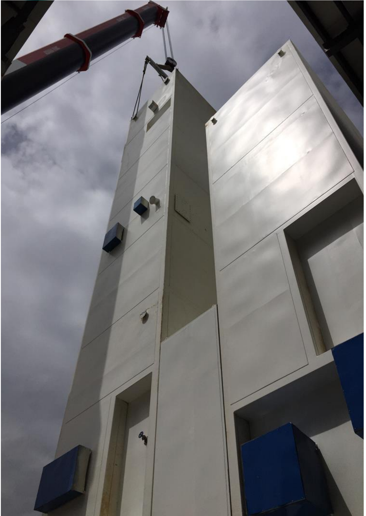
Cold Box Underside Installation