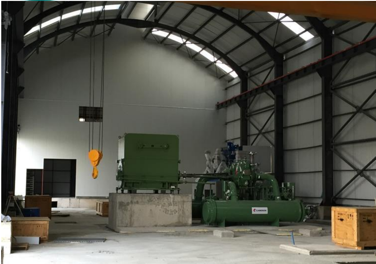
Booster Compressor Installation