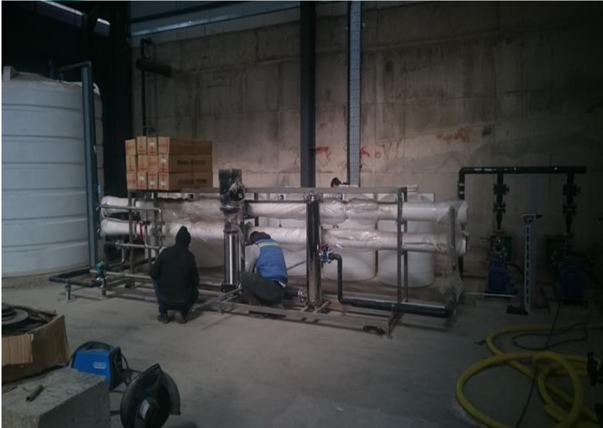
Reverse Osmosis Feeding Pumps , High Pressure Pumps and Reverse Osmosis System Installation