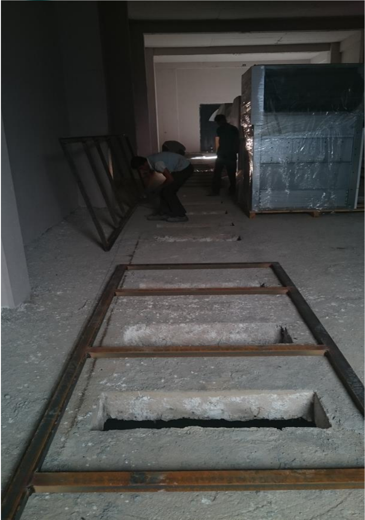
Electricity Main High Voltage Input Cells and Base Installation