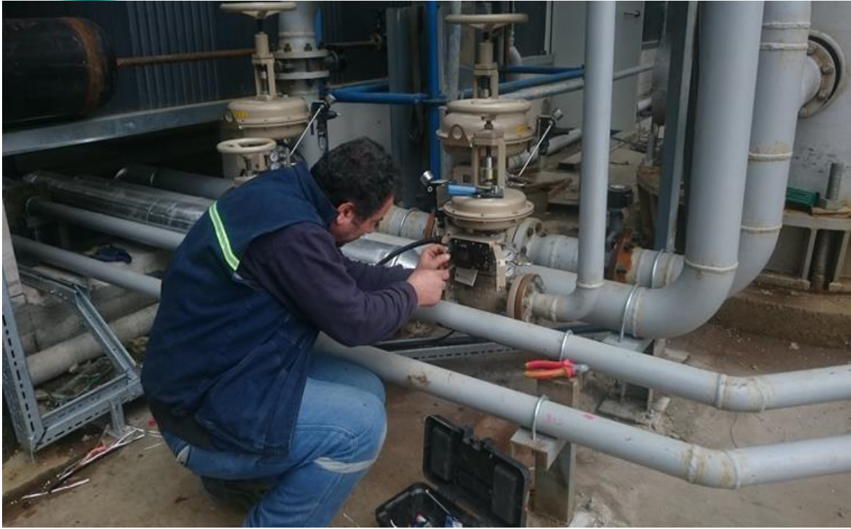
Instrument Cable Connection, I/O Tests