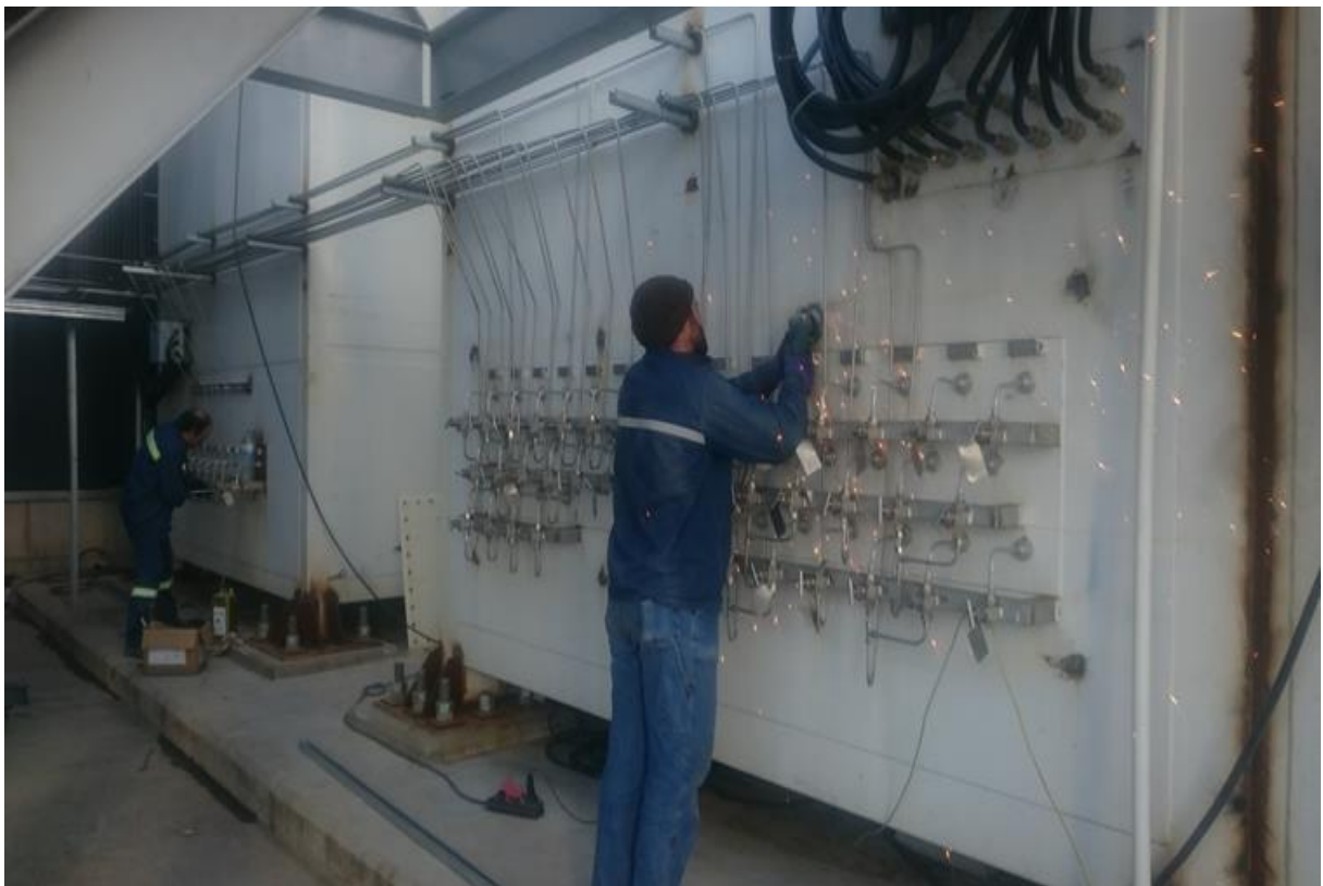
Product Analysis Measurement Pipelines