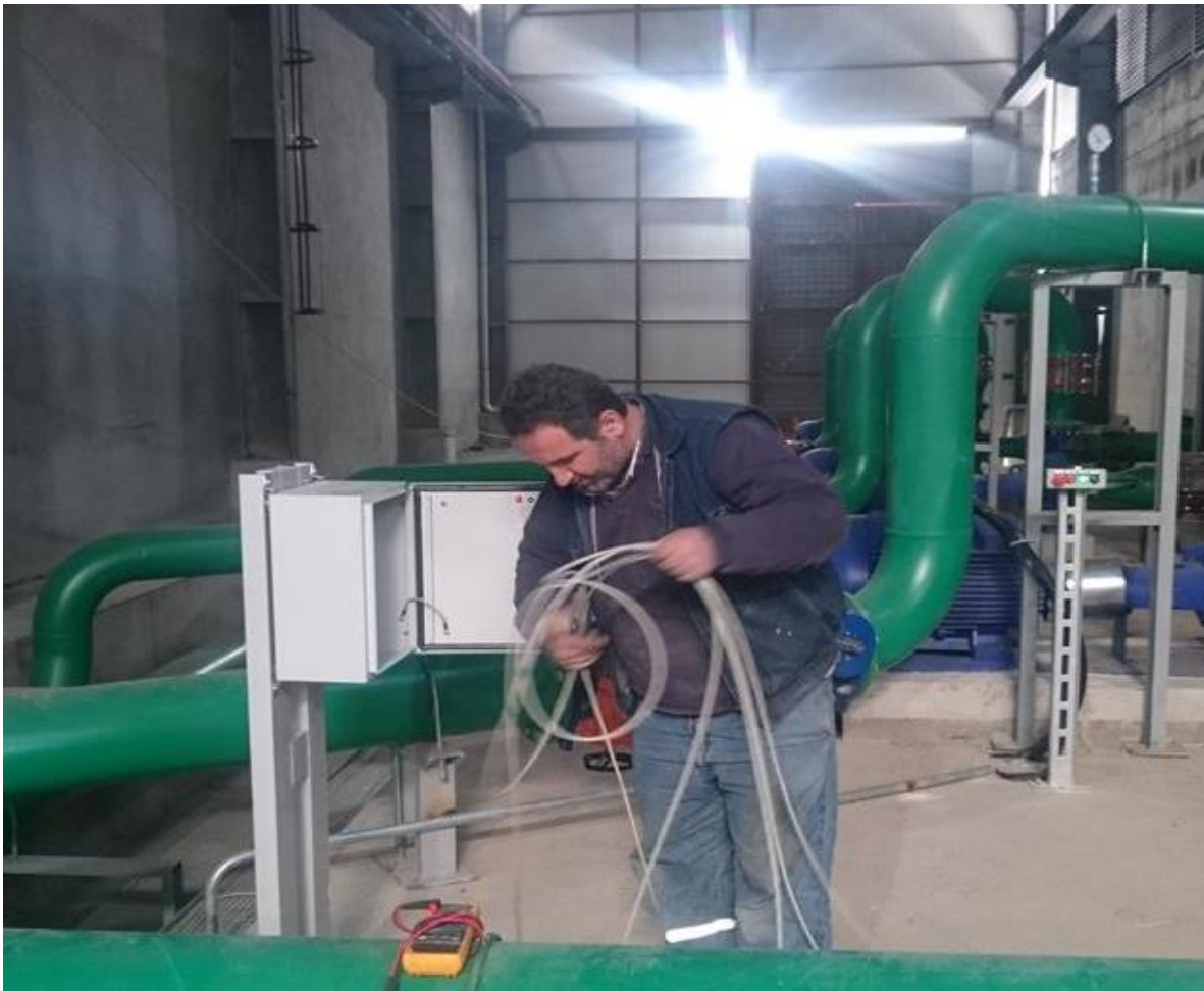
Water Treatment Plant Area Electric Box Cable Connection