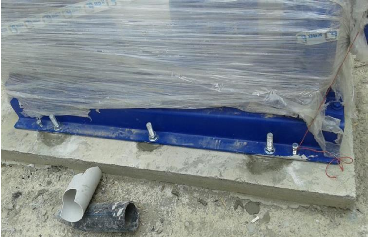
Circulation Pump Anchor Bolts and Electric Conduits