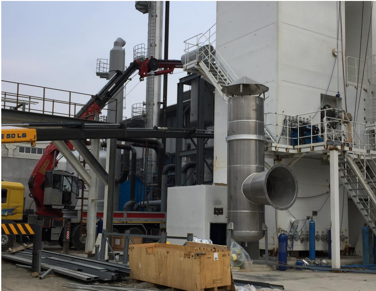
Exhaust and Silencer Installation