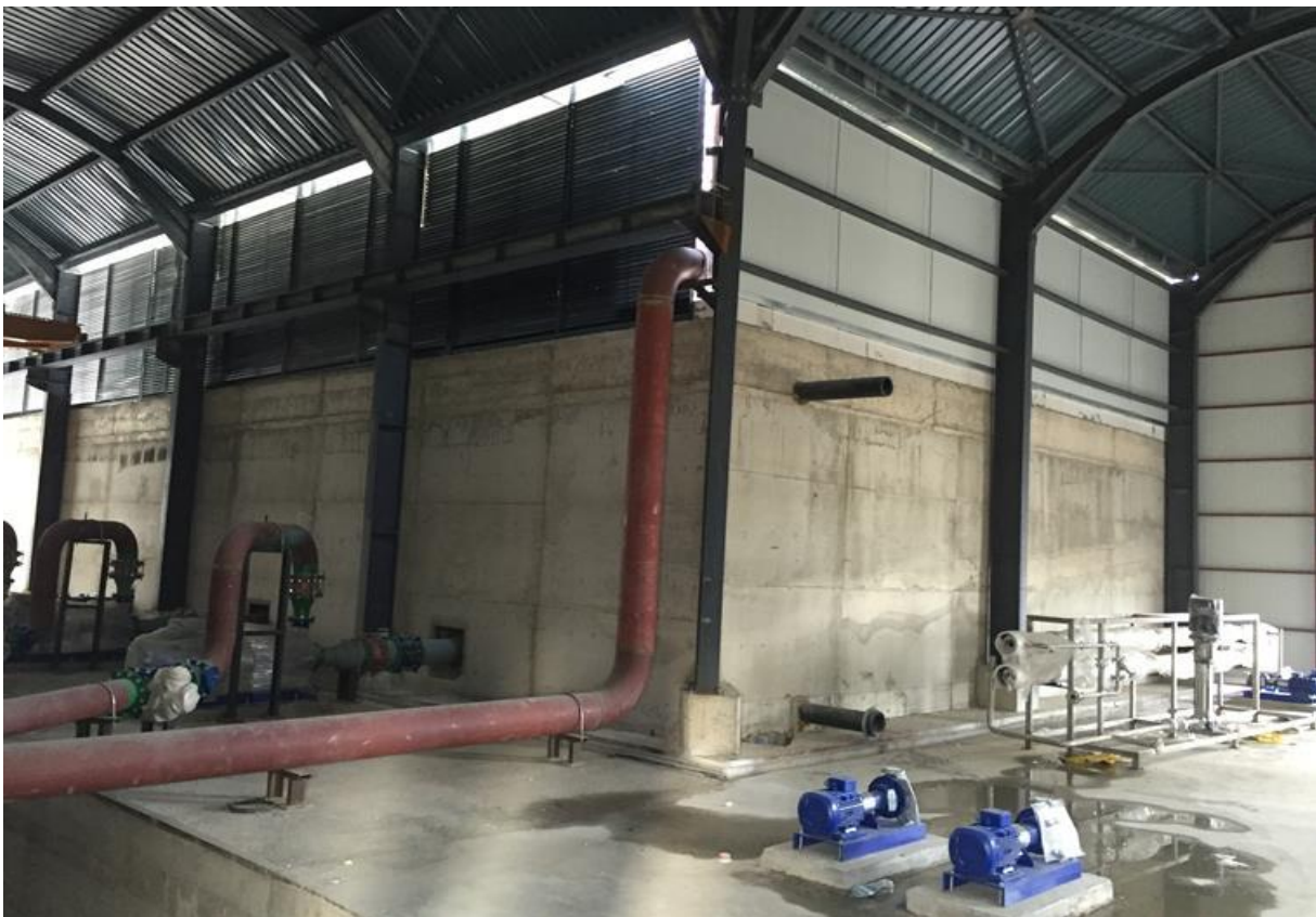
Make Up Water Pumps and Reverse Osmosis System Installation