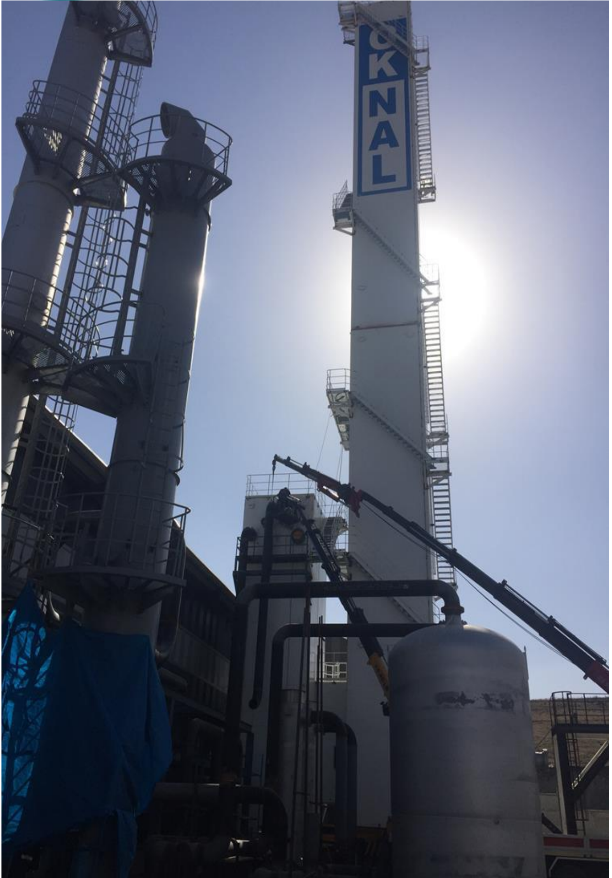
Piping ,Pipe Rack, Supporting Installation