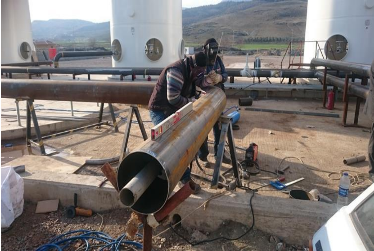
Pipeline Vacuum Insulation Installation