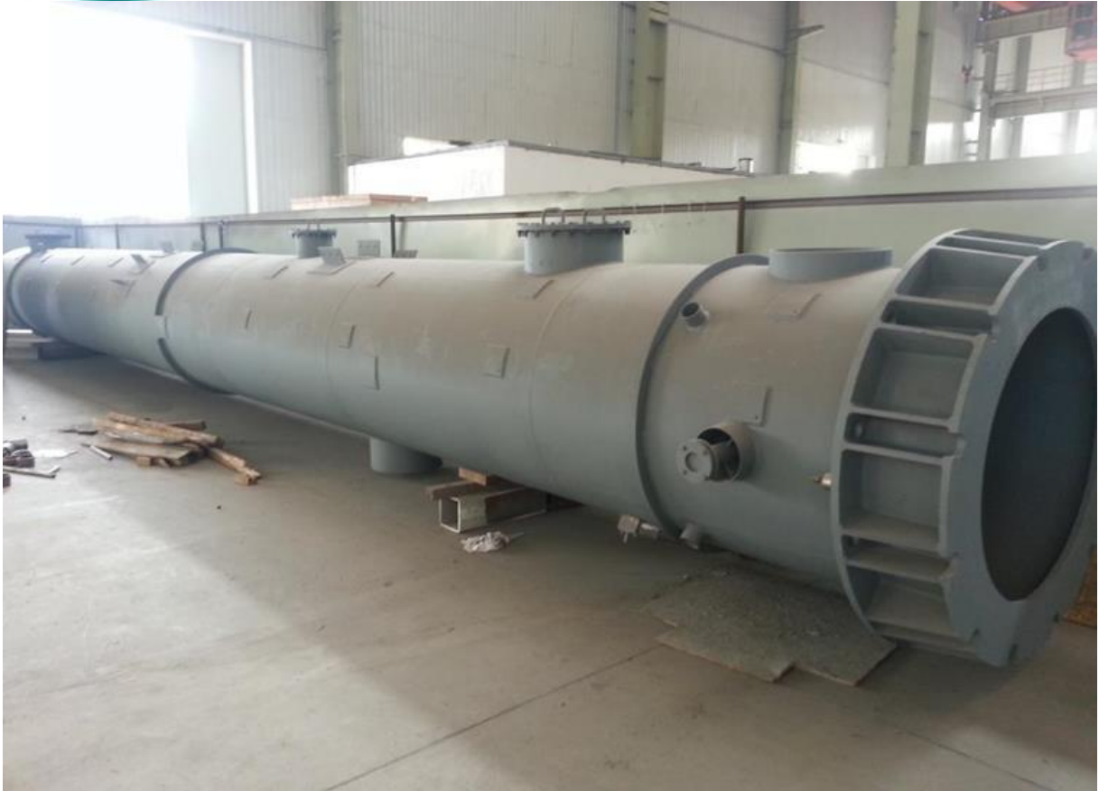
Water Cooling Tower Production (SASPG ASU Co.)