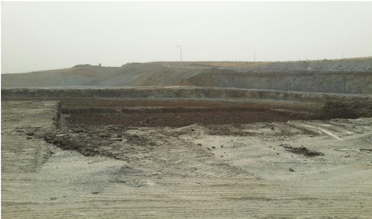
Air Separation Plant Area Excavation