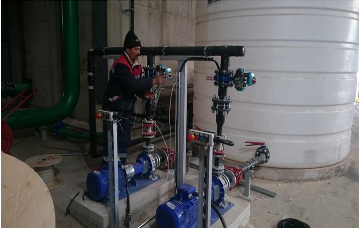
Make Up Pumps and Raw Water Tanks Installation