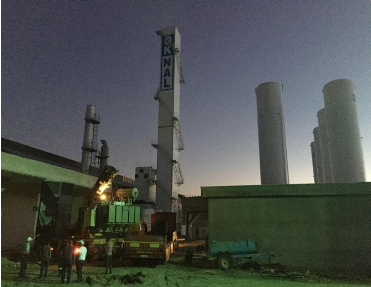
Main Transformer , Distribution Transformer Installation