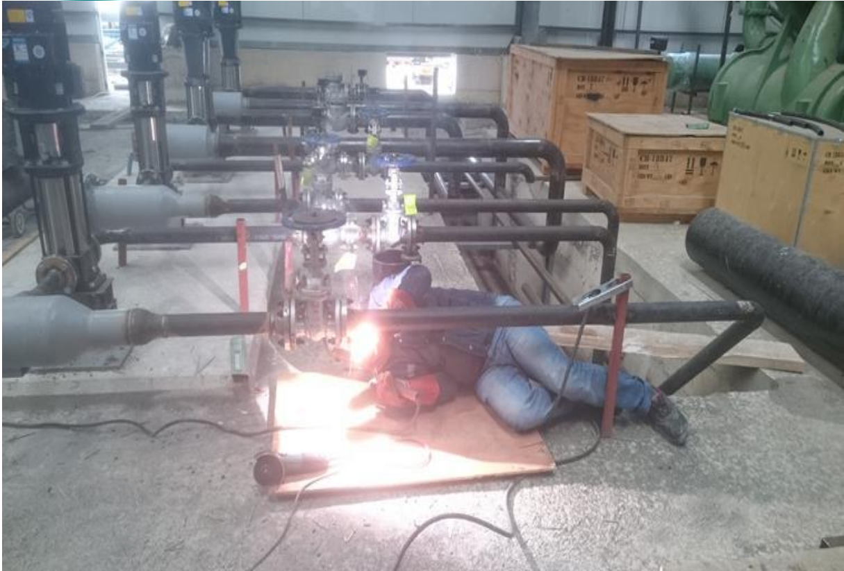
Air and Water Cooling Tower Pumps and Pipeline Installation