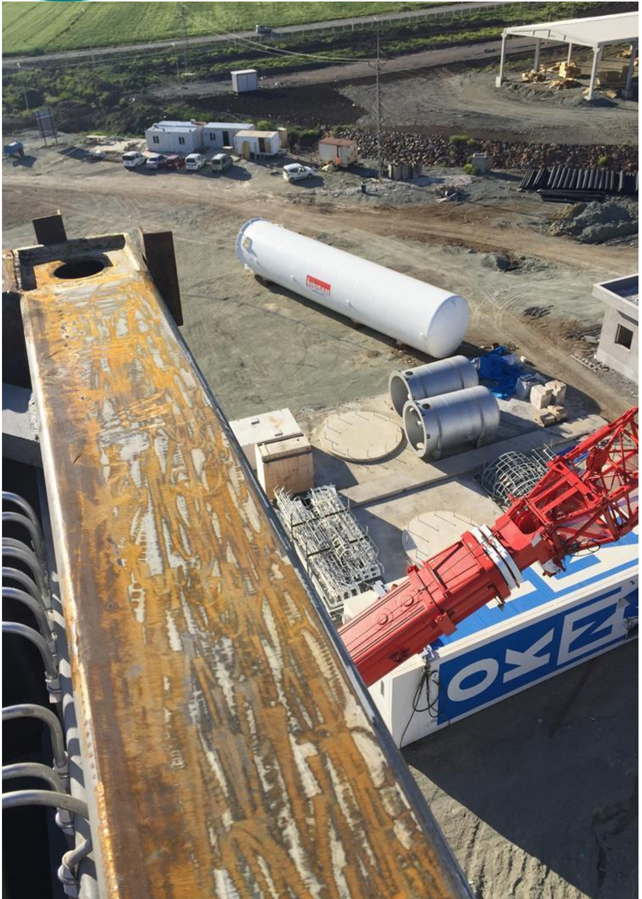
Cold Box Upperside Installation