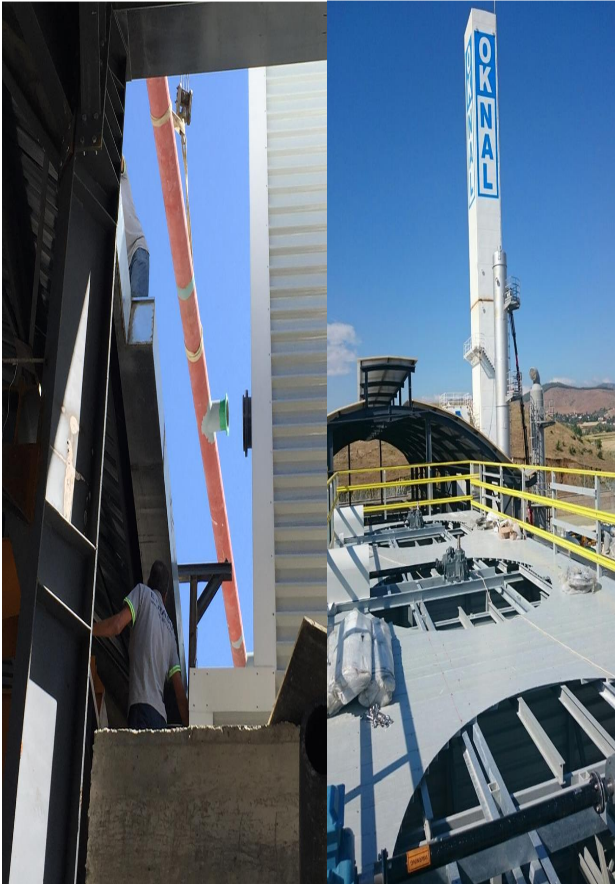
Cooling Tower Inlet Pipeline and Fans Installation