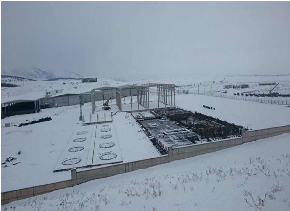
Product Storage Tank Embedded Plates and Anchors