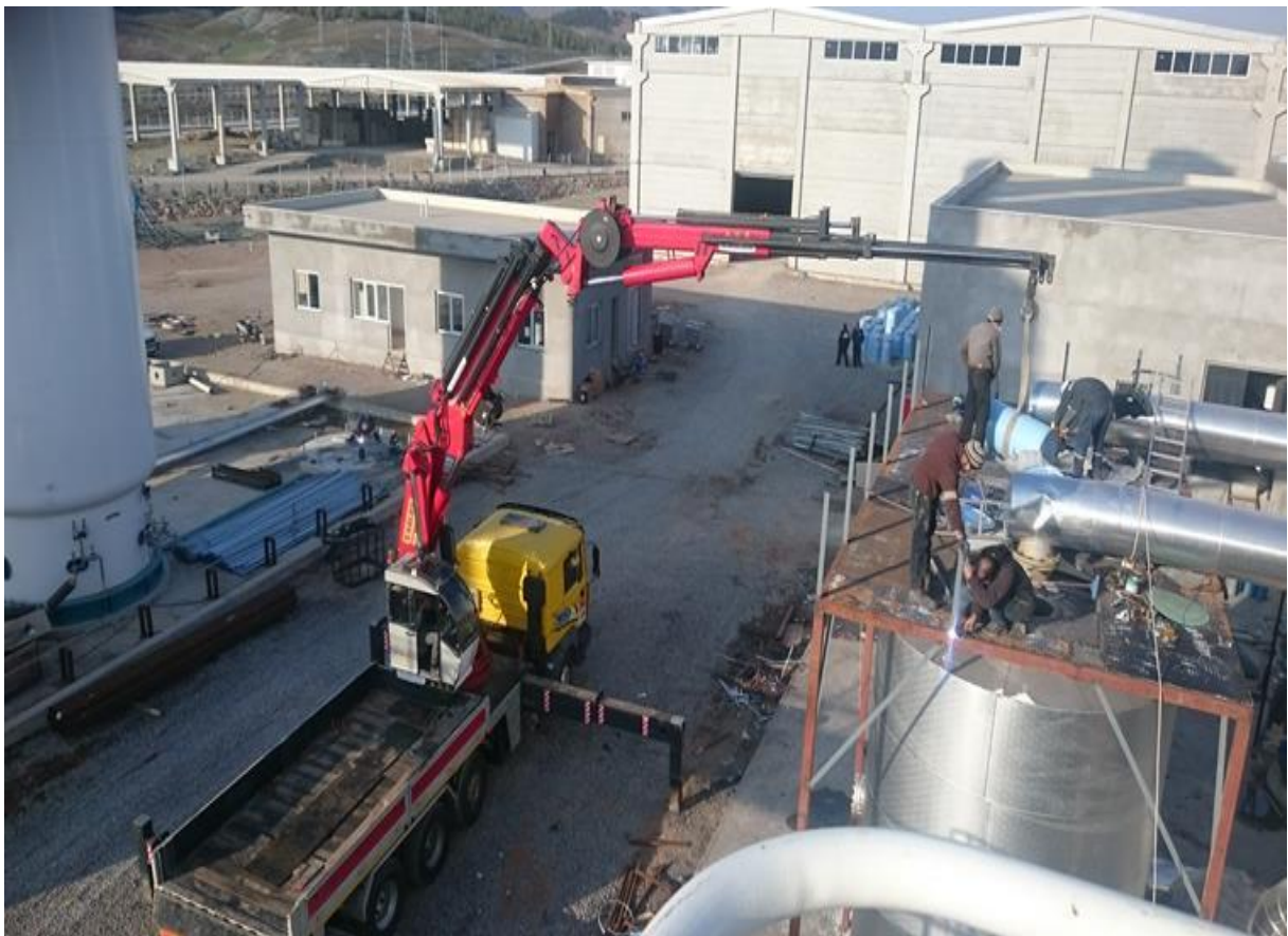
Molecular Sieve Element Filling