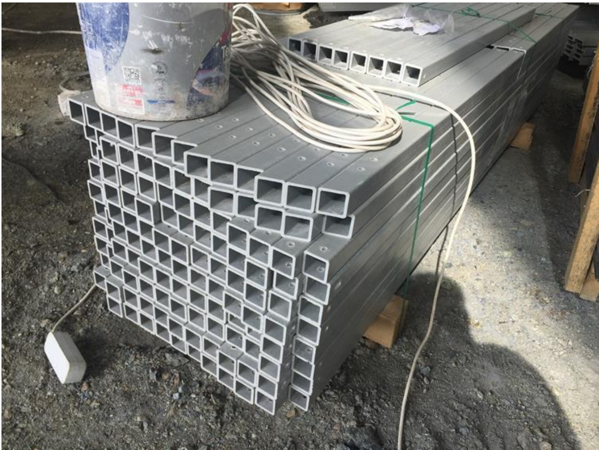
Cooling Tower Construction FRP Materials