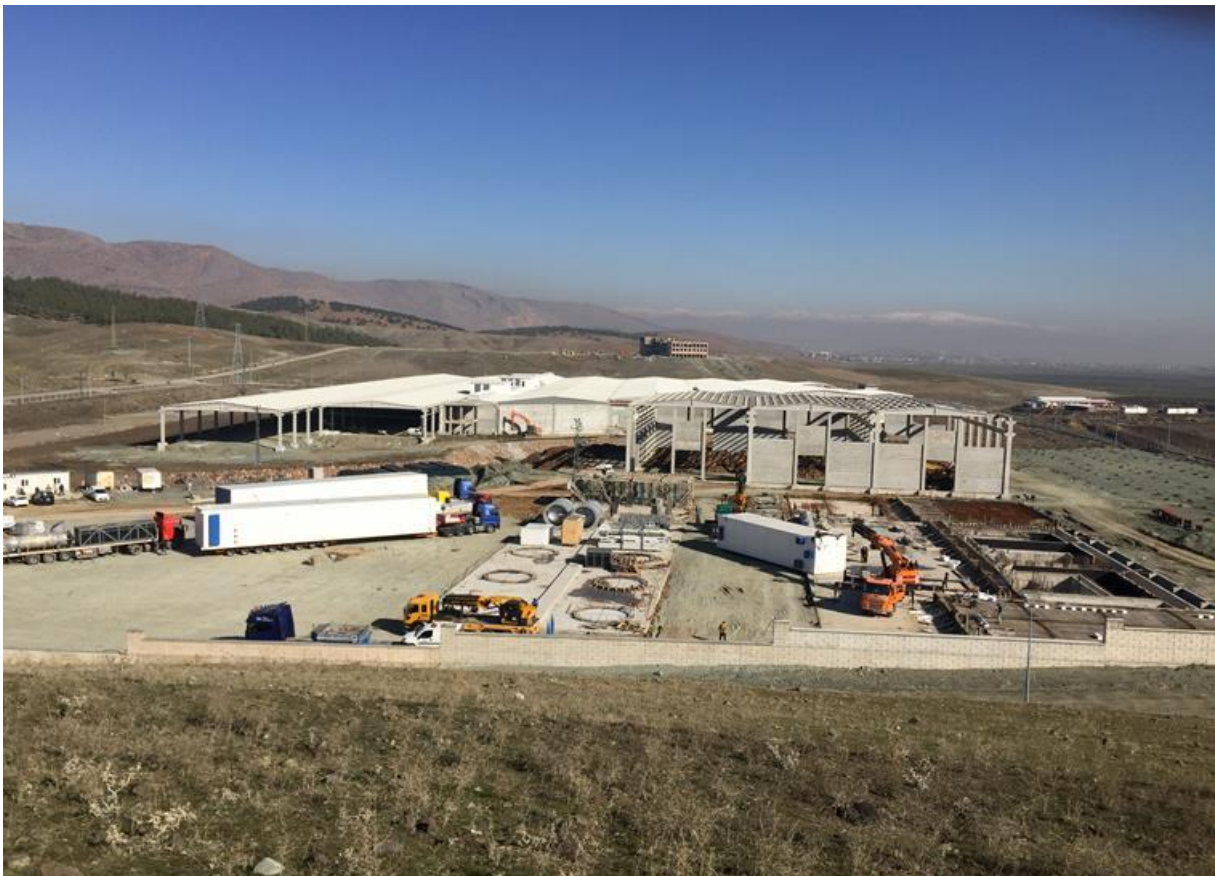
Air Separation Plant General Appearance