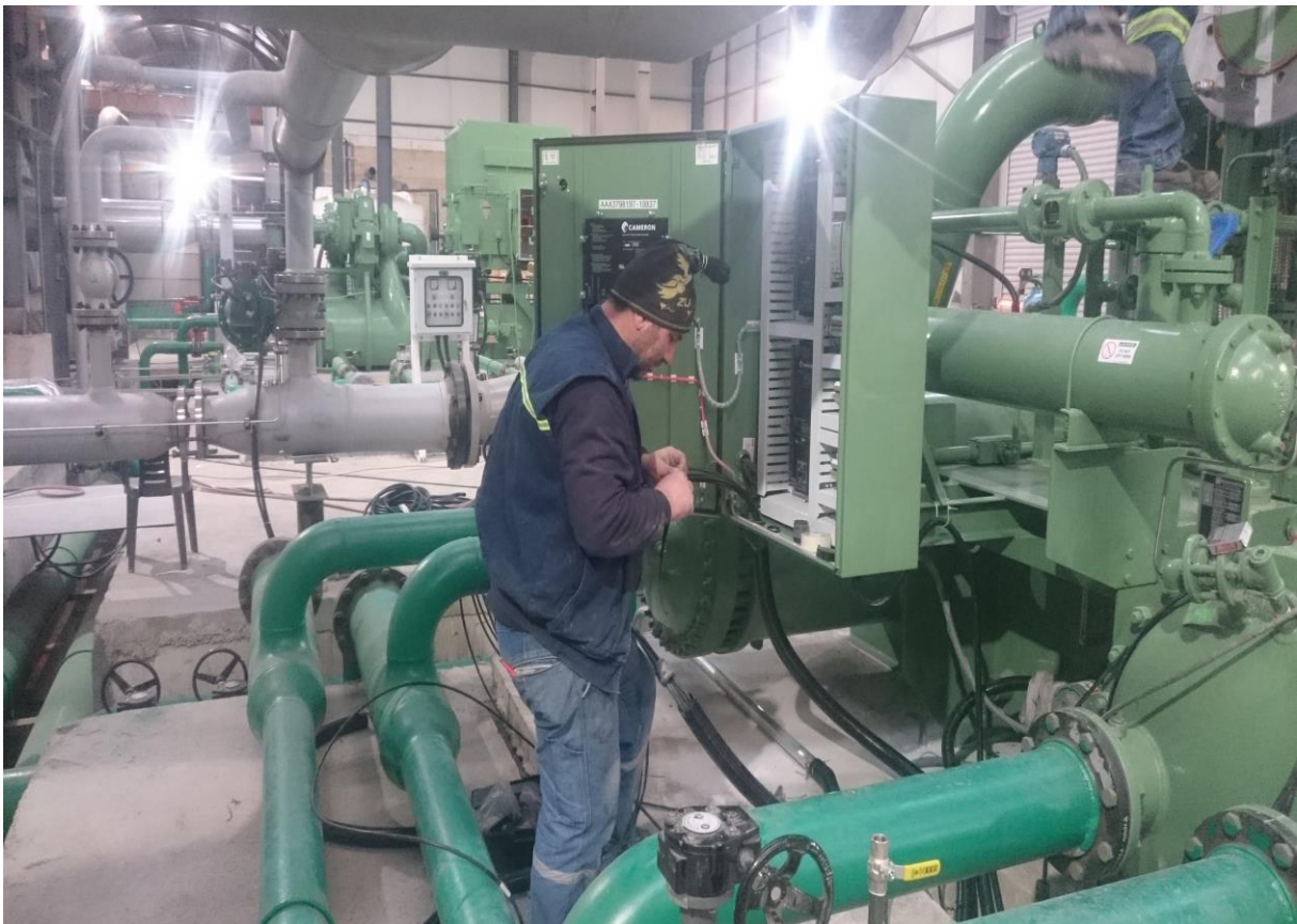
Booster Compressor Control Panel Cable Connection