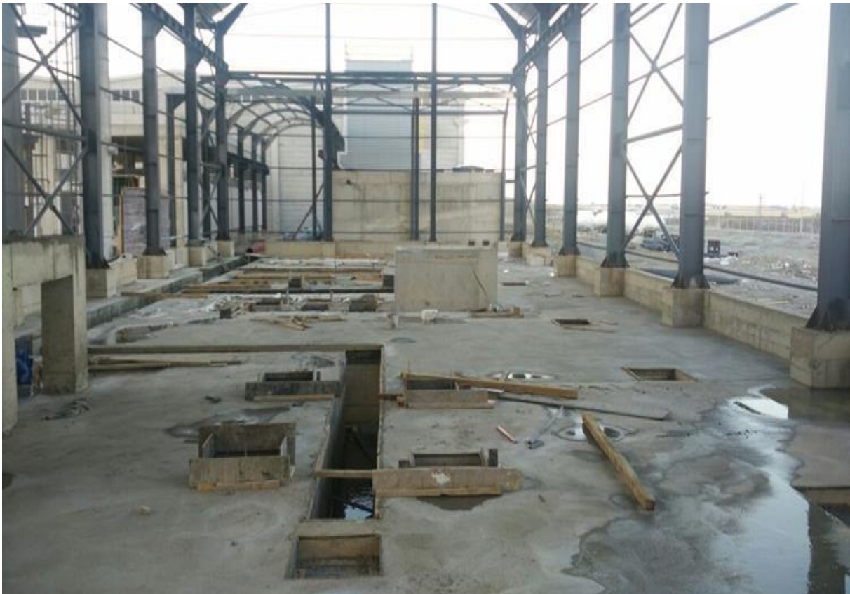
Pipe and Cable Galery