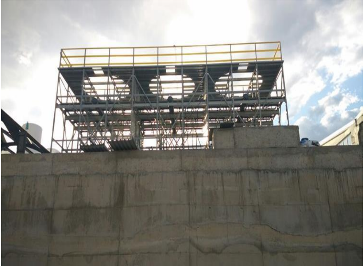
Cooling Tower FRP Carcass For Fans Installation