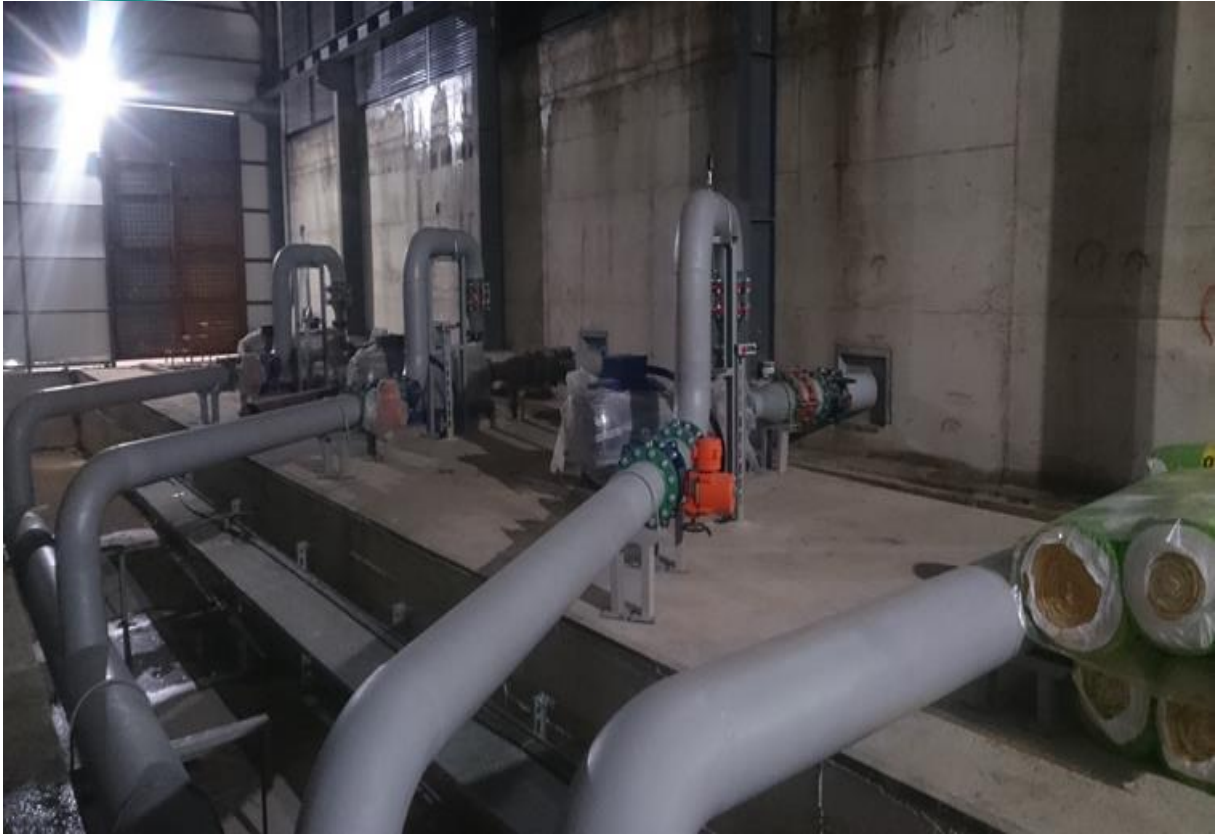
Circulation Pumps, Cable , Cable Trays and Pipeline Installation