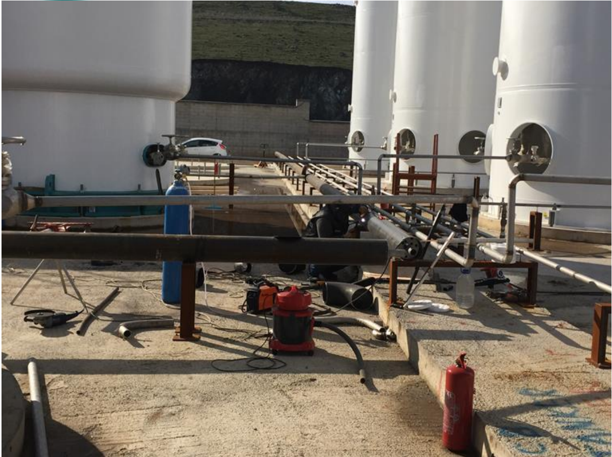
Storage Tank Filling and Shipment Pipeline Installation