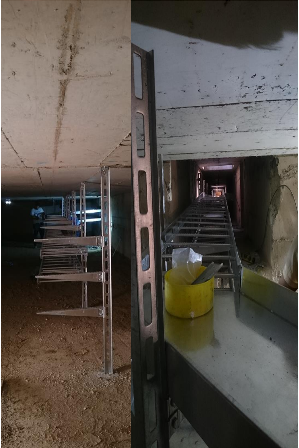
Cable Tray Installation to Cable Gallery