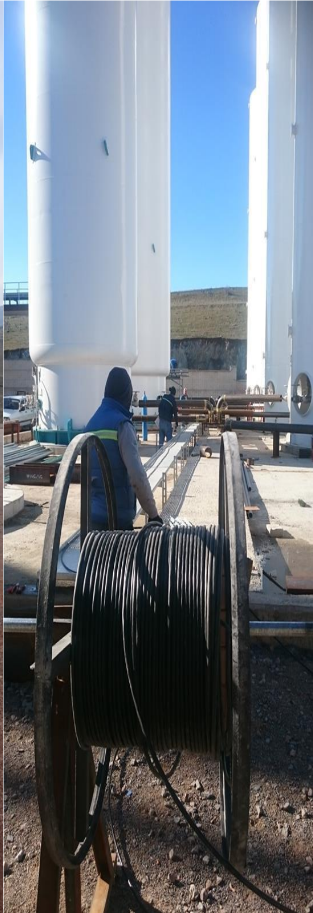
Cable Pull to Cable Tray