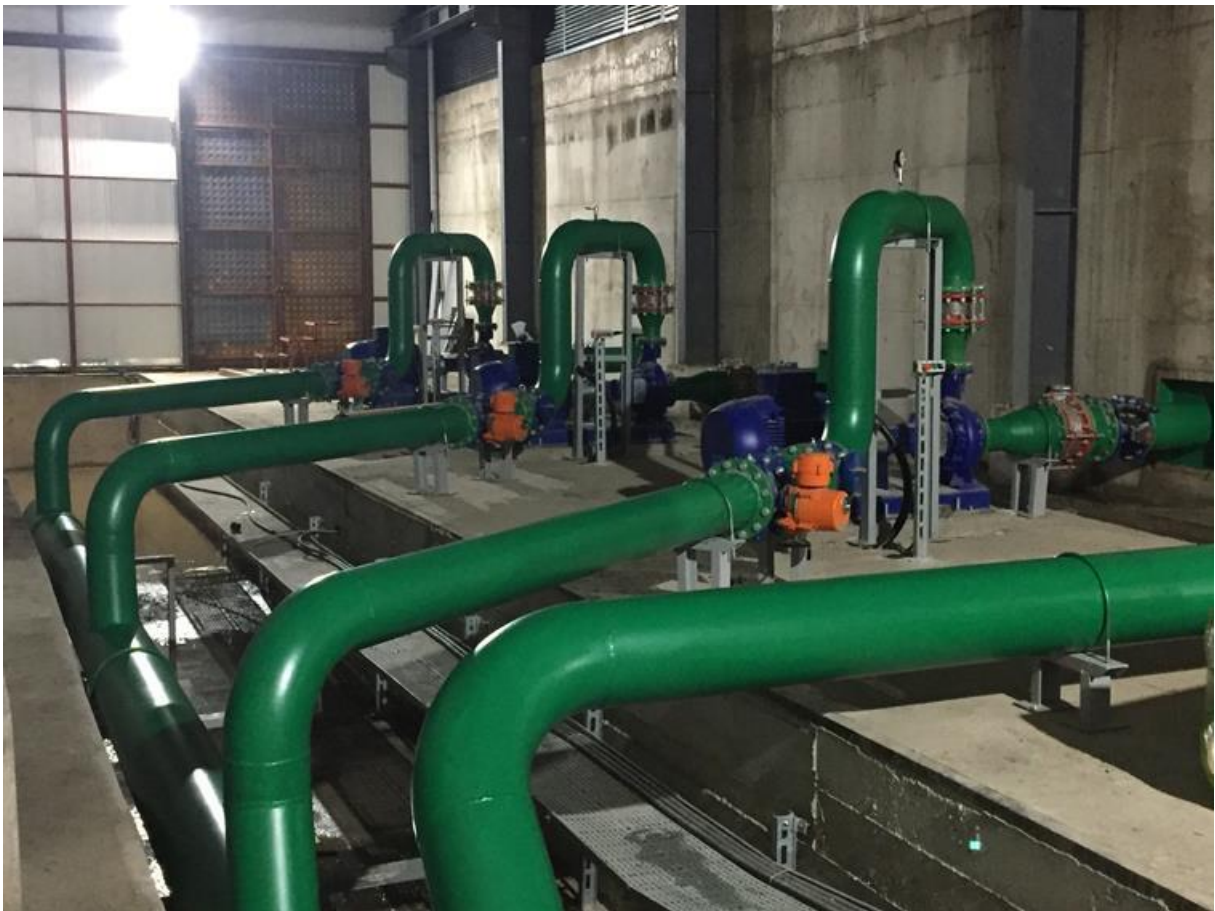
Circulation Pumps Commissioning