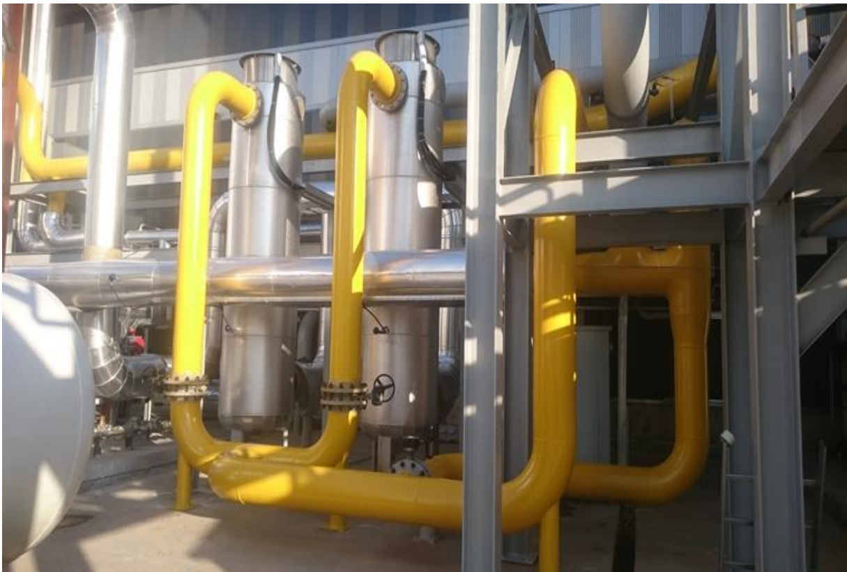
Main Heater Area General Appearance