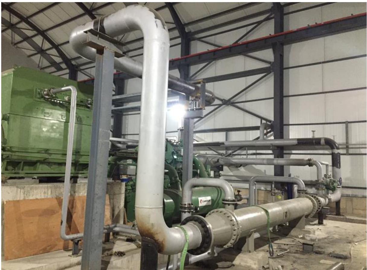
Booster Compressor Main Heat Exchanger and Pipeline ,Supports Installation