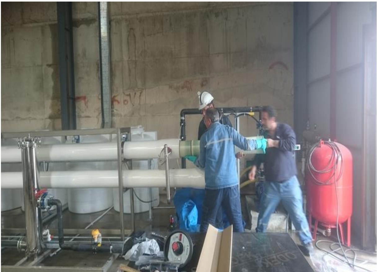
Reverse Osmosis Membrane Filter Installation