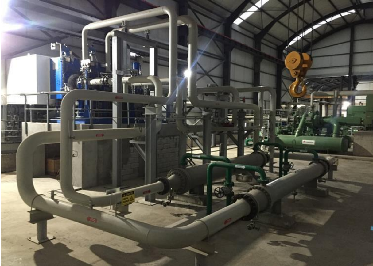
Main Türbine Commissioning with Supervisor