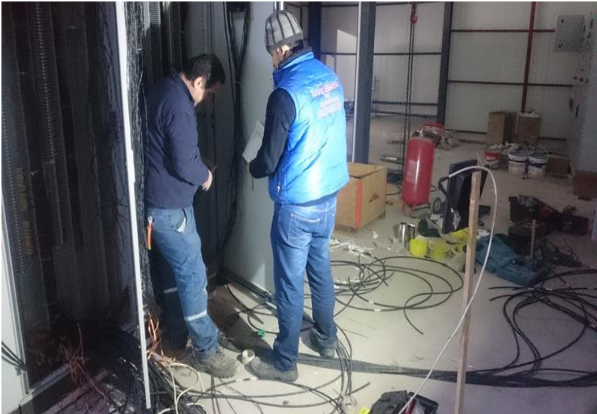
Instrument and Control Panels Cable Connection