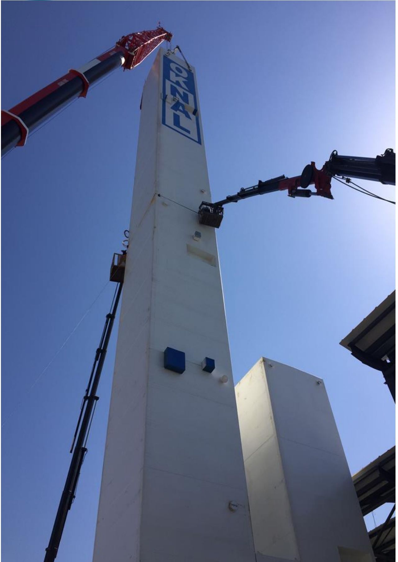
Cold Box Upperside Horizontal and Vertical Adjustments