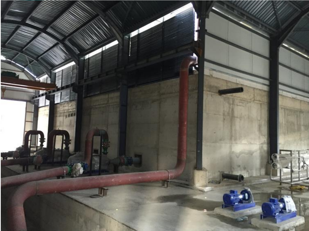
Circulation Pump Pipeline Installation