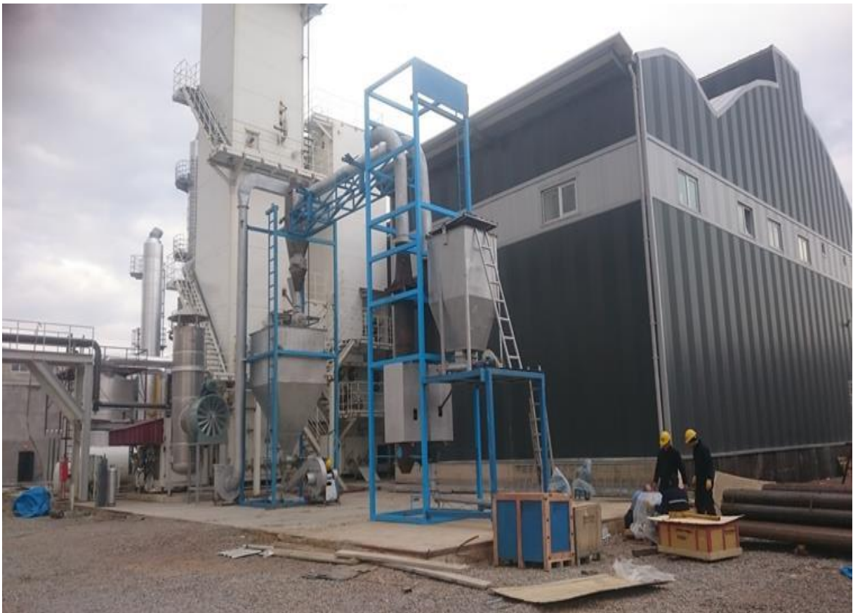
Main Heat Exchanger and Coldbox , Explosion and Filling to Perlite