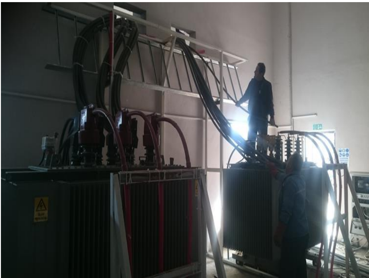
Main Transformer , Distribution Transformer Installation