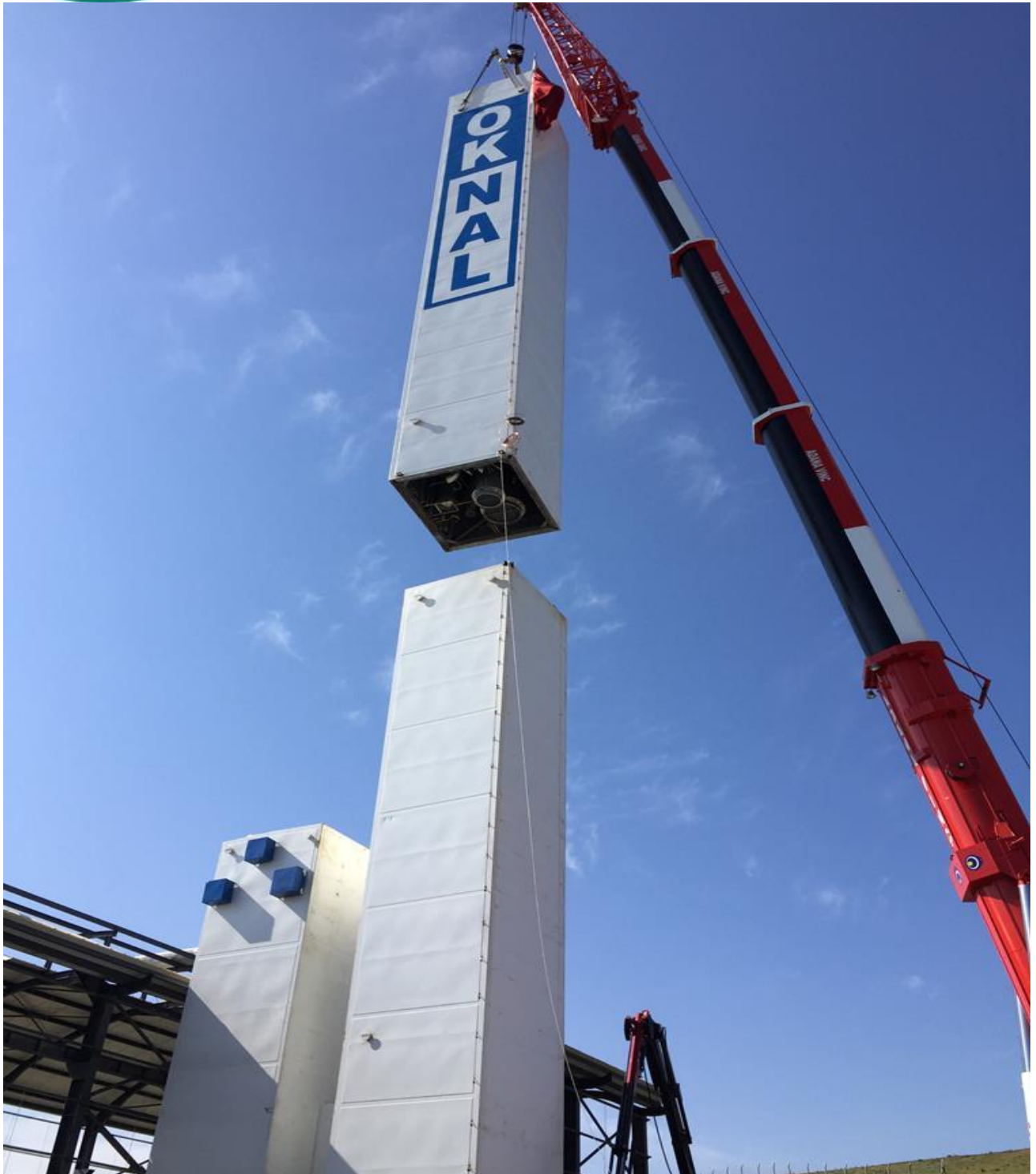
Cold Box Upperside Installation