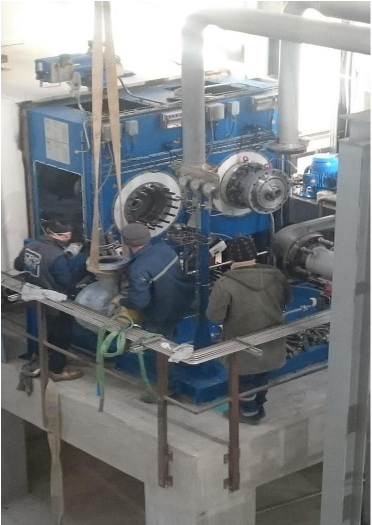
Main Turbine Installation