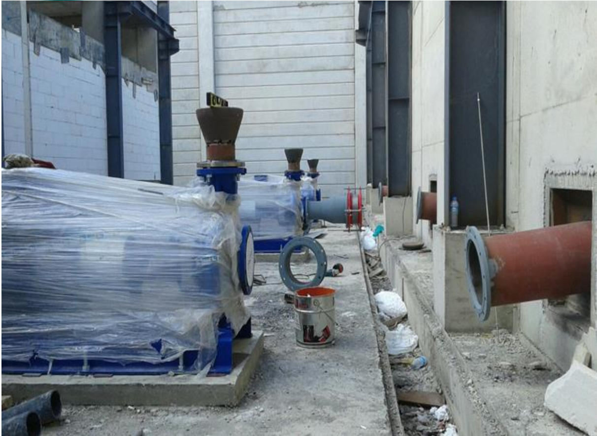
Circulation Pump Suction Pipeline Installation