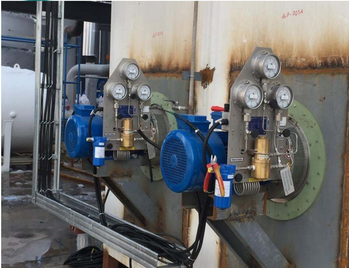
Argon Pumps Installation