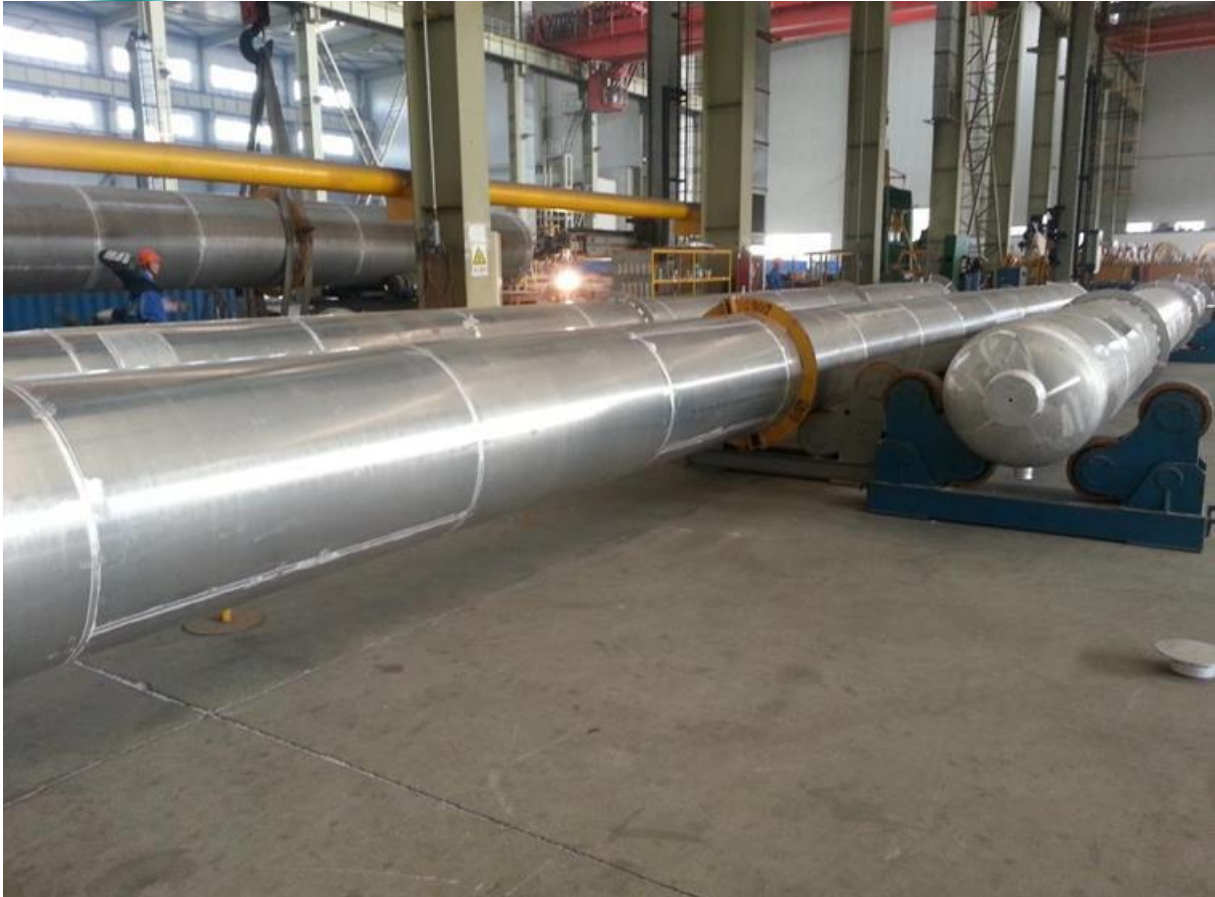
Cold Box Inside Production (SASPG ASU Co.)