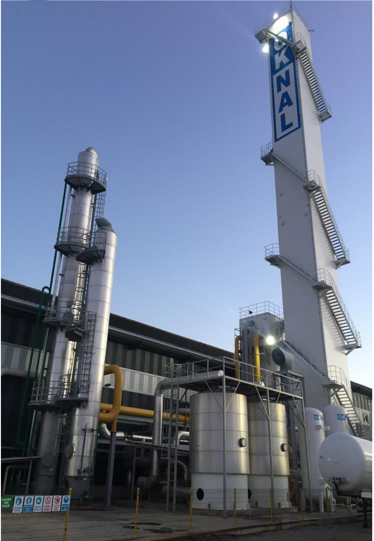
Air Separation Plant General Appearance