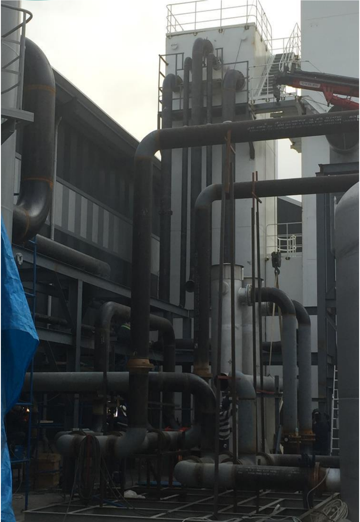
Piping ,Pipe Rack, Supporting Installation