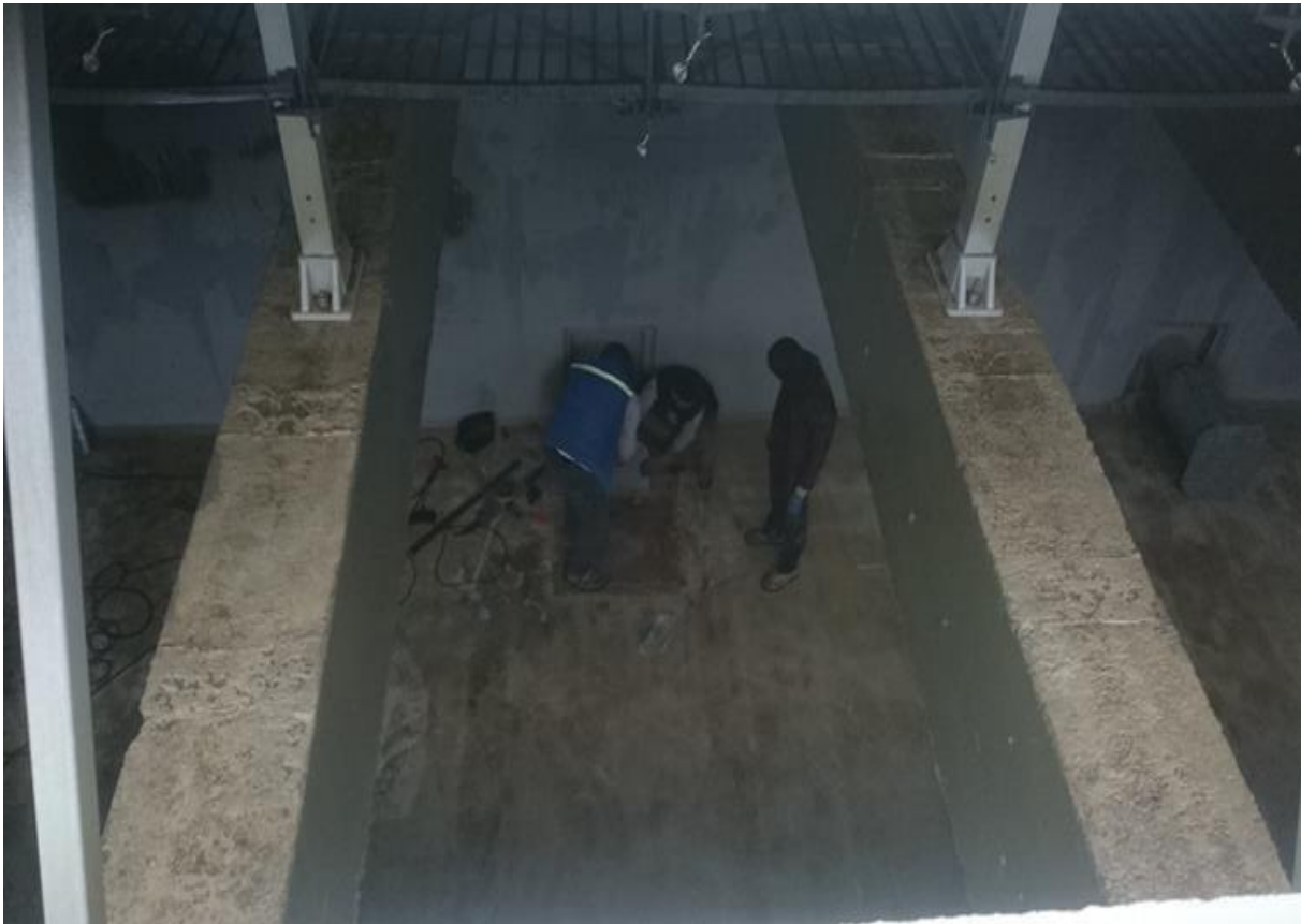
Water Basin Circulation Pump Suction Strainer Filter Installation