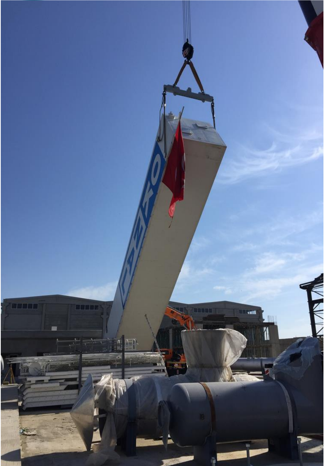
Cold Box Upperside Installation