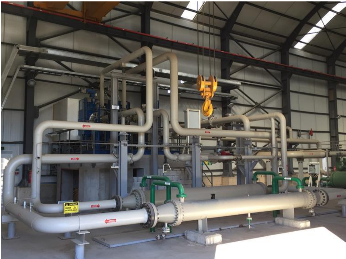
Main Turbine Heat Exchangers and Pipeline Installation