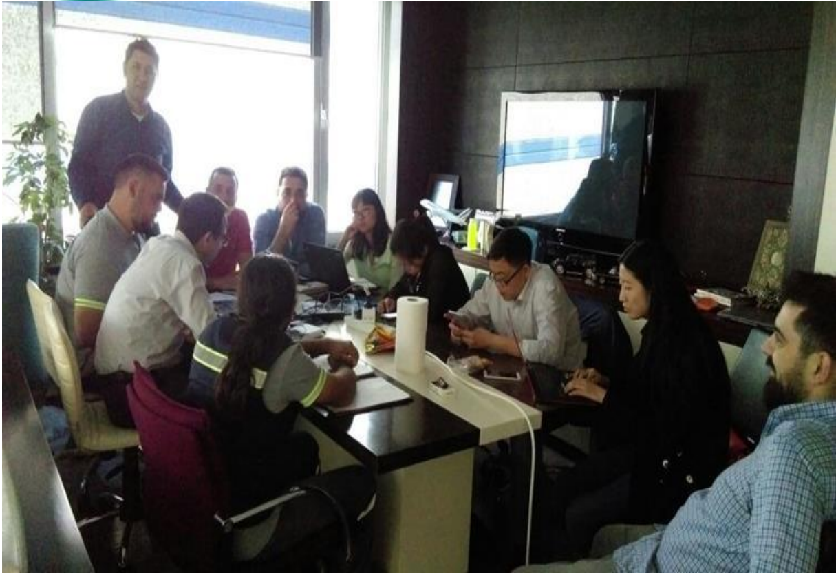
Kick Off Meeting